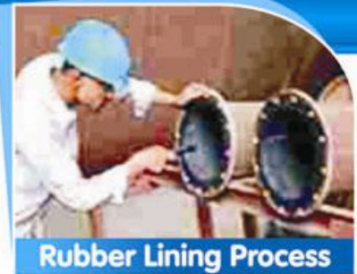
Rubber Lining Process