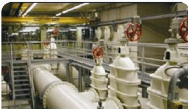
Water Treatment Plant

Rubber lining for tanks, pipes, bends, L-bow, flanges, valves in water treatment