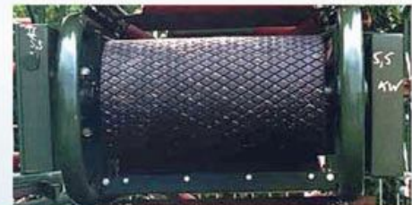
Checked rubber lagging for belt conveyor driving end Pulley