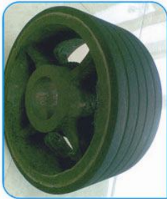
Rubber lining for wheels for heavy trolley

Rubber lining for pump body, casing & impeller for Caustic, Sulphur & other Chemical application