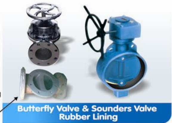
Butterfly Valve & Sounder Valve Rubber Lining