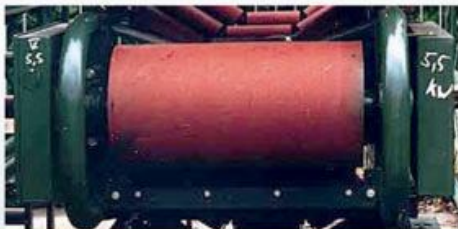
Plane Rubber lagging for belt conveyor non-driving end pulleys