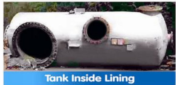
Tank Inside Lining