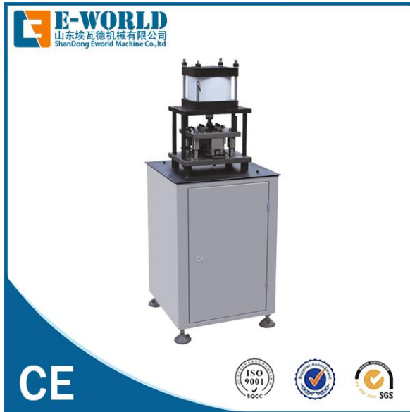
8.9 仿型铣 copy milling machine