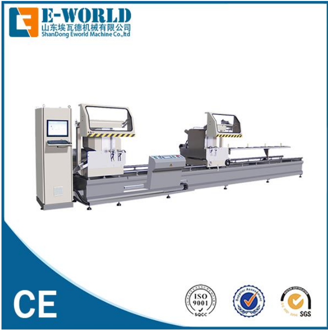
8.5 角码锯 corner connector saw