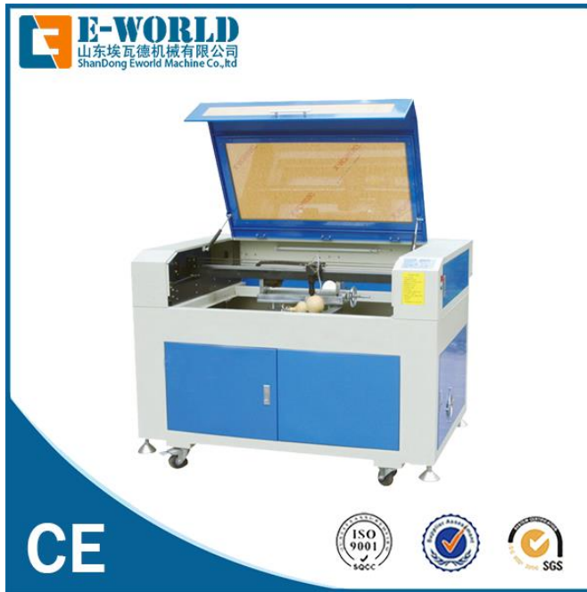
6.6 玻璃丝网印刷机 Glass printing machine