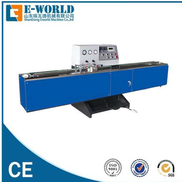
4.6 中空玻璃充气机 insulating glass gas filling machine