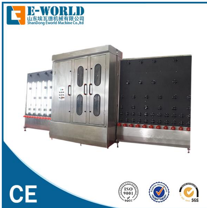
6.玻璃深加工机器 Glass processing machine