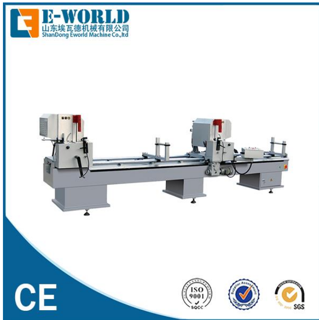
8.3.数显双头精密锯 digital display double head precision saw