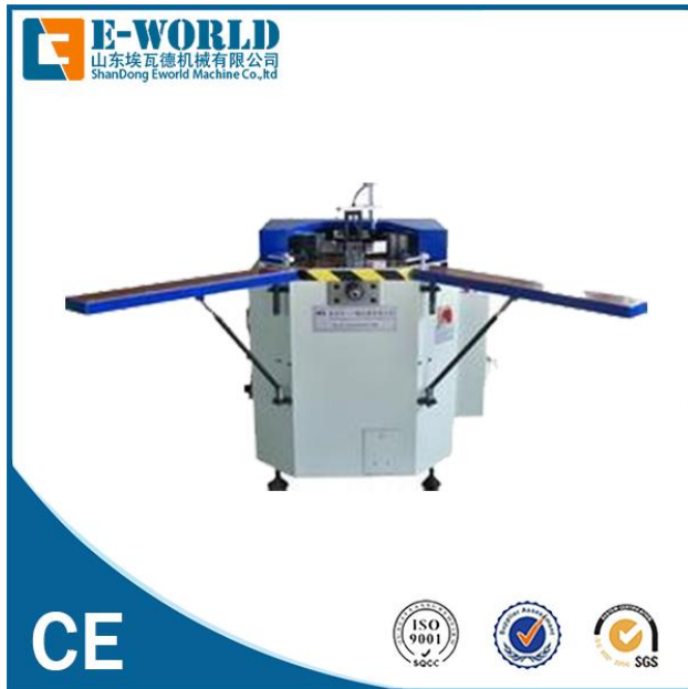
8.7 端面铣 end milling machine