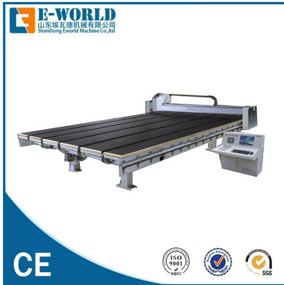
2.3 全自动玻璃切割线 automatic glass cutting production line