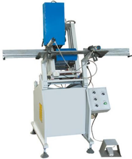
7.8 仿型铣 copy milling machine