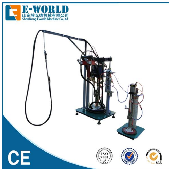
4.4 自动中空玻璃密封胶线 automatic insulating glass sealing machine