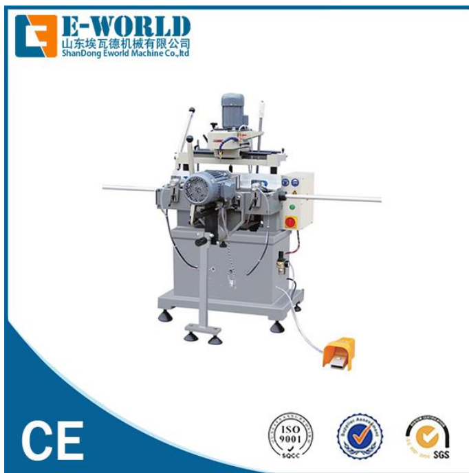
7.7 水槽铣 water-slot milling machine