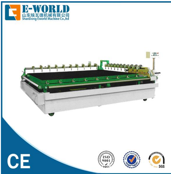
2.5 马赛克玻璃切割机 Mosaic glass cutting machine