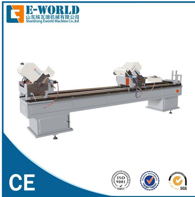
7.2 单点焊 One head welding machine