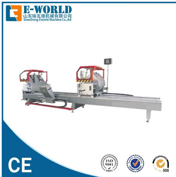
8.4 数控全自动切割锯 CNC automatic double head miter saw