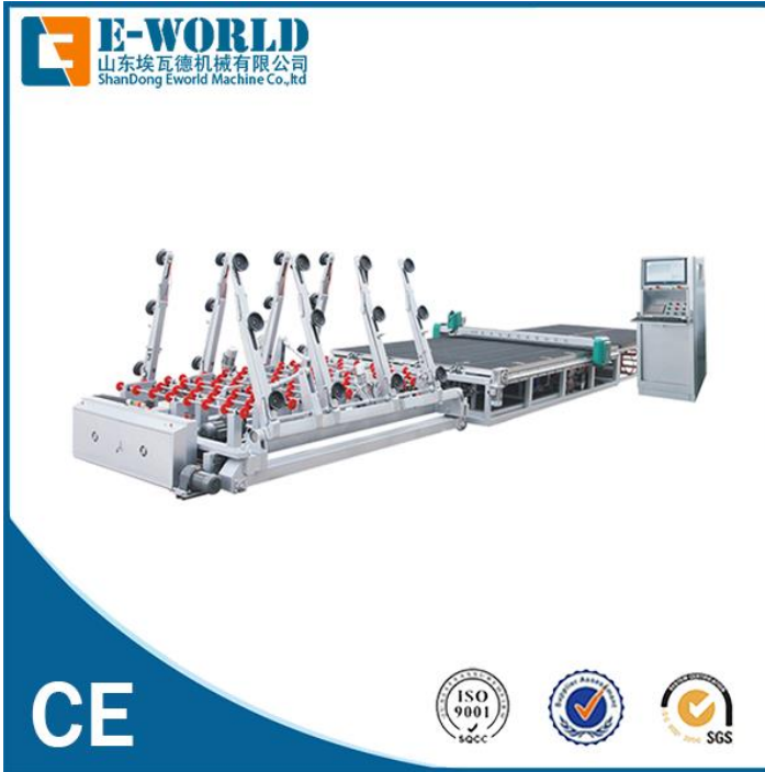
2.4 半自动玻璃切割机 semi-automatic glass cutting machine