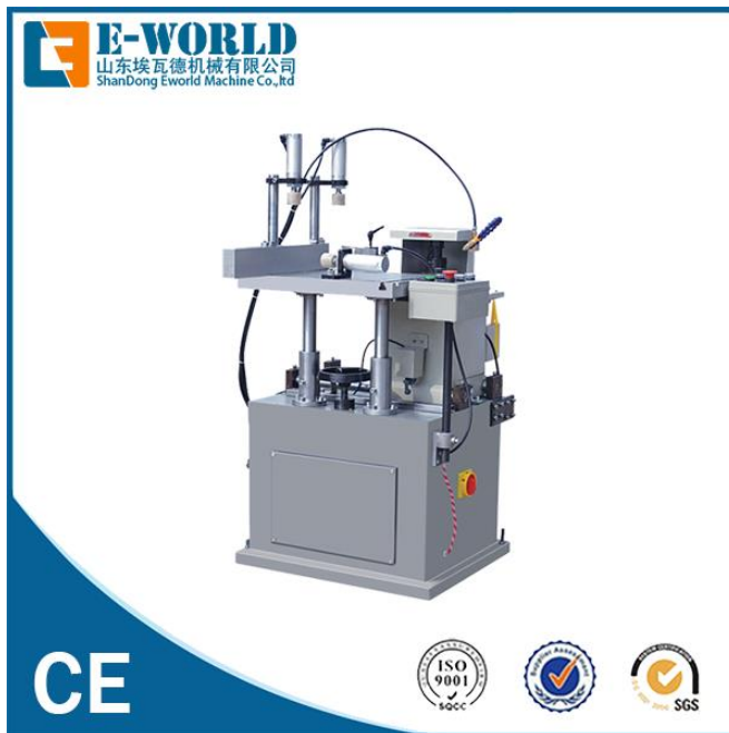
8.8 铝合金五金件冲压机 aluminum hardware punching machine