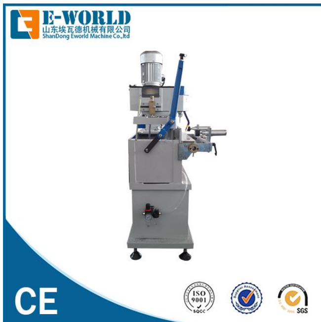
8.10 铝型材弯圆机 aluminum profile bending machine