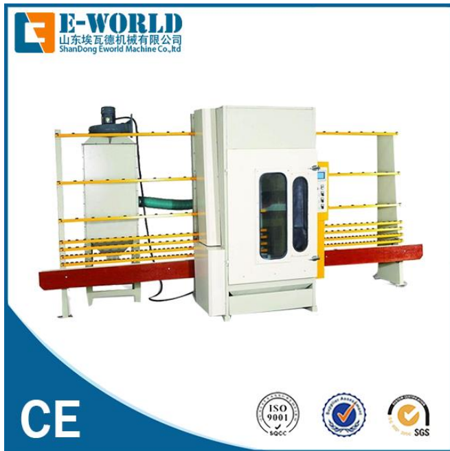
6.2 玻璃打孔机 Glass drilling machine