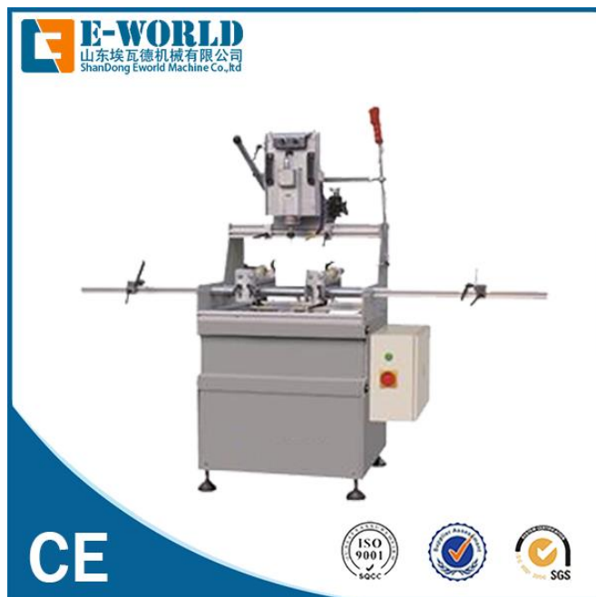
7.9 圆弧机 arc bending machine