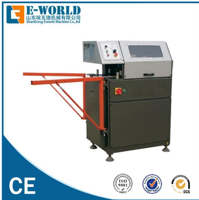
7.6 锁孔槽加工机 lock hole processing machine