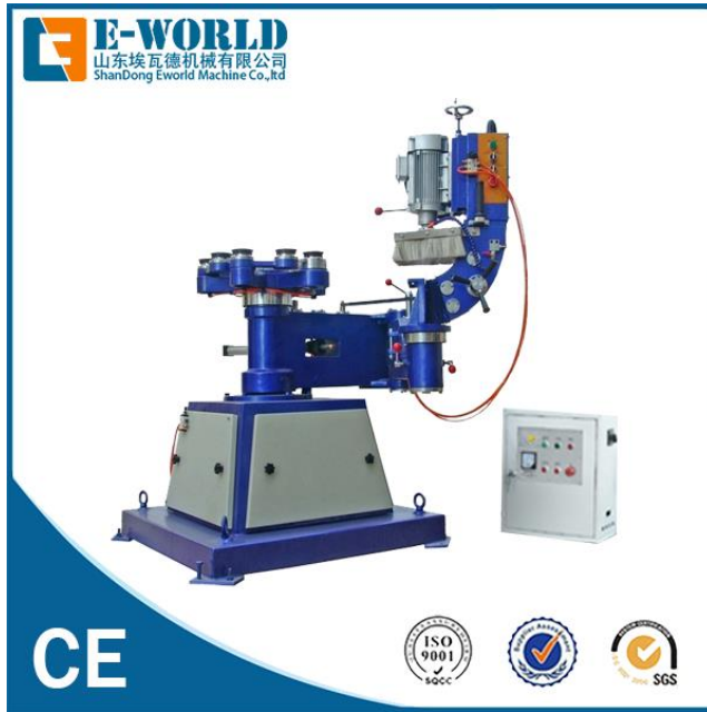
1.4 卧式小型玻璃磨边机 Horizontal small glass grinding machine