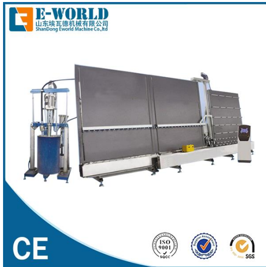
4.5 中空玻璃丁基胶涂布机 insulating glass butyl extruder machine