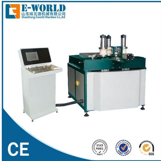
8.11 多头钻孔机 multi head drilling machine