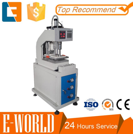
7.3 两位焊接机 two head welding machine