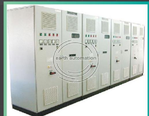
PLC & HMI Based Control Panel