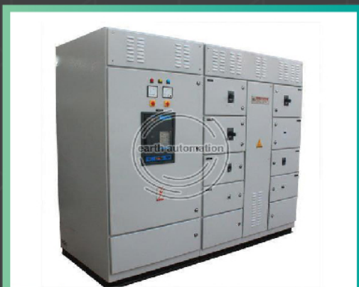
Power Distribution Control Panel