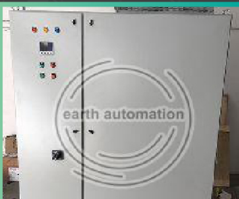
VFD Drive Control Panel