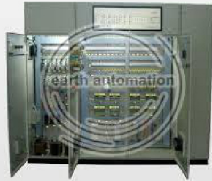
Annunciator Control Panel