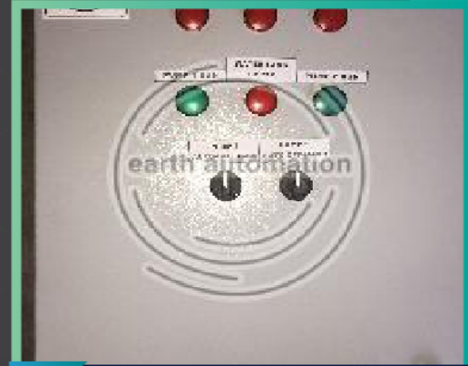
Twin Pump Control Panel