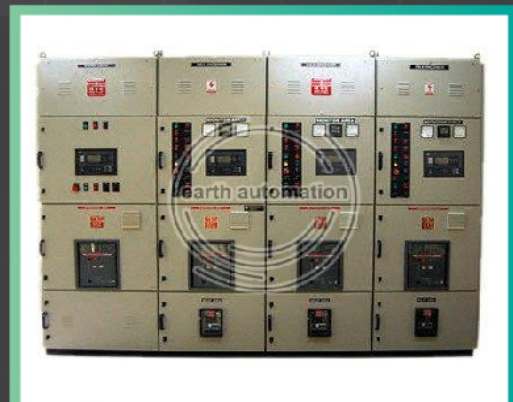
DG Synchronizing Control Panel