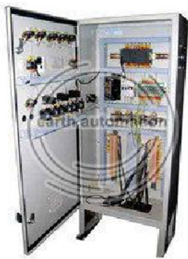
AC Drive Based Control Panel