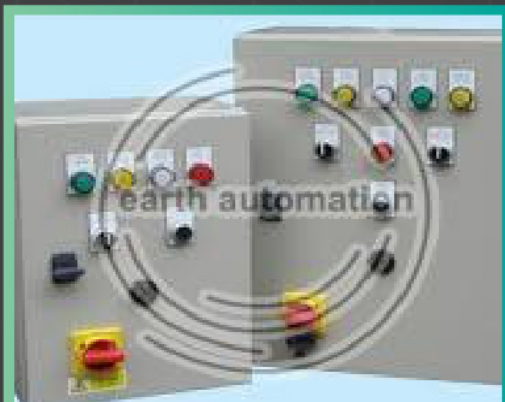
Motor Control Panel