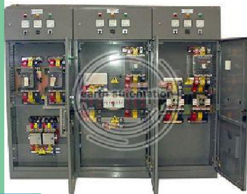
Auto Transformer Starter Panel