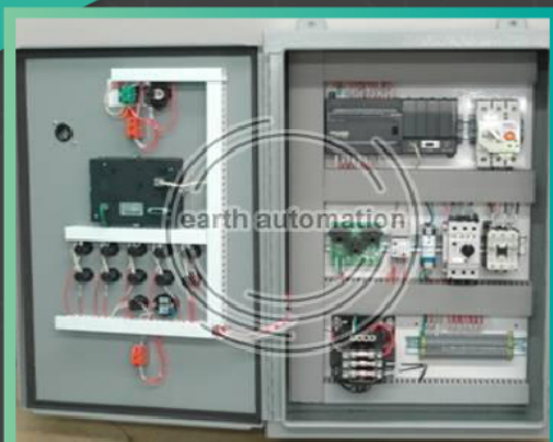
PLC Based Control Panel