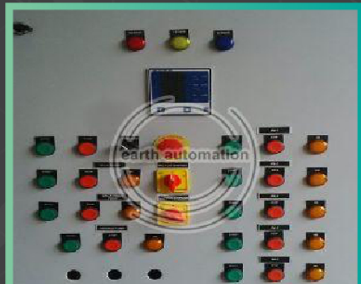
Water Pump Control Panel