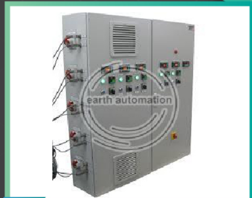
Thyristor Control Panel