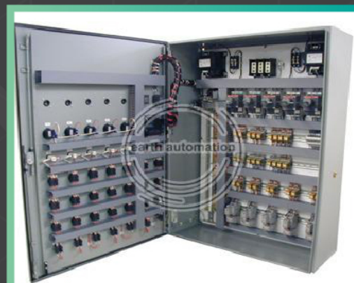
Relay Based Control Panel