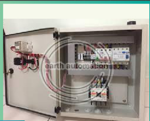
SSR Based Control Panel