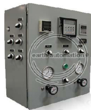
Instrumentation Control Panel