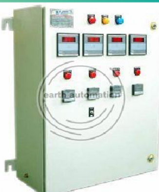
DC Drive Based Control Panel