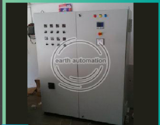
SCADA Control Panel