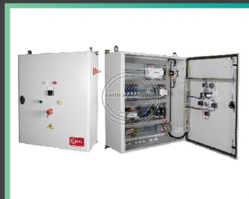
Power Control Panel