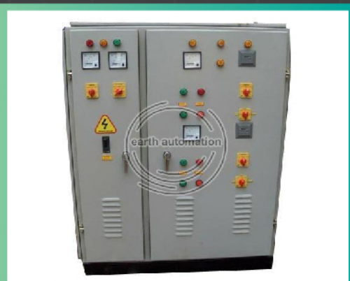
DOL Starter Control Panel