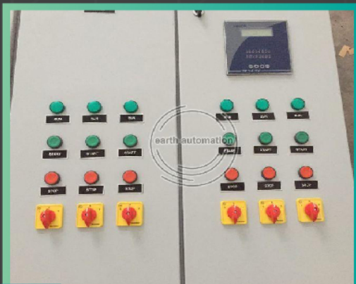
APFC Control Pannel