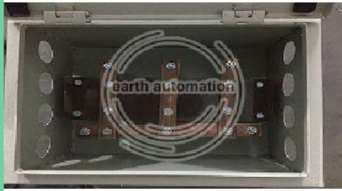
Busbar Control Panel