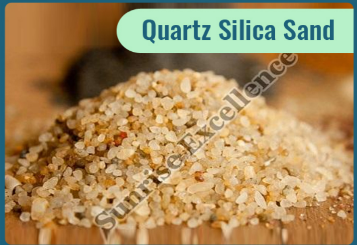
Quartz Silica Sand