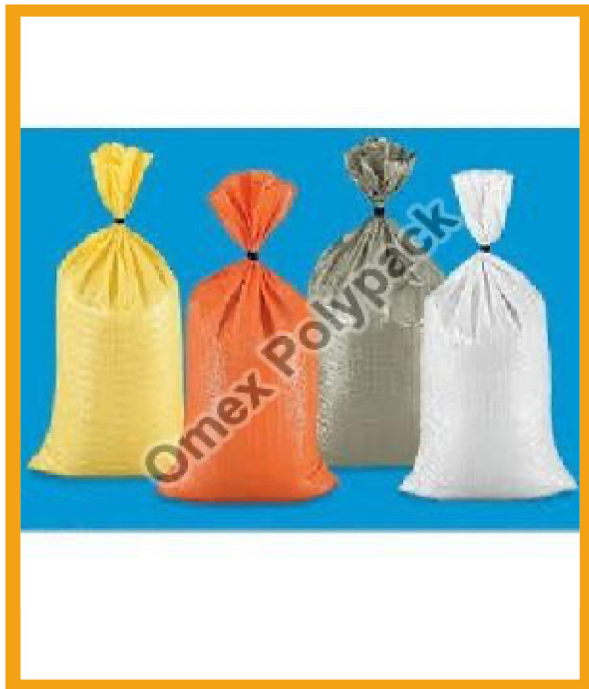
PP Woven Sand Bags