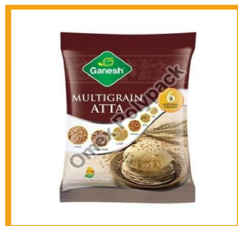
Food Packing BOPP Bags