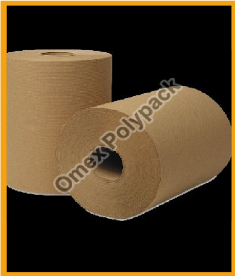
Brown Kraft Paper Rolls