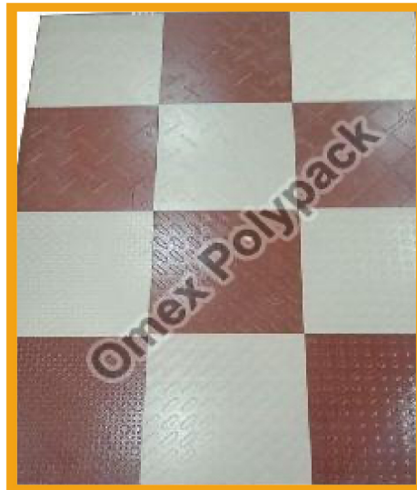
Ceramic Parking Tiles