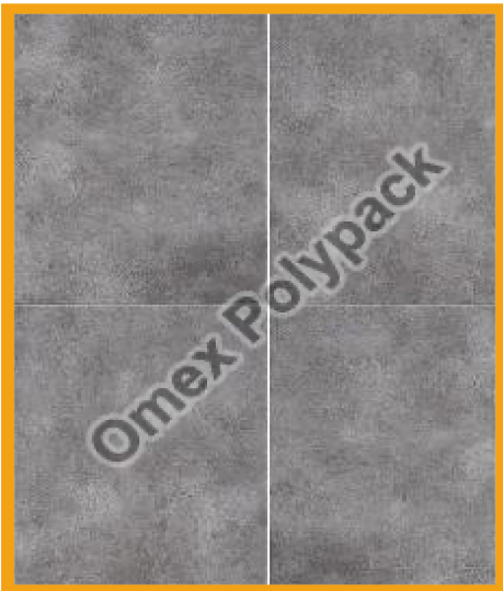
Ceramic Porcelain Tiles