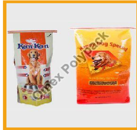
BOPP Woven Bags