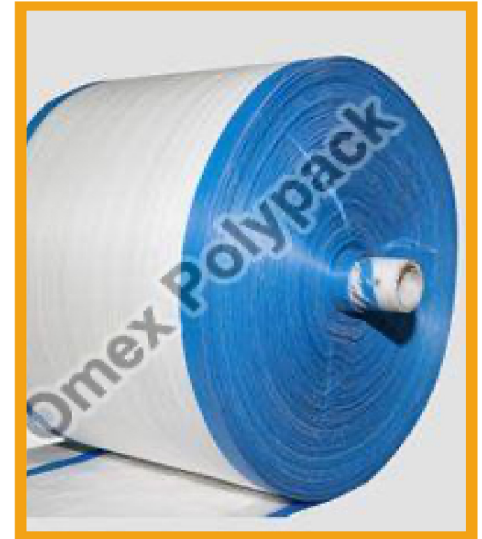
PP & HDPE Woven Fabric