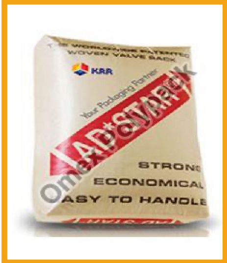
Block Bottom Valve Bags