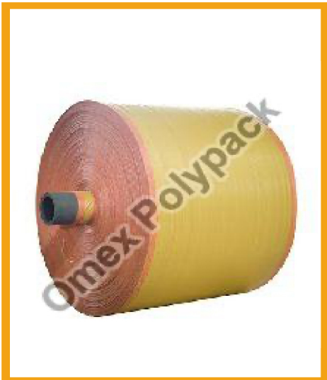
Yellow PP Woven Fabric Rolls