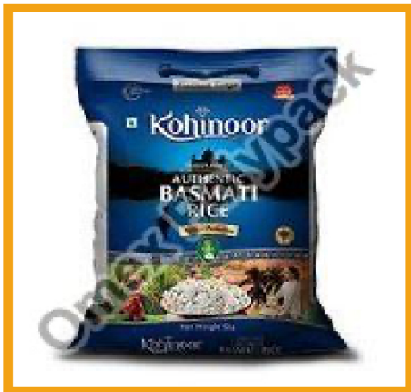
BOPP Rice Bags