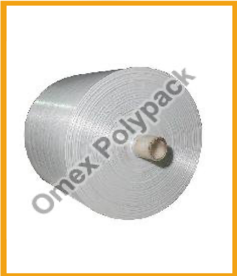
White PP Woven Fabric Rolls