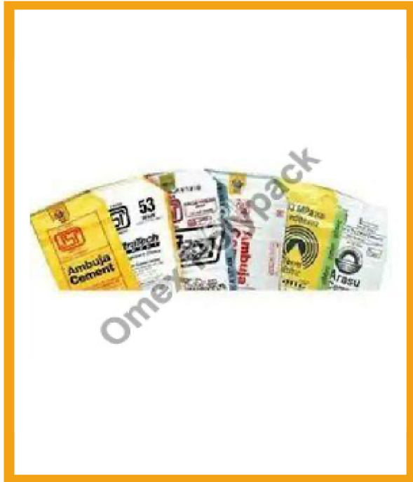
PP Woven Cement Bags