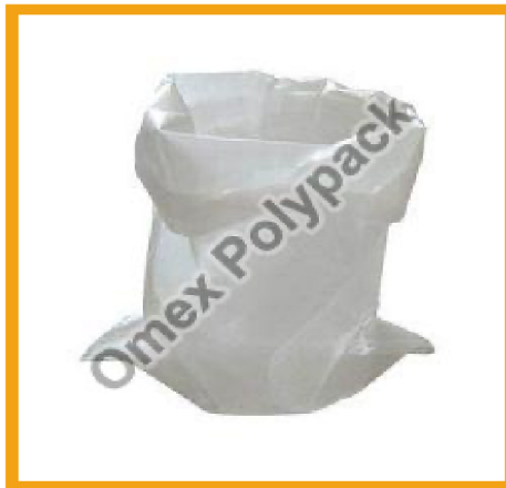
BOPP Natural Bags