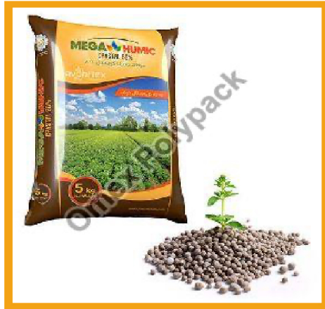
Seeds Packaging BOPP Bags