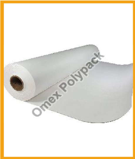
White Kraft Paper Rolls