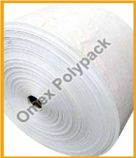
PP Sack Rolls