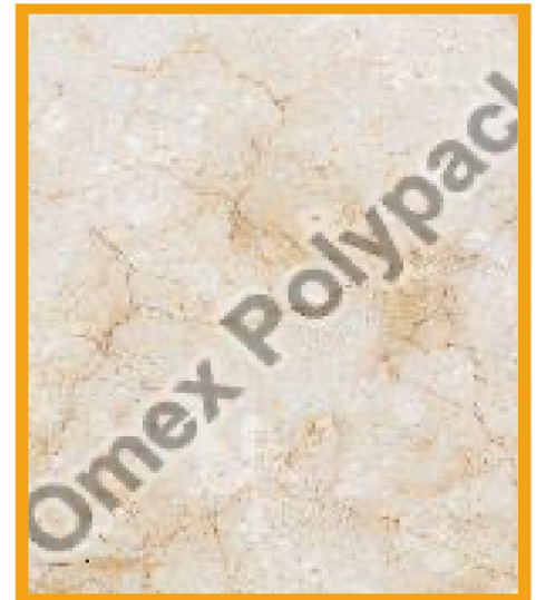
Ceramic Vitrified Tiles