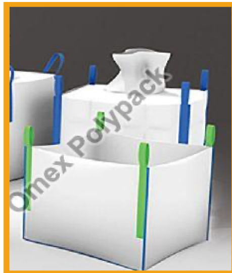
FIBC Big Bags