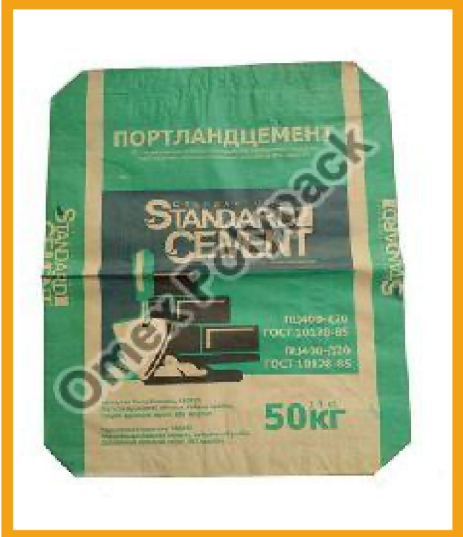
Cement Valve Bags