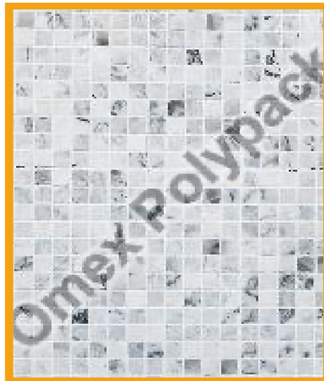
Ceramic Wall Tiles