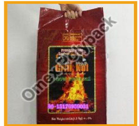
BOPP Handle Bags