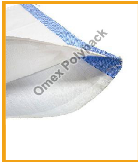
Plain PP & HDPE Woven Sacks Bags