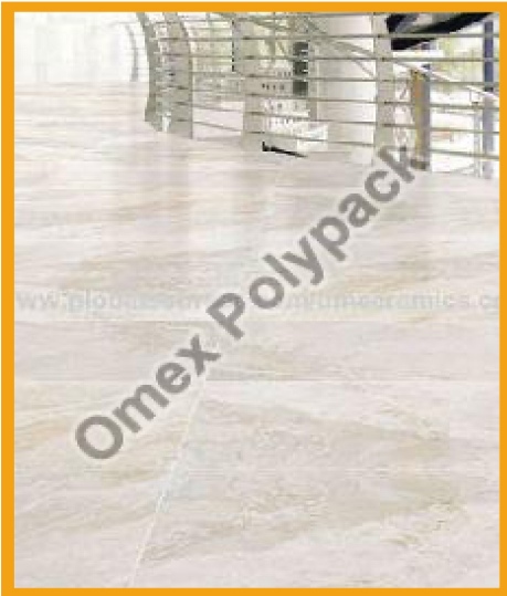
Ceramic Floor Tiles