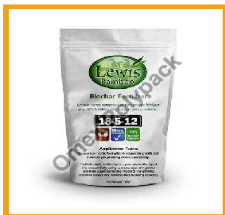
BOPP Fertilizer Bags