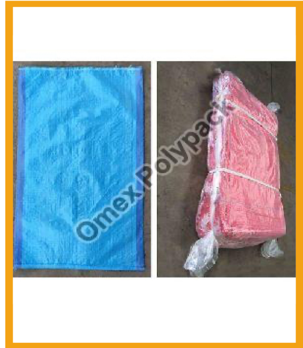
PP Woven Color Bags