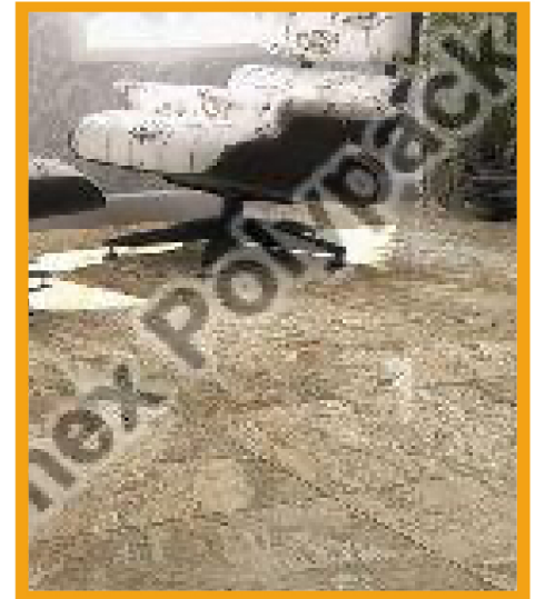
Ceramic GVT Tiles