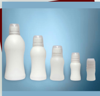
Pcb Curve Bottle

Available Size : 1ltr, 500ml, 250ml, 100ml, 50ml