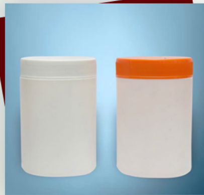
Jar Available Size : 100gm