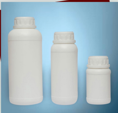
UE Bottle Available Size : 1ltr, 500ml, 250ml