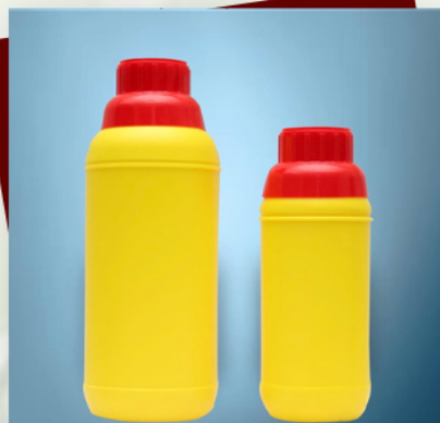
Cup Cap Bottle Available Size : 1 ltr, 500ml