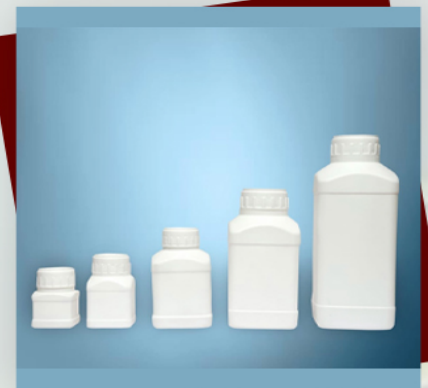
Square Regular Bottle

Available Size : 1ltr, 500ml, 250ml, 100ml, 50ml