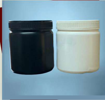
Protin Jar Available in the 1.67 Litres and above Size and are used for Powder