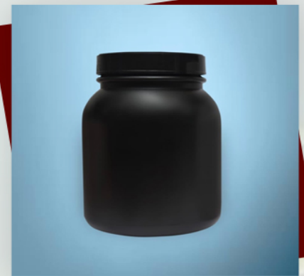
Protin Jar Available Size : 1 kg