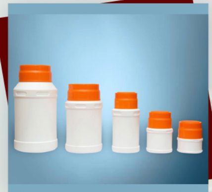
Alwin Shape Jar Available Size : 1kg, 500gm, 250gm, 100gm, 50gm