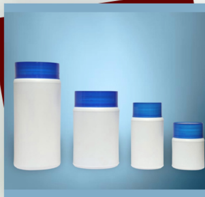
Humic Jar Available Size : 1kg, 500gm, 250gm, 100gm,