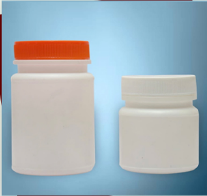
Ayurvedic Jar Available Size : 100gm, 50gm