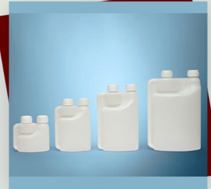
Double Neck Bottle

Available Size : 1ltr, 500ml, 250ml, 100ml, 50 ml, 25ml, 15ml