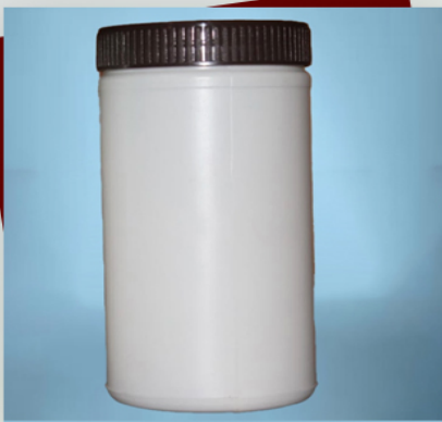
Flat Container Humic Jar available in the 100gm and above Size and are used for Powder