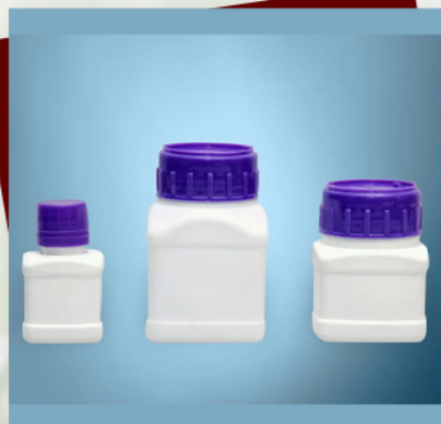
Square Regular Bottle

Available Size : 1ltr, 500ml, 250ml, 100ml, 50ml