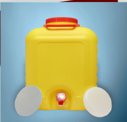
Available Size : 15ltr