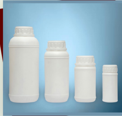
Regular Emida Bottle Available Size : 1ltr, 500ml, 250ml, 100ml,