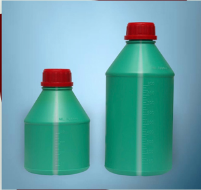
Round Up Bottle Available Size : 1ltr, 500ml,