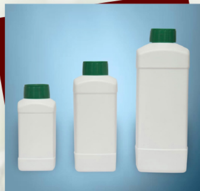
Amway Square Bottle

Available Size : 1ltr, 500ml, 250ml, 100ml, 60ml, 30ml