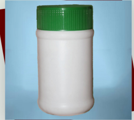
Pharmaceutical Container Pharmaceutical Container available in the 200gm and above Size and are used for Powder