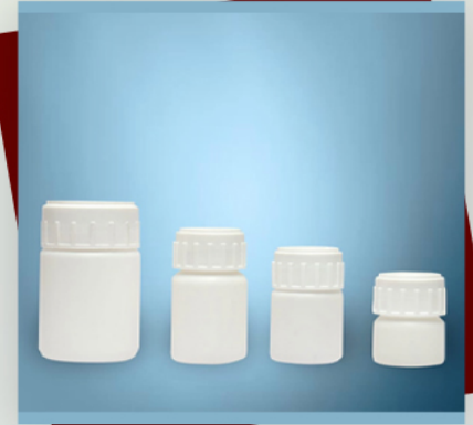
Regular Emida Bottle Available Size : 50ml, 30ml, 20ml, 10ml