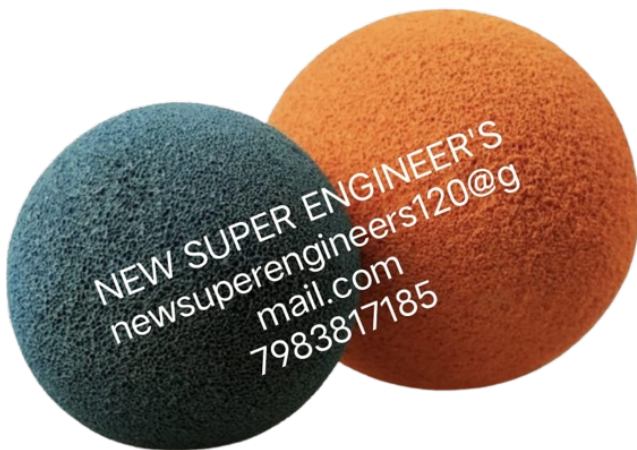
PIPE CLEANING BALL