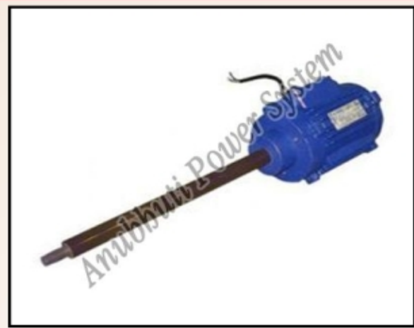
Cheese Winder Motor