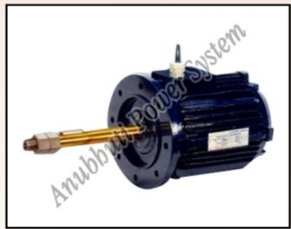
Cooling Tower Motor