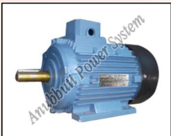
Special Purpose Motor