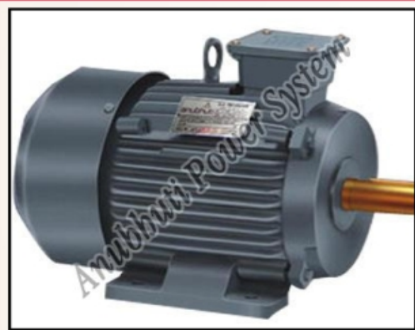
Crane Duty Motor