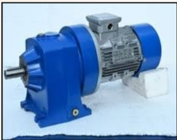
Mild Steel Three Phase Geared Brake Motor