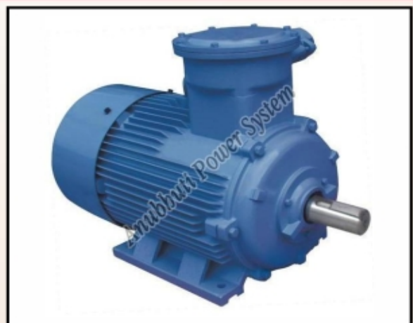
Three Phase AC Synchronous Motor