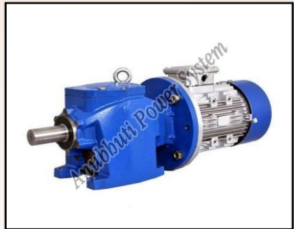
Helical Gear Motor