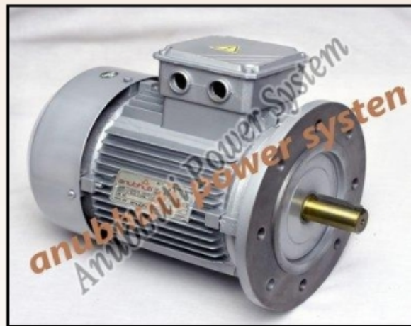
Three Phase Motor