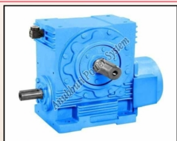
Mild Steel Flange Mounting Gearbox