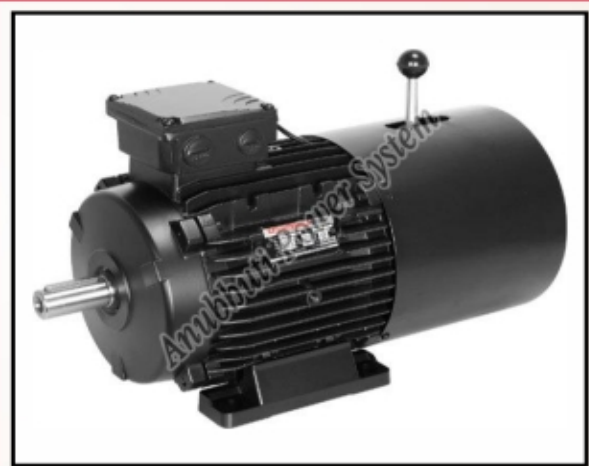
DC Break Motor