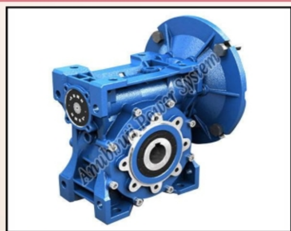
Worm Gear Reducer