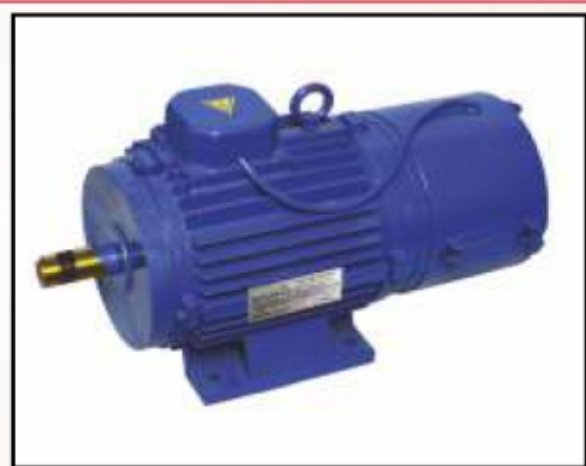
A.C Brack Motor