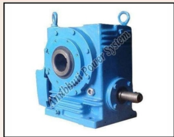
Mild Steel Worm Gearbox