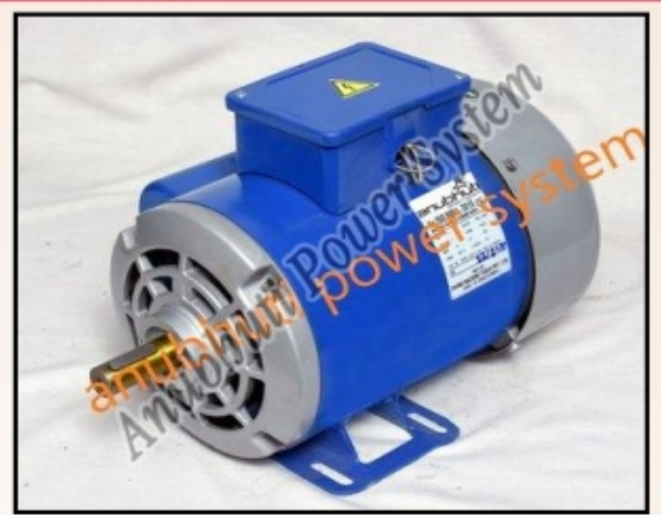
anu004 Single Phase AC Motor