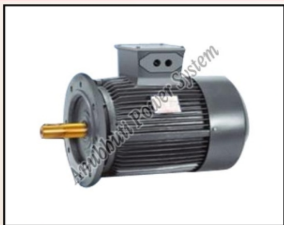
SS410 High Slip Motor