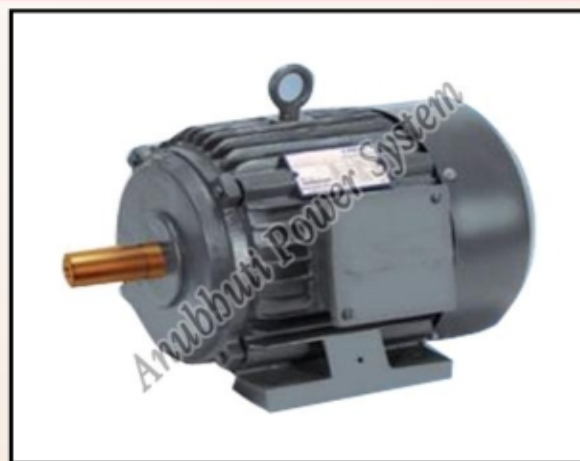
SS411 High Slip Motor