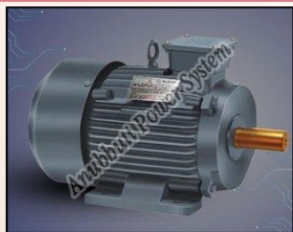
Dual Speed Motor