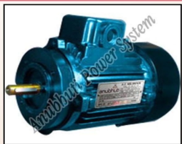
Face Mounted Motor