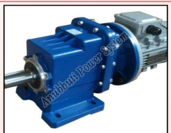
Mild Steel Inline Helical Gearbox