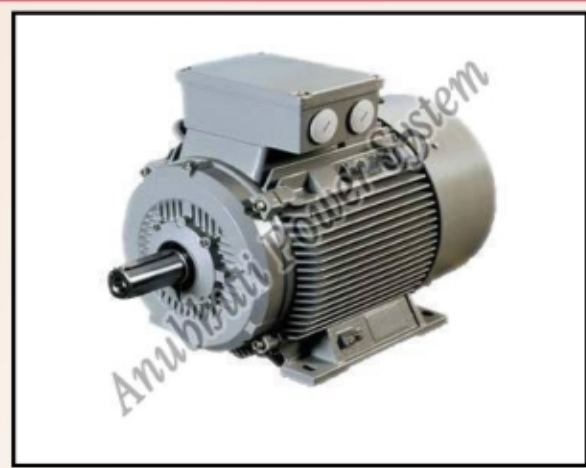
00013 Single Phase AC Motor