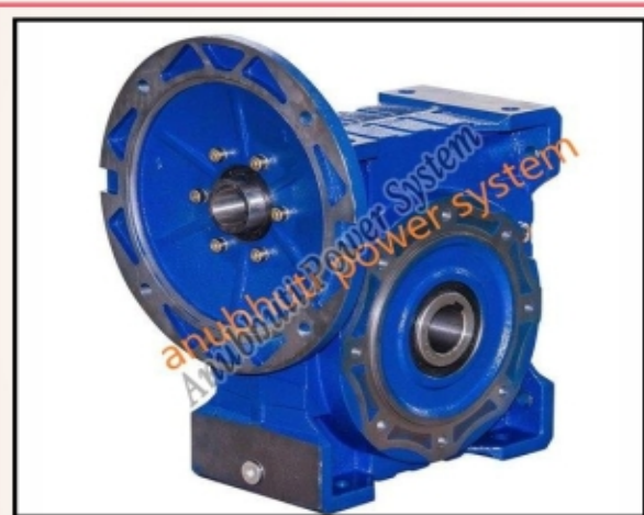
Aluminum Worm Gearbox