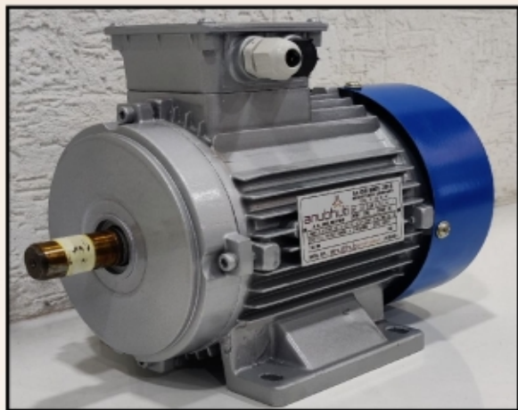
Three Phase Induction Motor