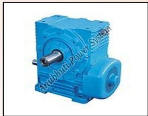
NU Type Gearbox