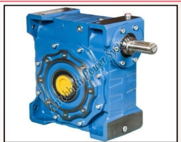
Mild Steel Conveyor Gearbox