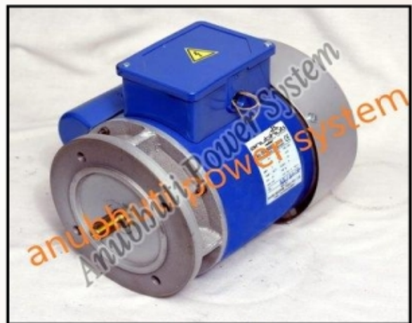
Single Phase AC Induction Motor