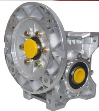
Mild Steel Worm Gearbox