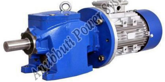
Helical Gear Motor