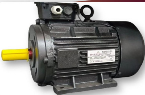
Cheese Winder Motor