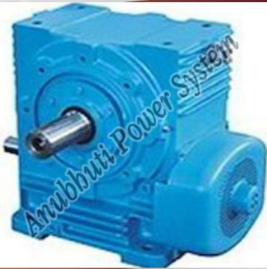
NU Type Gearbox