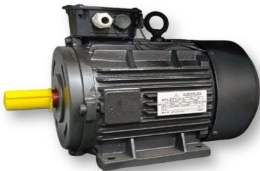
Special Purpose Motor