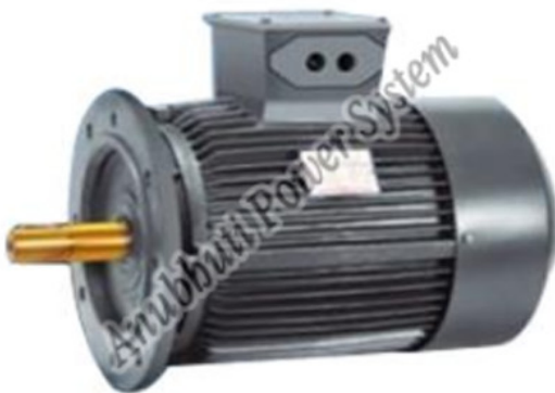
High Slip Motor