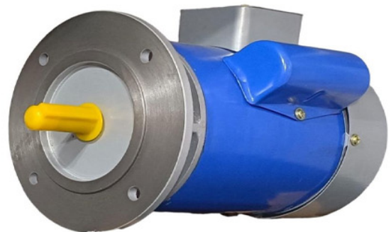
00013 Single Phase AC Motor