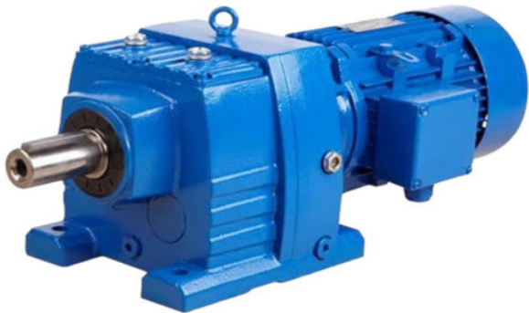
Mild Steel Inline Helical Gearbox