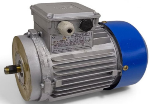
Face Mounted Motor