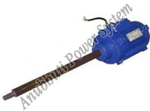
Cheese Winder Motor