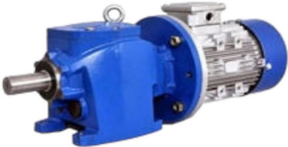
Mild Steel Three Phase Geared Brake Motor