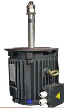
Cooling Tower Motor