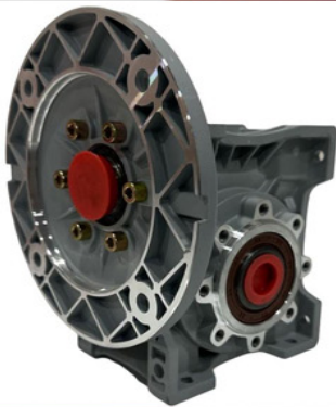
Worm Gear Reducer