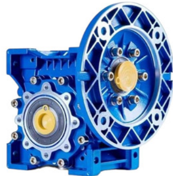
Aluminum Worm Gearbox