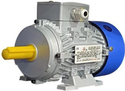
Three Phase Induction Motor