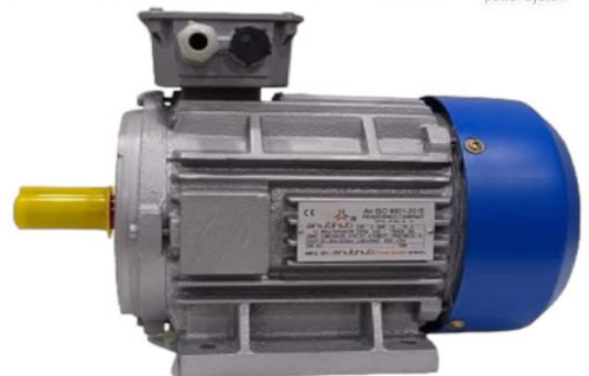
Three Phase AC Synchronous Motor