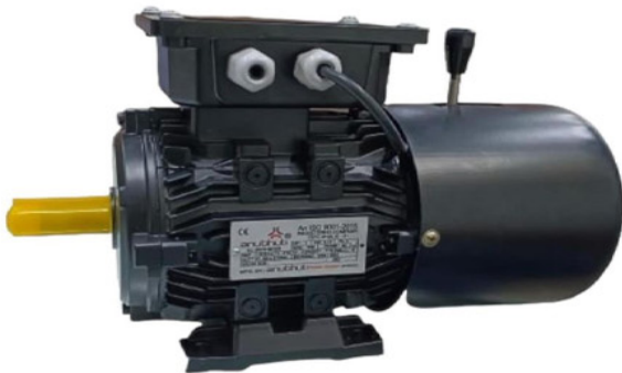
Crane Duty Motor