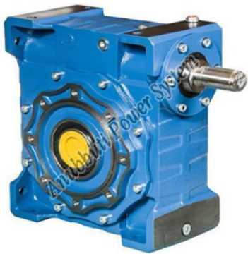
Mild Steel Conveyor Gearbox