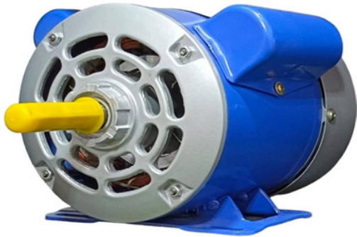
anu004 Single Phase AC Motor