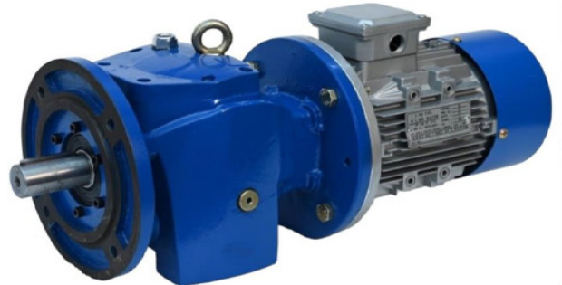
Mild Steel Flange Mounting Gearbox