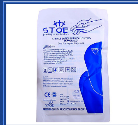
Medical Latex Surgical Gloves