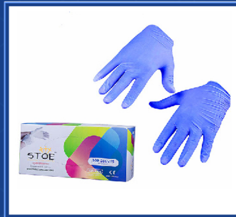
Nitrile Examination Gloves