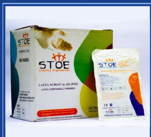
Sterile Latex Surgical Gloves