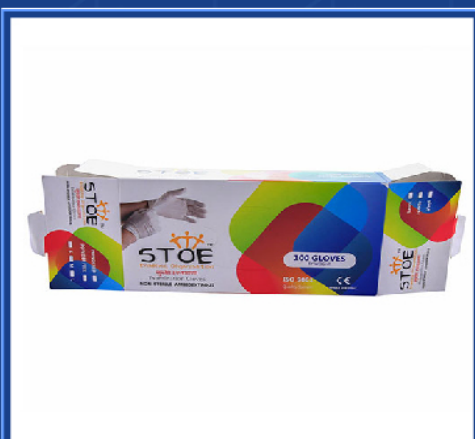
Powdered Latex Examination Gloves