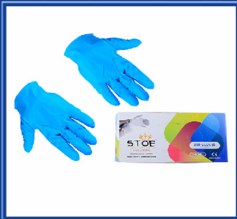
Medical Nitrile Examination Gloves