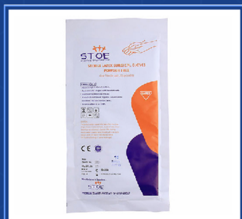
Powder Free Latex Surgical Gloves