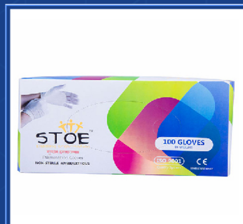
Rubber Latex Examination Gloves