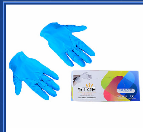
Powder Free Nitrile Examination Gloves