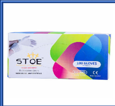
Powder Free Latex Examination Gloves