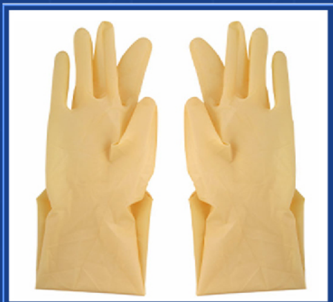
Hospital Latex Surgical Gloves