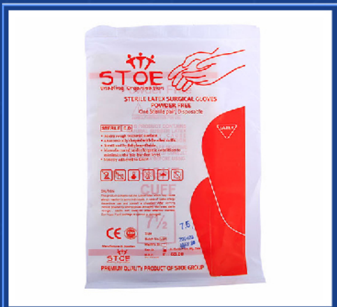
Disposable Latex Surgical Gloves