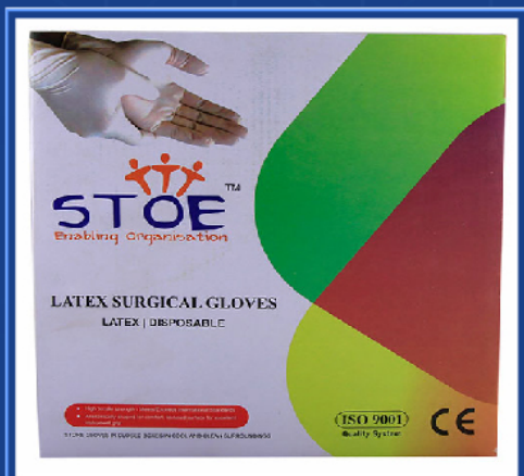
Non Sterile Latex Surgical Gloves