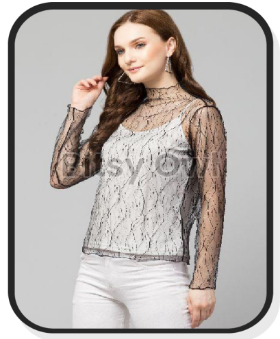
Ladies Purple Top