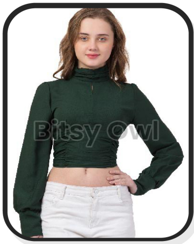
Ladies Red Top