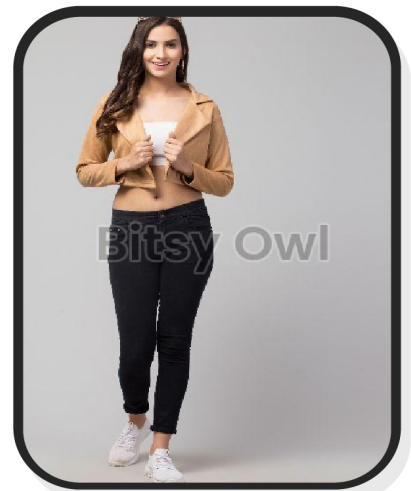
Women Solid Double-Breasted Casual Suede Blazer