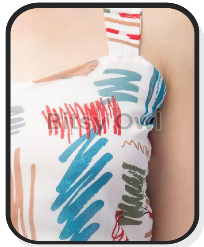
Womens Printed Co-ord set