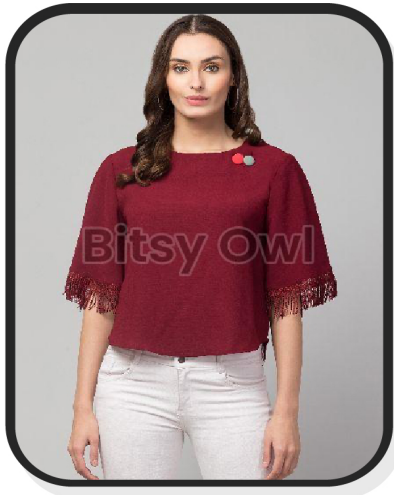
Ladies Black Fringe Top