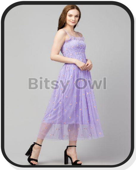
Ladies Purple One Piece Dress