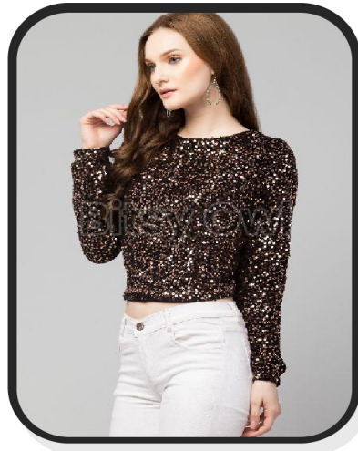
Ladies Brown Sequin Top