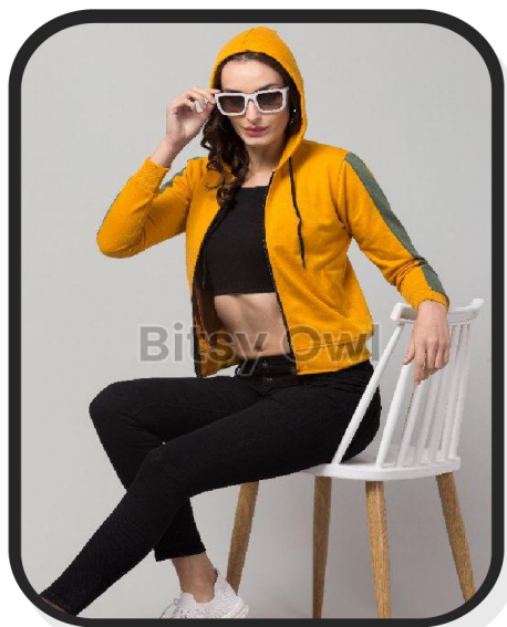
Ladies Black & Yellow Tracksuit

To stay warm in the cold, try wearing a jacket with a fleece inside. Look for tracksuit jackets with pockets for securing your items while you're out and about or exercising, and choose bottoms with high waistlines for broader coverage and a more comfortable fit. We have drawcords at the waist of our bottoms so you may comfortably adjust them.