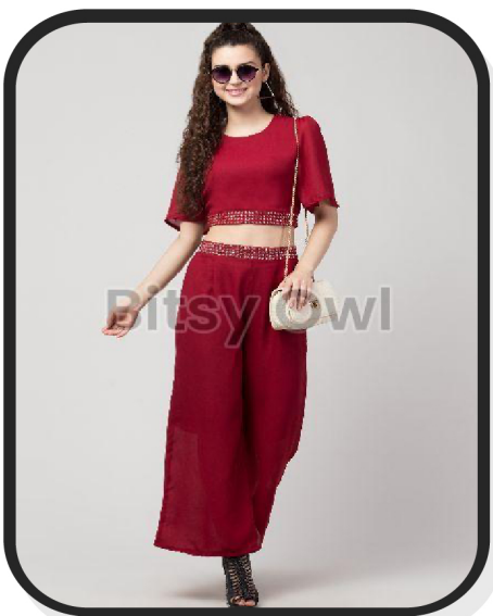
Stylish Solid Top and Palazzo Co-ords Set for women

Being a well-known ethnic company, Bitsy Owl is aware of the value of Indian traditional clothing, which is why it has created salwar suits with a modern twist by substituting cotton palazzo pants for the salwar for ladies and girls.