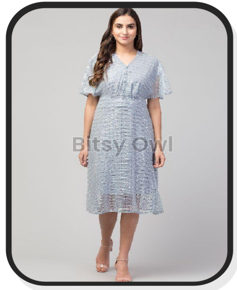
Women Girls Three-Quarter Cape Sleeves Moonlight Flared Calf Length Long Dress

Want to change up your look for the season? It's time to purchase a Ladies One Piece Dress. The trendiest single-piece gowns for women this season are quite detailed. With good reason, the print-single piece is regarded as one of the greatest colours for those with fair or wheat-coloured complexion. There are numerous ways to wear one-piece dresses and express your style. Popular single-piece long dresses typically have an unclear waistline and hang loosely. The dress is ideal for ladies with heavy body types yet may be easily pulled on by women. It can make your profile appear sleek and lanky.