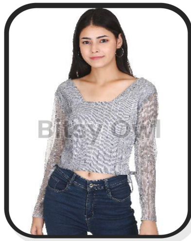
Women Drawstring Solid Shimmer Top