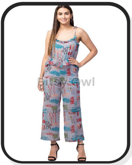
Women Girls Tie-up Shoulder Straps Printed Georgette Flared Jumpsuit

Want to change up your look for the season? It's time to purchase a Ladies One Piece Dress. The trendiest single-piece gowns for women this season are quite detailed. With good reason, the print-single piece is regarded as one of the greatest colours for those with fair or wheat-coloured complexion. There are numerous ways to wear one-piece dresses and express your style. Popular single-piece long dresses typically have an unclear waistline and hang loosely. The dress is ideal for ladies with heavy body types yet may be easily pulled on by women. It can make your profile appear sleek and lanky.