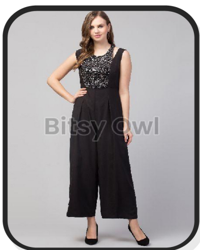
Women Girls Sequined Style Sleeveless Solid Jumpsuit