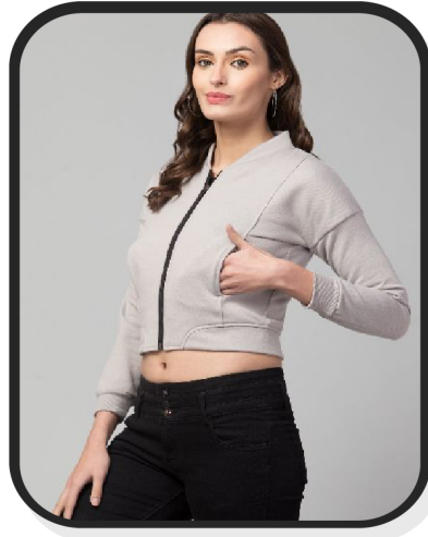
Women Regular fit Solid Bomber jacket