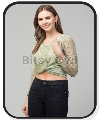
Women Girls Knot Style Tinsel Bling women top