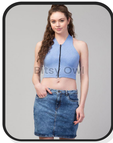
Womens Girls Zipper Solid Crop Top