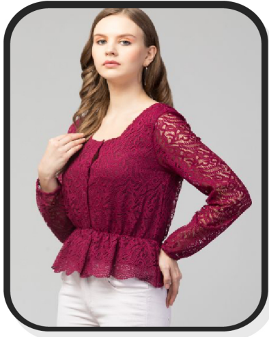
Bishop Sleeve Peplum Lace Top