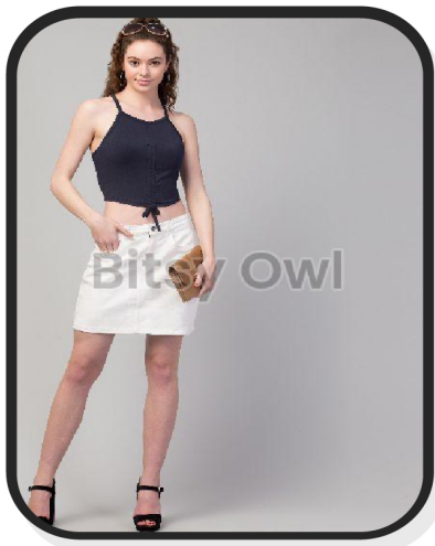
Womens Girls Strings Solid Crop Top