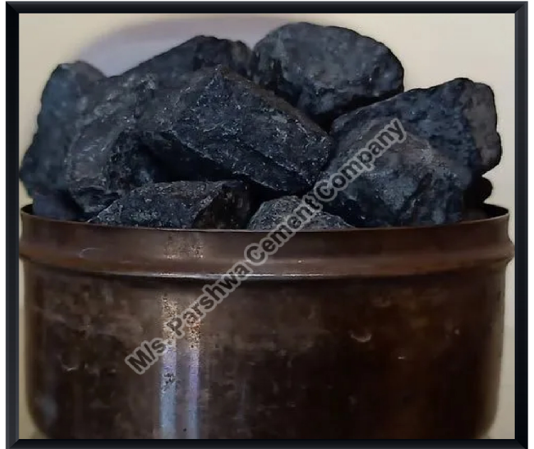
20 MM Crusher Aggregate