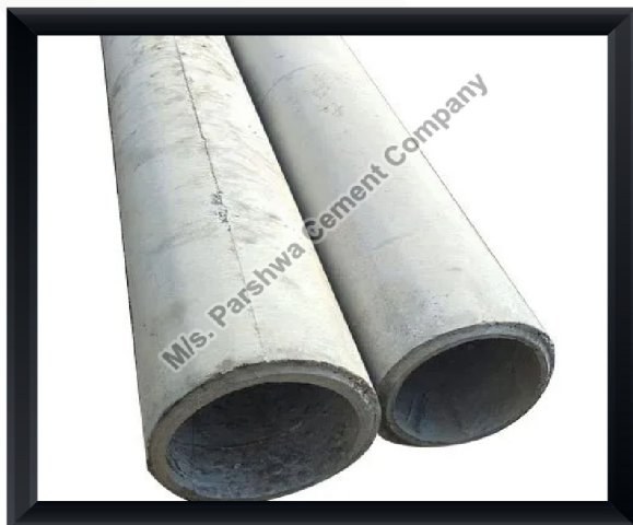
300 MM RCC Hume Pipe