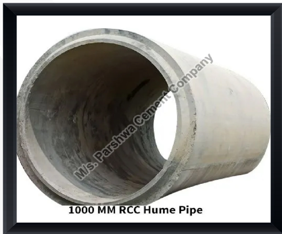
1000 MM RCC Hume Pipe