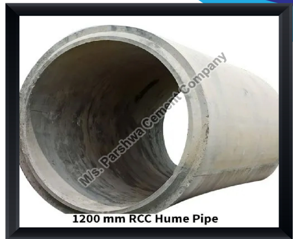
1200 mm RCC Hume Pipe