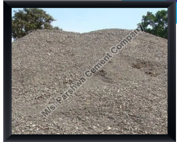
Granular Sub Base Material