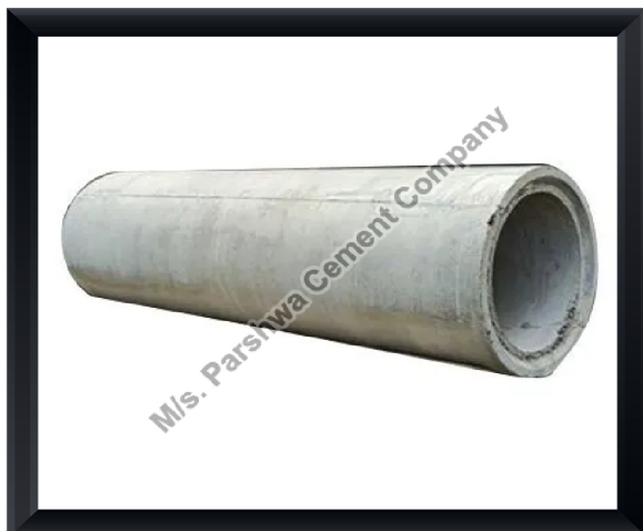
600mm RCC Hume Pipe