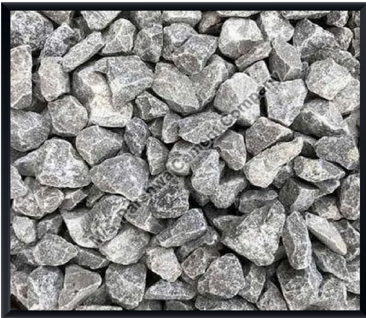
40 MM Crusher Aggregate