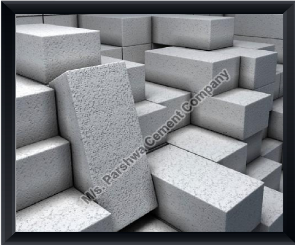
Fly Ash Bricks