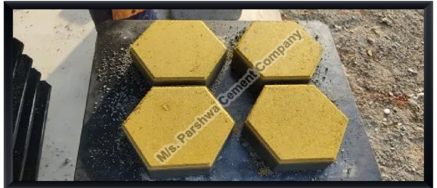
Hexagonal Paver Block