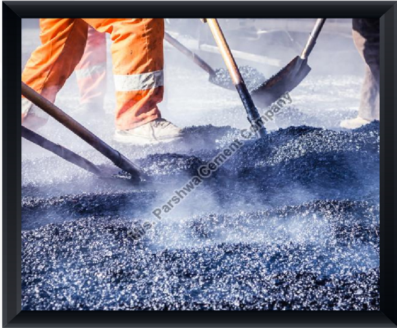
Ready Hot Mix Bitumen