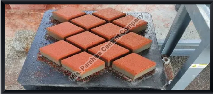
Diamond Paver Block