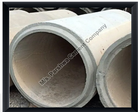
900 MM RCC Hume Pipe