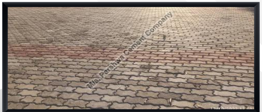
Zig Zag Paver Block