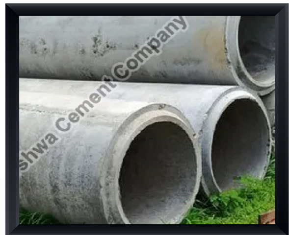
500 MM RCC Hume Pipe