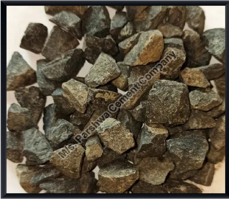
10 MM Crusher Aggregate