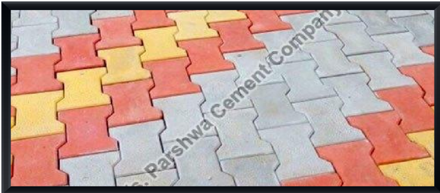
I Shape Paver Block