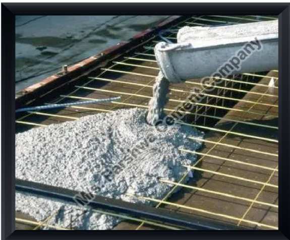
Ready Mix Concrete