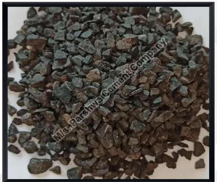
6mm Crusher Aggregate