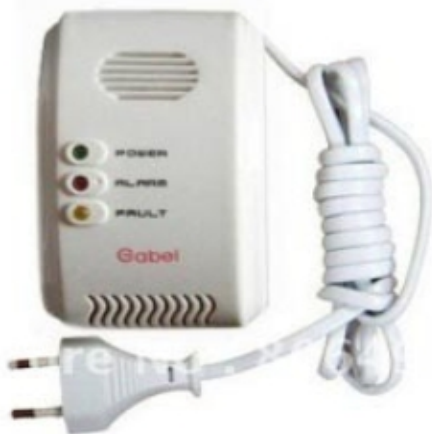
Wall Hanged Gas Leakage Detector