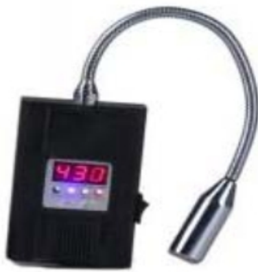
Handheld(portable) Gas Leakage Detector

Gas Leakage Detector that we offer can detect CNG, LPG, CO 2 , CFC, NO x , S 2 S, SO 2 , O 2 , CH 4 , H 2 , NH 3 etc. We are one of the trusted Manufacturers, Exporters and Suppliers of gas Sensors. We have highly experienced professionals who manufacture Gas Detectors keeping in mind the requirements of different industries. Buyers prefer to buy Gas Leakage Detector from us as we make it available at the best market price.