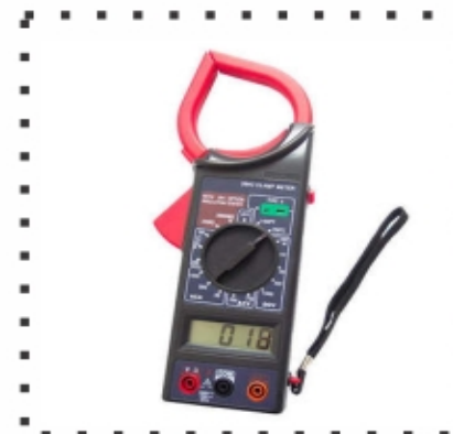
Digital Clamp Meter