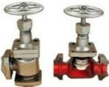
Globe Flanged Type or Angle Valves