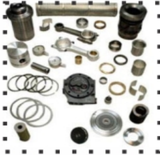
Air compressor Spare Parts

We introduce ourselves as the leading manufacturer and supplier of precision-designed Compressor Spare Parts. To their quality attributes, these fittings are widely accepted by our clients. Apart from this, these products delivered from our end only after checking thoroughly against various quality parameters. In order to meet variegated demands of clients, we provide these fittings in customized options as per their requirements. Housed with all the latest facilities and leveraging on our technical knowledge, we are geared up to produce quality precision parts and components for compressors includes refrigeration spares, air compressor spares.