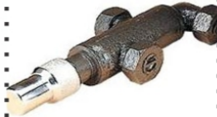
Dual Safety Valves