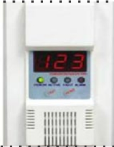
Wall Hanged Gas Detector