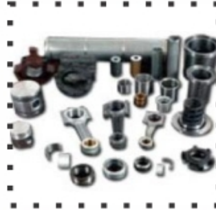
Ammonia Compressor Spare Parts