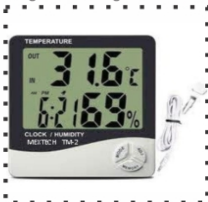
Digital Thermo Hygrometer

We are functioning as Manufacturer, Exporter and Supplier of Digital Thermometers. We strictly adhere to generally approved norms and standards; thus bringing forth precision-engineered Thermometers. Our Digital Thermometers are acclaimed for compact design, large display for instant indication and excellent battery back up. We deal in different types of Digital Thermometers that are available in different temperature measuring range. All our Digital Thermometers are obtainable at market-leading prices.