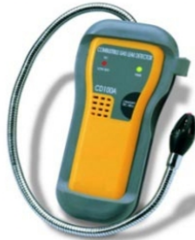
Handheld(portable) Gas Leakage Detector