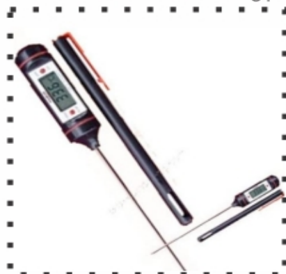
Digital Pen Thermometer