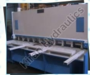
Plate Rolling Machine

Business Type : Manufacturer, Exporter, Supplier, Retailer, Trader Driven Type : Hydraulic Range : 3 mm to 25 mm Length : 1250 mm to 7000 mm