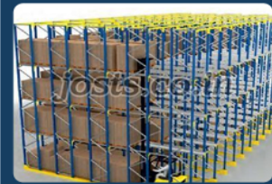
Drive In Jorack Racking System