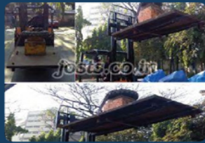
Electric Forklift With Extended Forks