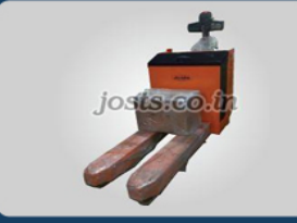
BOPT With Platform High Lower Fork