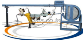
Pneumatic Sample Transport System