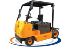
Tuskar AC Drive Tow Truck