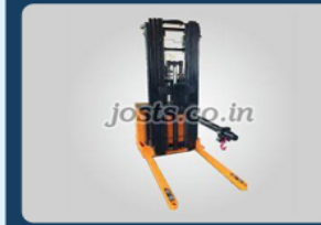
Electric Stacker With Boom and Hook