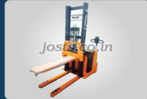
Electric Stacker With Single Fork