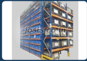
Customise Racking System