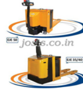
EJE 35-40-50 Electric Pedestrian Pallet Truck