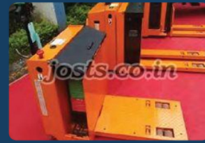
BOPT With Chequered Platform