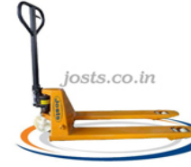
JPR 2500 Nylon Wheels Hand Pallet Truck