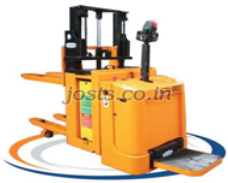
EJD & ERD Electric Double Pallet Stacker