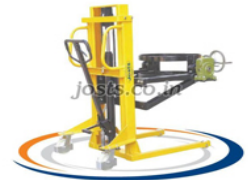
JYTD 35 Drum Lifter