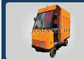
4-Wheel Platform Truck With Operator and Canopy Cabin