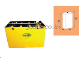
158mm Battery Tubular Traction Cells