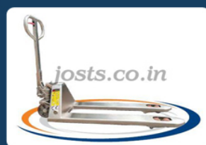
JPSS 2500 Stainless Steel Hand Pallet Trolley