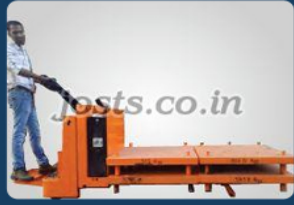
BOPT With Extended Forks