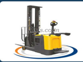
JCPD 15R Electric Stand On Counter Balance Stacker