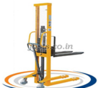
MHS 1030 Manual Hand Stacker With Fixed Fork