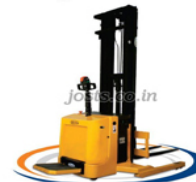
ERB 15-17 Electric Stand On Straddle Stacker