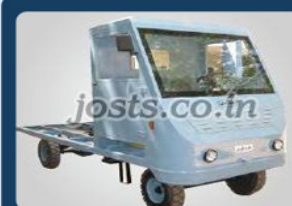
4-Wheel Platform Truck With Customised Cabin