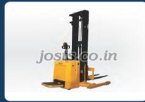
Customised ERB Straddle Ride On ST Stacker