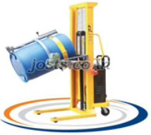
YL520 Semi Electric Drum Lifter