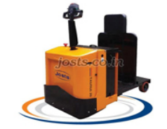
Taurus AC Drive Stand On Tow Truck