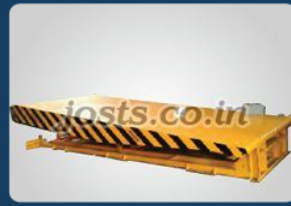
Extended Platform Dock Leveler