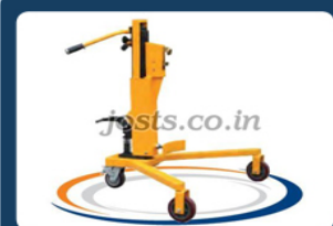
Hydraulic Drum Handler