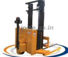
EJB 15-17 Revision 3 Electric Pedestrian Straddle Stacker