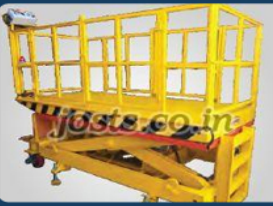
Customise Scissor Lift