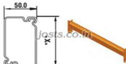
Heavy Duty Beam