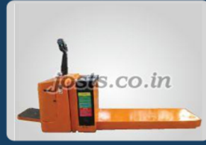
BOPT With Platform