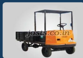
4-Wheel Platform Truck With Side Flap & Operator Canopy