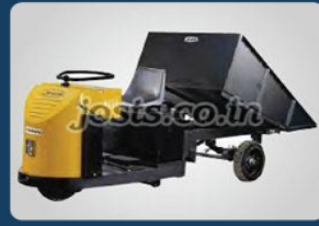
3-Wheel Dumper Truck