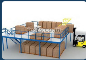
Mezzanine Floor Jorack Racking System