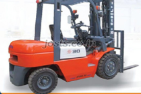
JFDH Heli Diesel Forklift Truck