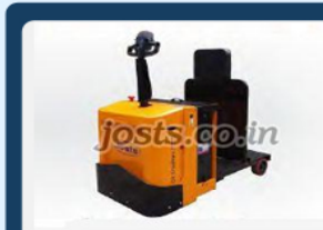
5 Point Contact Stand On Tow Truck