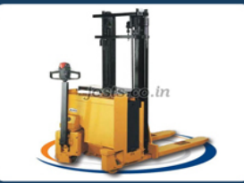
Flier EJC Rev 7 Electric Pedestrian Stacker