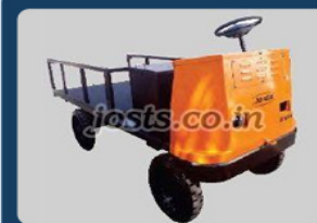
4-Wheel Platform Truck With Removable Side Railing & Rubberised