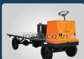
4-Wheel Platform Truck With Extended