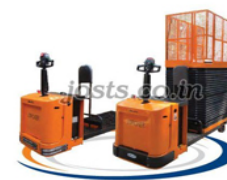
Electric Stand On Order Picker