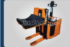
Electric Stacker With Tyre Handling