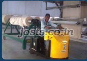
3-Wheel Batching Tow Truck