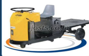
Jumboelectric Three Wheel Platform Truck