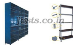
Light Duty Jorack Racking System