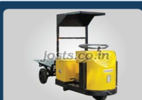
3-Wheel Platform Truck With Operator Canopy