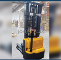
Battery Operated Stacker