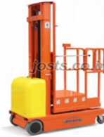
Battery Operated Stock Order Picker