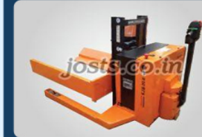
Electric Stacker Without Tyre Handling