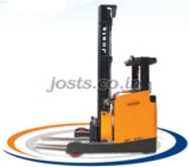
Electric Reach Truck