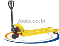
JPR 2500 Polyurethane Wheels Hand Pallet Truck