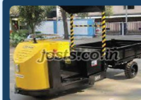
3-Wheel Platform Truck With Side Flaps and Operator Canopy