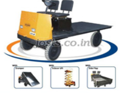
Jotruk Four Wheel Platform Truck