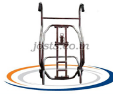
JYED MS Galvanized Coated Drum Carrier