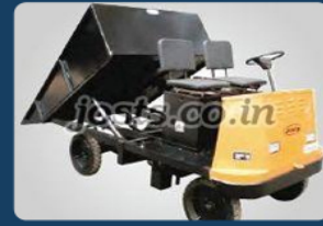
4-Wheel Dumper Truck