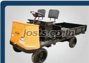
4-Wheel Platform Truck With Side Flap