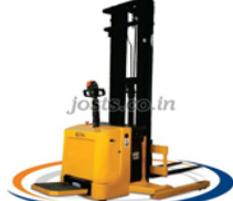
ERB 15-17 Revised 5 Electric Stand On Straddle Stacker