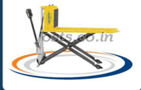
JPEX 10 Electric Scissor Pallet Truck