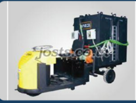
3-Wheel Coolant Truck