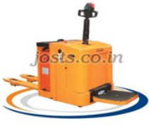
ERE 35-40 Electric Stand On Pallet Truck