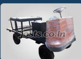
4-Wheel Platform Truck With Extra Seat