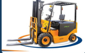
JFD30 Josts Diesel Forklift Truck