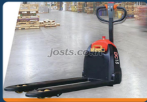
Lithium Battery Powered Pallet Truck