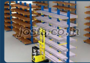
Cantilever Jorack Racking System