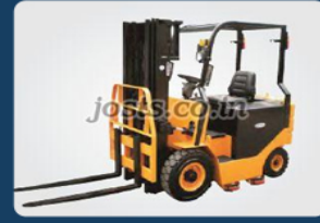
Electric Drive In Forklift