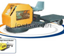
Jumbodisel Three Wheel Diesel Platform Truck