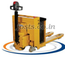
EJE 20 25 30 35 Electric Pedestrian Pallet Truck