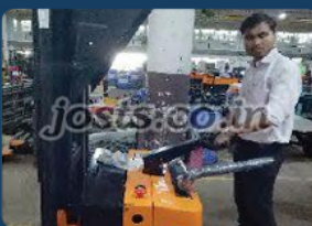
Special Electric Stacker