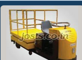
3-Wheel Platform Truck With Scissor Lift