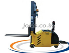
JLTECBS 10 15 20 Electric Stand On Counter Balance Stacker