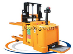
EJD & ERD Revision 3 Electric Double Pallet Stacker