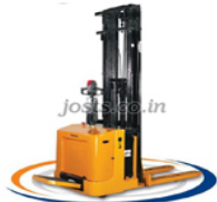
ERC 15-17V-17 S Electric Pedestrian Operated Stacker