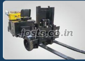
3-Wheel Rear Fork Tow Truck