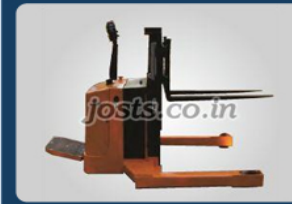
Electric Stacker With 2 Ton