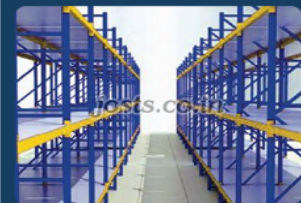
Medium Duty Jorack Racking System