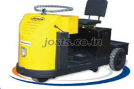
Jumboelectric AC & DC Drive Three Wheel Tow Truck