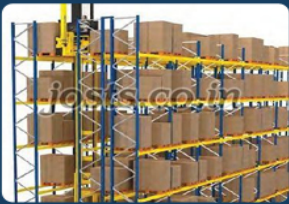
Heavy Duty Jorack Racking System