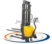
HS 1030 Semi Automatic Hand Stacker With Adjustable Fork