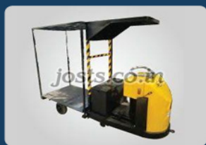
3-Wheel Platform Truck With Canopy & Tarpaulin