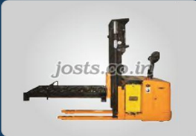
Electric Stacker With Dia Loading