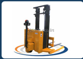
EJB 15-17 Electric Pedestrian Straddle Stacker