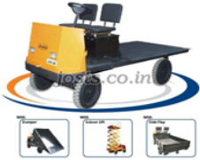
Hydraulic Dock Leveler