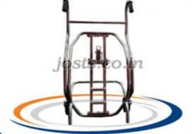
JYED Series SS Drum Carrier