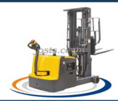
JCPD 15 W Electric Pedestrian Counter Balance Stacker