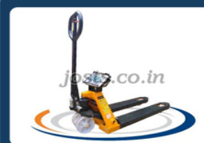
JPW Hand Pallet Trolley With Weighing Scale