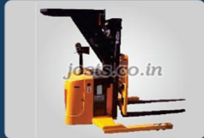
Electric Stacker With Overhead Guard