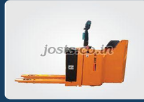
BOPT With Side Support