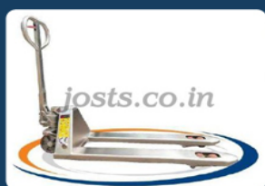
JPSS 2000 Stainless Steel Hand Pallet Trolley