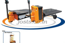
Jowalk Three Wheel Pedestrian Platform Truck