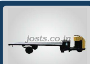
3-Wheel Platform Truck With Extended Plaorm