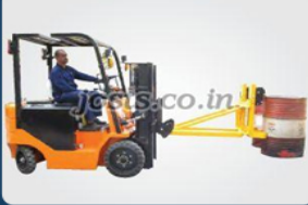
Electric Forklift With Drum Handling