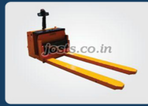
BOPT Mass Type Extended Forks