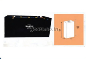
198mm Battery Tubular Traction Cells