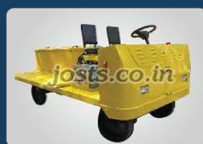
4-Wheel Platform Truck With Defence