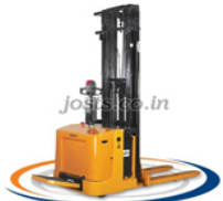
ERC 151717V17S Revise 7 Electric Pedestrian Operated