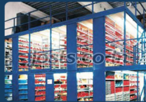
Multi-Tier Jorack Racking System