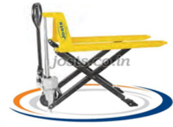
JPX 10 Hand Operated Scissor Pallet Truck