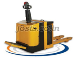
ERE 20 25 30 35 Electric Stand On Pallet Truck