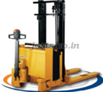
EJC 15-17 Electric Pedestrian Stacker