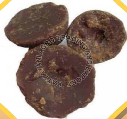
Fresh Palm Jaggery