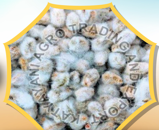
Raw Cotton Seeds