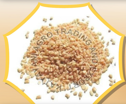
Broken Wheat Seeds