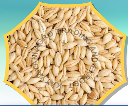
Barley Wheat Seeds