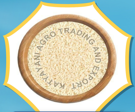
NON BASMATI RICE