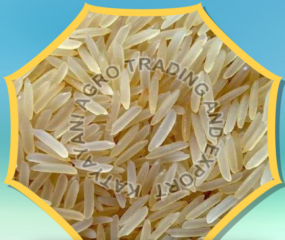
SUGANDHA GOLDEN RICE