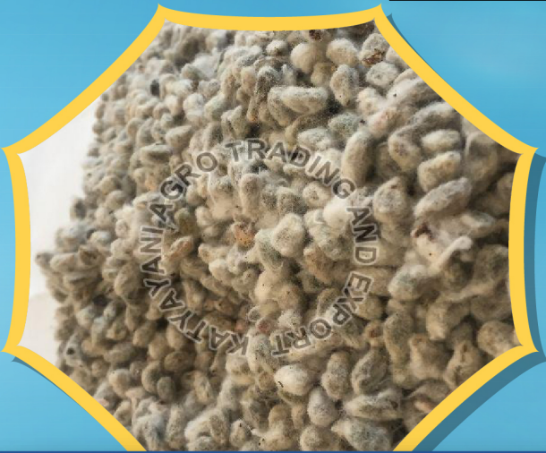
Fresh Cotton Seeds