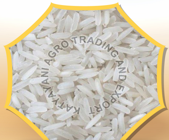
WHITE RAW RICE