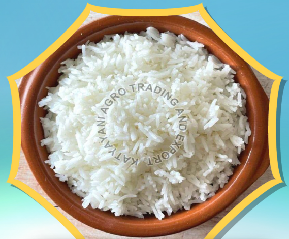
WHITE PARBOILED RICE