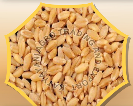
Dried Wheat Seeds