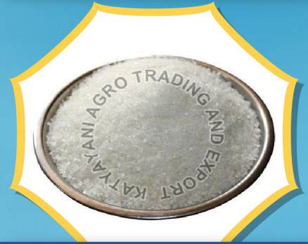
White Cane Sugar