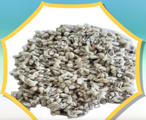
Pure Cotton Seeds