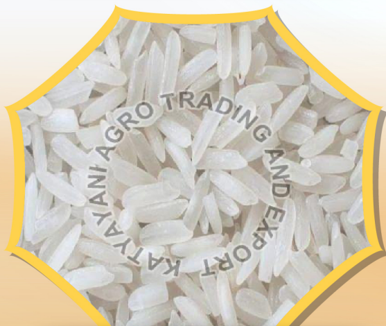
WHITE PONNI RICE