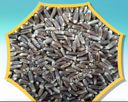
Black Wheat Seeds