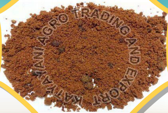
Fresh Jaggery Powder