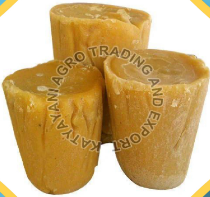
Fresh Jaggery Blocks