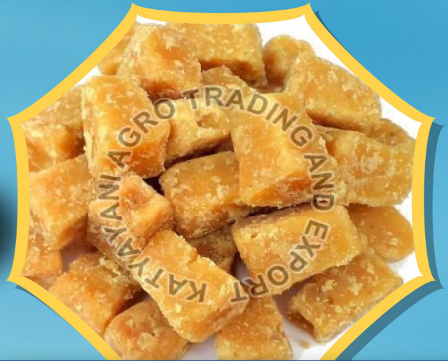
Fresh Jaggery Cube