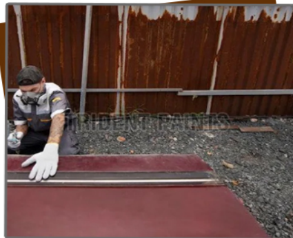
Basement Waterproof Coating