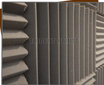
Acoustic Soundproof Grout