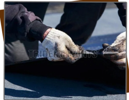
Bituminous Waterproof Coating