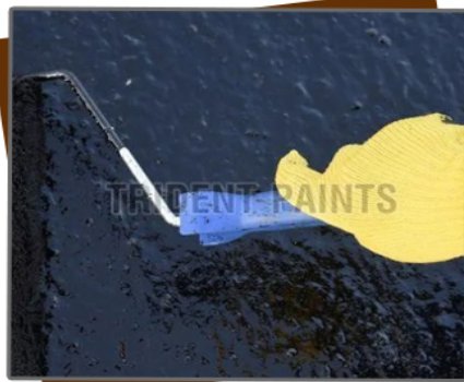
Cementitious Waterproof Coating