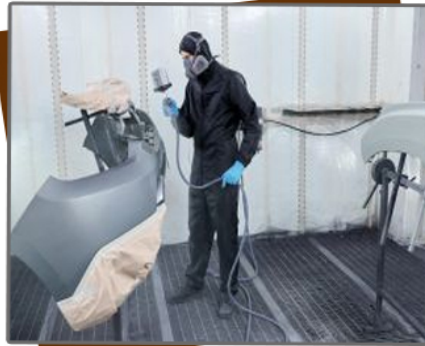
Marine Coat Paint