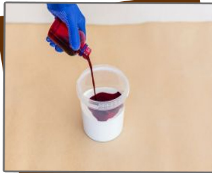
Food Grade Solvent Free Epoxy Coatings