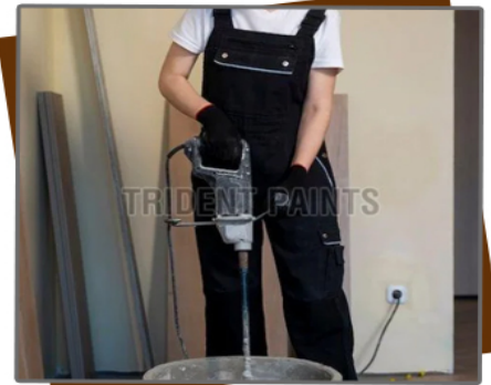
Concrete Densifier Hardener