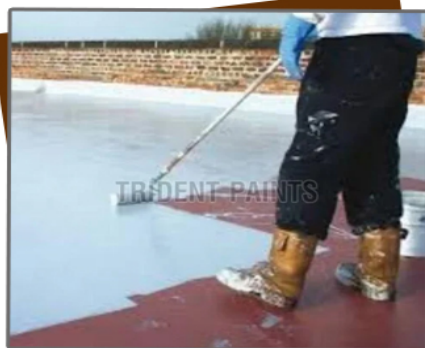
Acrylic PU Finish Paint