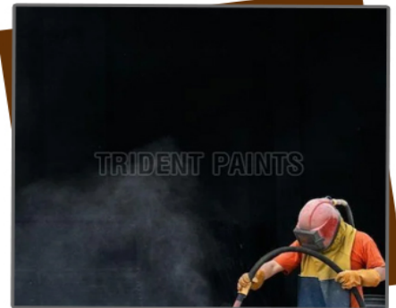
Heat Resistant Black Paint