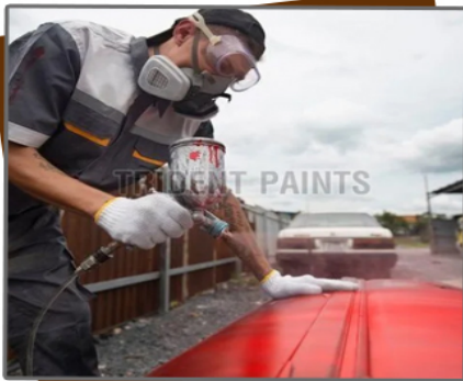
Anti Carbonation Bridge Paint