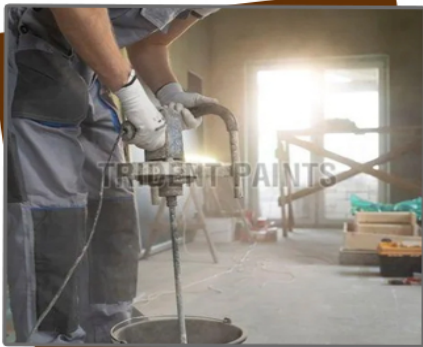
Concrete Sealer Coating