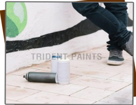
Anti Graffiti Surface Coating