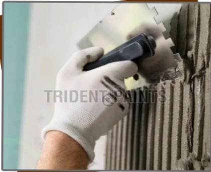
Cement Based Grouts