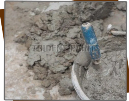
Concrete Curing Compound