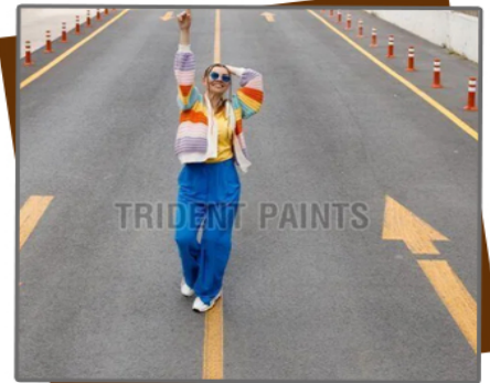
Airport Runway Marking Paint