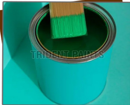
Heat Resistant Aluminium Paint