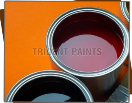
Fire Retardant Paints