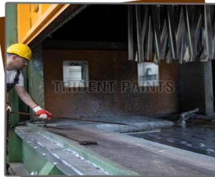
Anti Carbonation Coating for Concrete