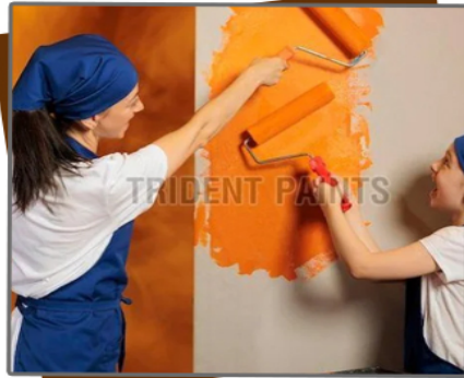
Interior Decorative Wall Paint