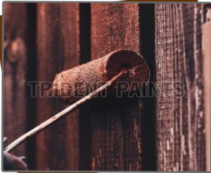
Exterior Decorative Paint