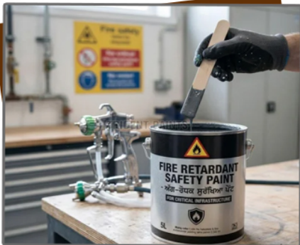
Fire Retardant Safety Paint