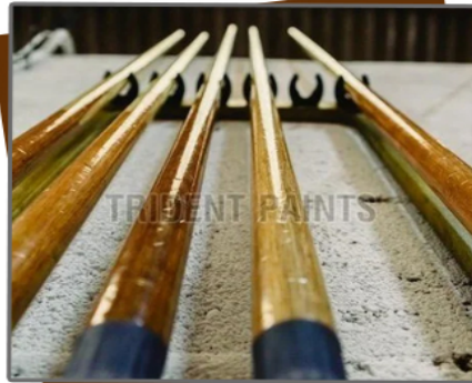
Epoxy TMT Bar Coating