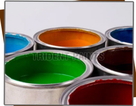
Plastic Emulsion Paint