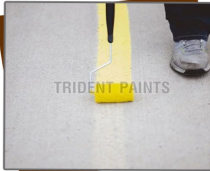
Polyurethane Track Paint