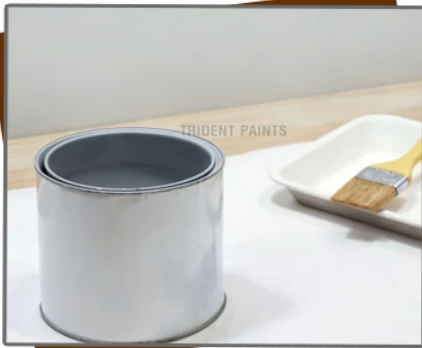
2K Acrylic PU Grey Primer