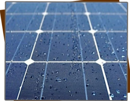
Solar reflective industrial coating