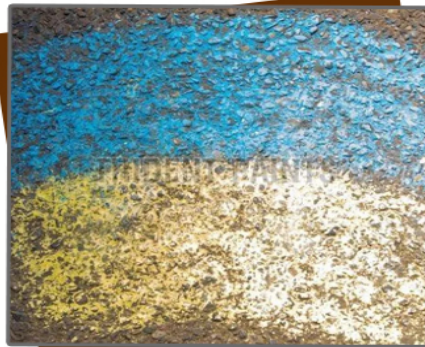
Acrylic Road Surface Paint