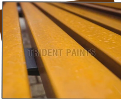
Heat Resistant Aluminium Track Paints