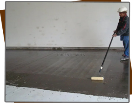
2K Epoxy Grey Primer