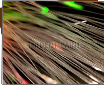
Fire Retardant Cable Coating