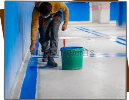
Epoxy Track Paint