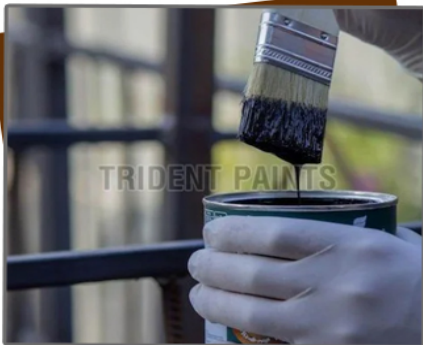
Aluminium Protective Paint