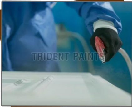
Fouling Release Coating