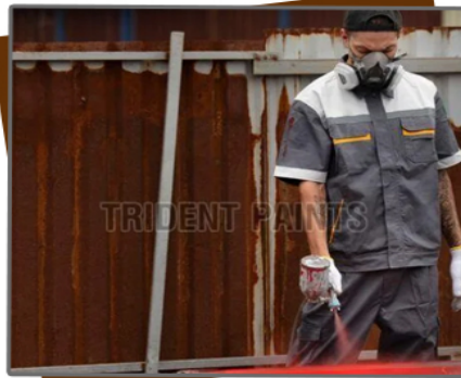
Cargo Hold Coating