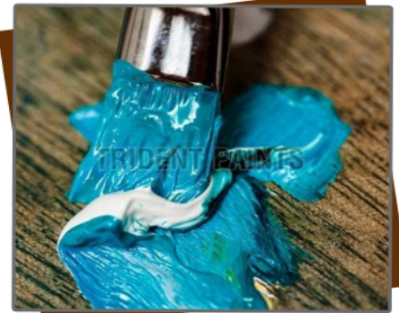
Aliphatic Acrylic Paint