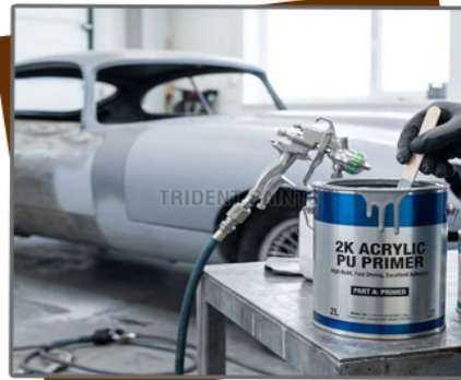
2K Acrylic PU Primer