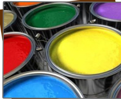
Intumescent Fire Protective Coating