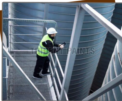
Ballast Tank Coating