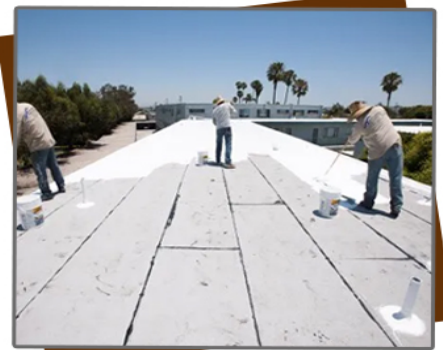
Cool roof coating