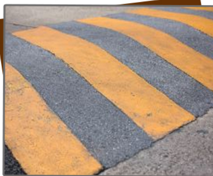
Road Line Marking Paint