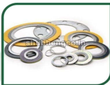
Spiral Wound Gasket