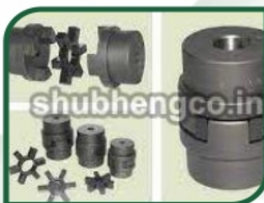
Carbon Steel External Star Coupling and Internal Circlips