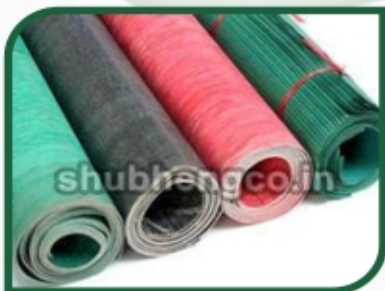
Non Asbestos Jointing Sheet