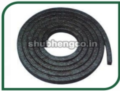
Asbestos Gland Packing Rope