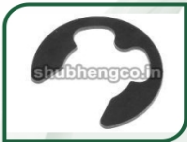
Asbestos Gland Packing Rope