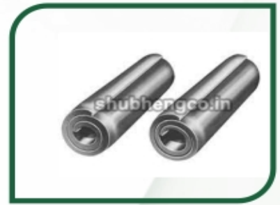
Spiral Dowel Pins