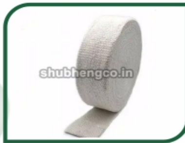
Ceramic Fiber Tape