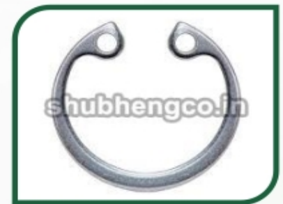
Stainless Steel Internal Circlips