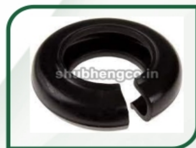
Flexible Tyre Coupling