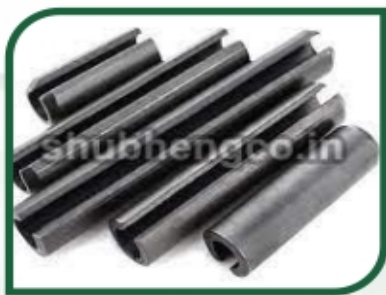
Spring Dowel Pins