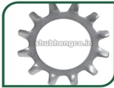
External Tooth Lock Washer