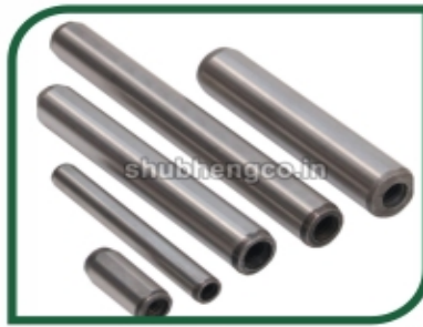
Internal Threaded Dowel Pins