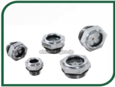
Knob Type Oil Level Indicator