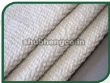
Asbestos Gland Packing Rope