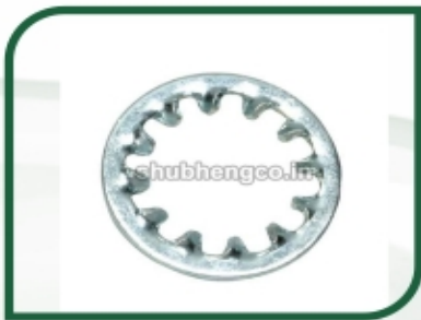
Internal Tooth Lock Washer