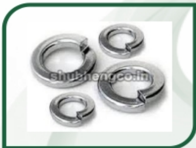
Square Spring Washer