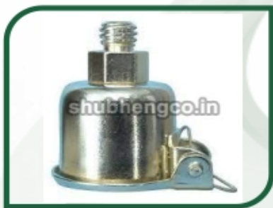
Lubricating Oil Cup