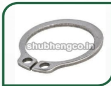
Stainless Steel External Circlips