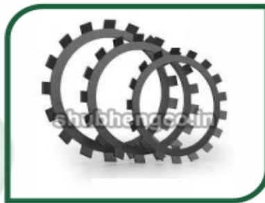
MB Lock Washer