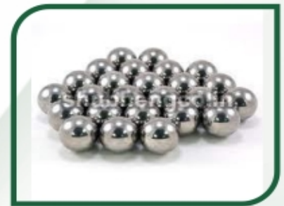
Steel Bearing Balls