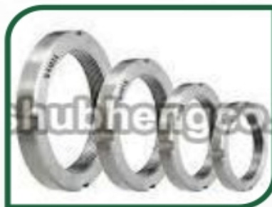
KM Lock Nut