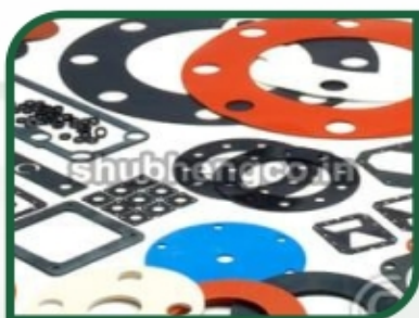
Ready Cut Gasket