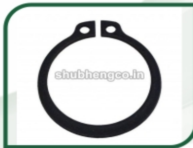
Carbon Steel External Circlips