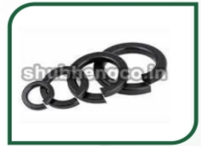
Flat Spring Washer