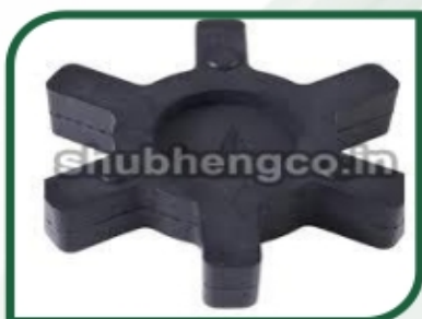
Rubber Star Coupling