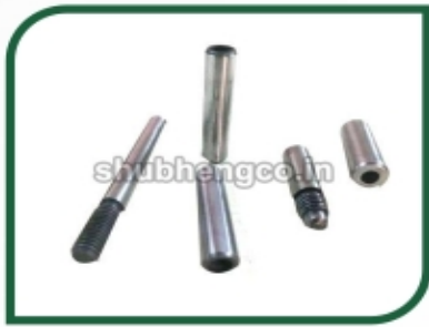
External Threaded Dowel Pins