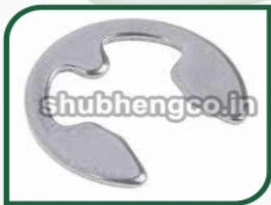
Stainless Steel E Type Circlips