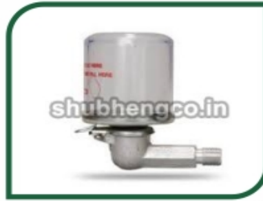
Constant Oil Level Indicator