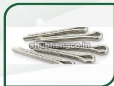
Carbon Steel Internal Circlips