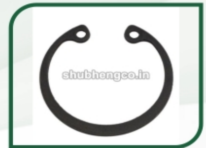
Carbon Steel Internal Circlips