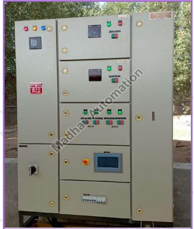
MOTOR CONTROL CENTER PANEL