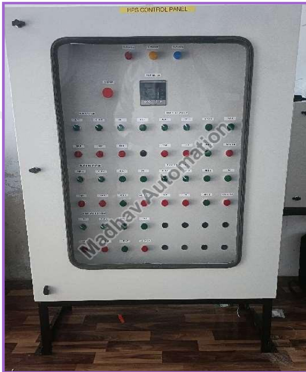
HYDRO PNEUMATIC CONTROL PANEL