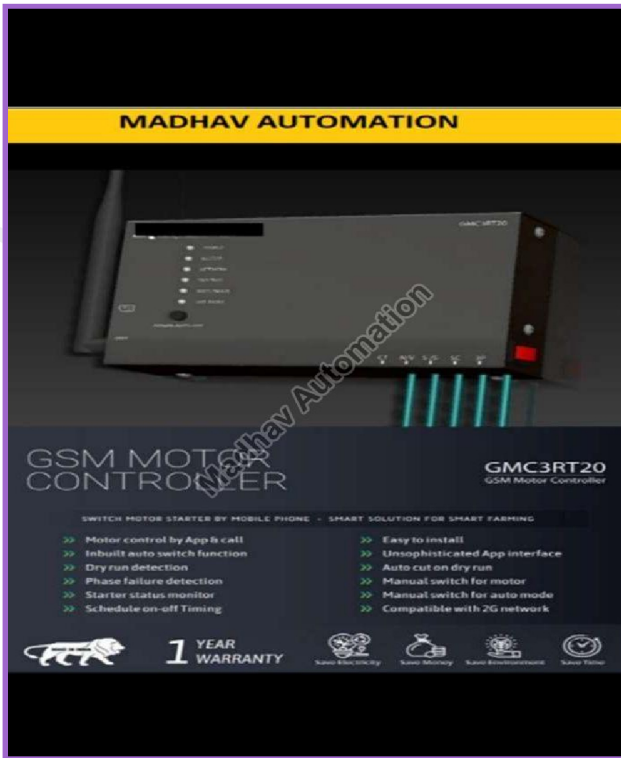
MOBILE STARTER PANEL