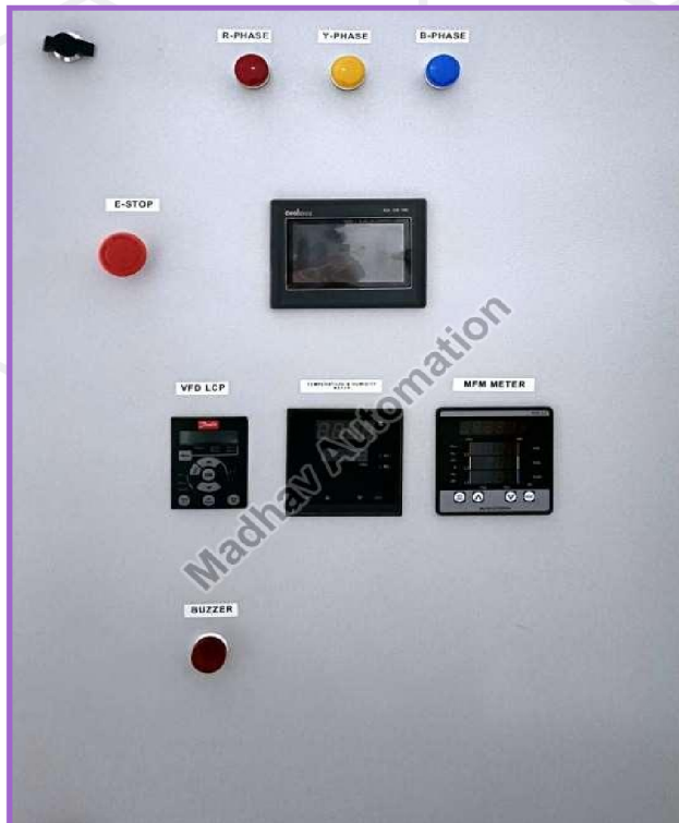
ORGANIC WASTE COMPOSITE MACHINE PANEL