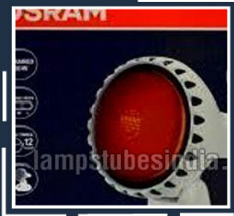
150W Osram Infrared Lamp