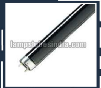
Blacklight Blue Fluorescent Lamp