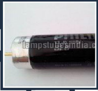
BLB-08 Philips Ultraviolet Lamp