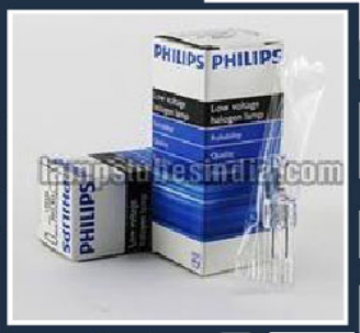
Low Voltage Halogen Lamp