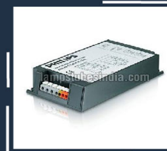
CDM Lamp Ballast