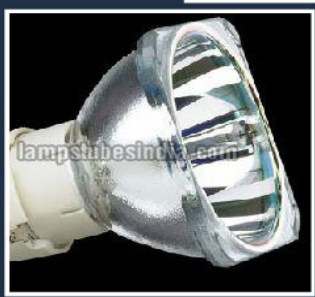
Philips Platinum Lamp