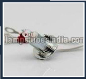
Hitachi Auto Analyzer Lamp