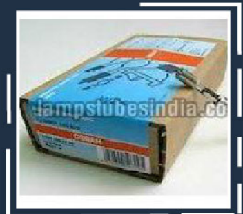
Osram HBO 100W/2 Short Arc Mercury Lamp