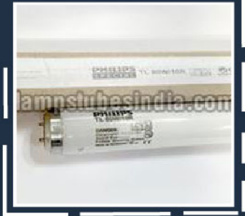
PHILIPS TL 80W/10R Tube