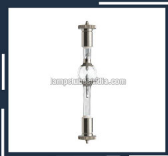
Osram HBO 50W/AC L2 Short Arc Mercury Lamp