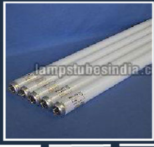
PHILIPS TLK 40W/10R Tube