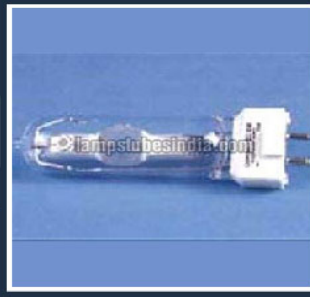
Metal Halide Lamp