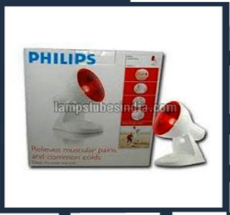
150W Philips Infrared Lamp