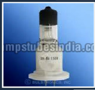
Hanaulux OT Light