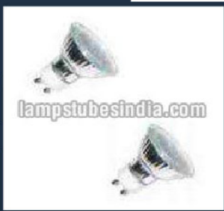
Osram LED Lamp