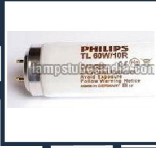
PHILIPS TL 60W/10R Tube