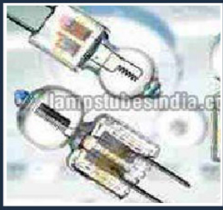
Halogen XIR Lamp