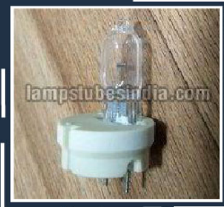
Haag Streit Slit Lamp