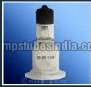
Hanaulux Operation Theatre Lamp