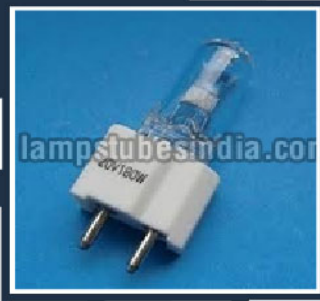
Steris OT Light