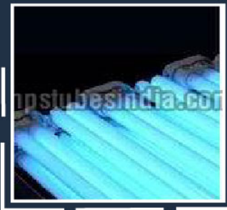
Philips UVB Lamp