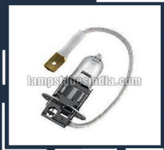
Dental Halogen Lamp