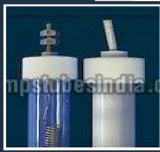
Quartz Infrared Heater