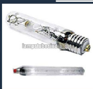
Sodium Vapour Lamp