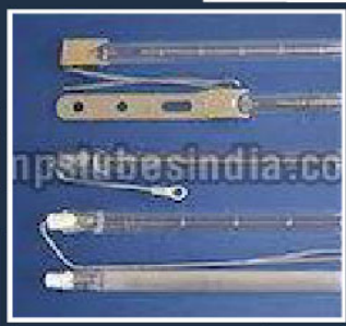
Short Wave Infrared Heater