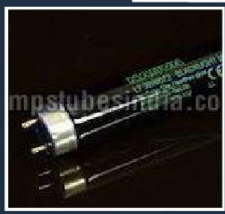
BLB Narva Fluorescent Lamp