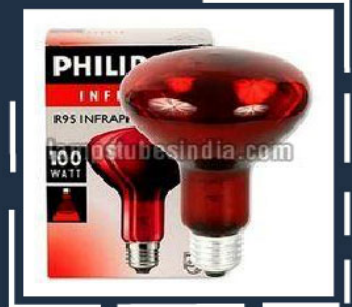
100W Philips Infrared Lamp