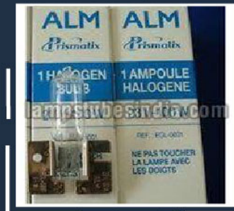
Prismatix ALM Halogen Bulb