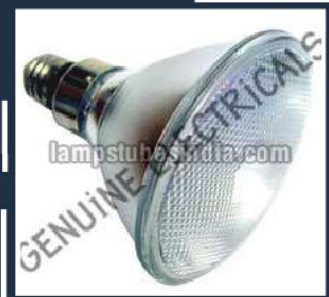
Parabolic Aluminized Reflector Lamp