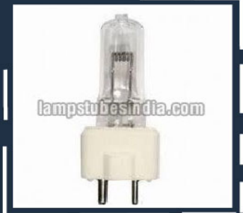
AMSCO OT Light