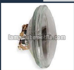
Sealed Beam Lamp