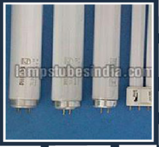
10R - UV-A Reflector Coated Philips Ultraviolet Lamp