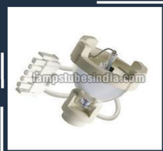
XBO R 100W/45 C Osram Xenon Lamp