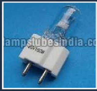
Steris Operation Theatre Lamp