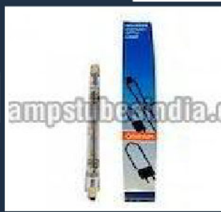
Osram Video Shooting Lamp