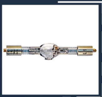
Osram HBO 50W/AC L1 Short Arc Mercury Lamp