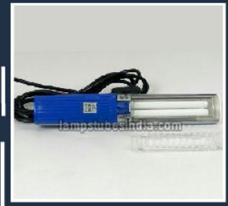
Philips UVB Lamp