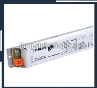
TL-D Lamp Ballast