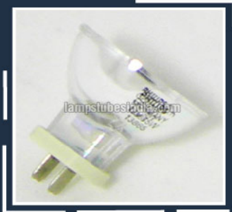
Dental Hardening Lamp