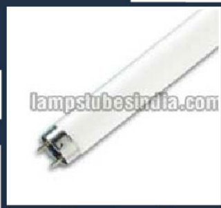
Actinic Colour/05 Fluorescent Lamp