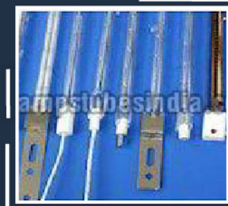
Philips IRK Infrared Heater