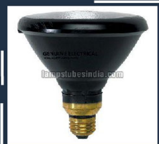
Sylvania 100W/R NDT Spare Lamp