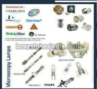
Xenon Microscope Lamp