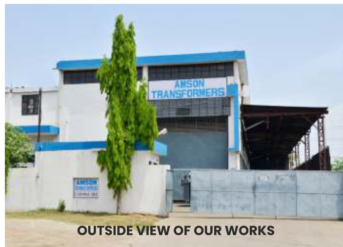
OUTSIDE VIEW OF OUR WORKS