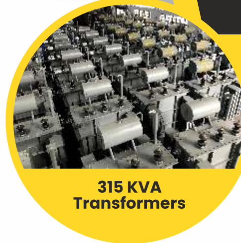
315 KVA Transformers