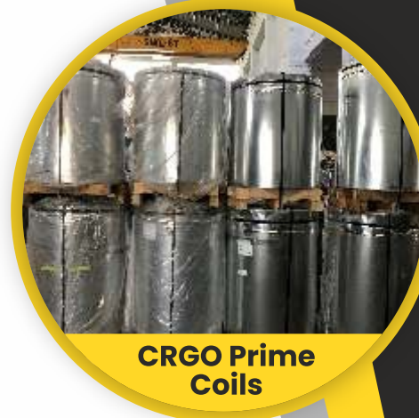
CRGO Prime Coils

We are backed by an efficient Technical Team and workforce which is capable of providing a quality range of transformers known for its durability, reliability, low energy consumption and excellent performance. Our team works in close coordination with the clients to understand their requirements in a better way. They contact our clients on regular basis to know their ever-growing demands and needs. All our professionals have years of experience in their respective domain which helps us provide customization as per the specifications detailed by our clients.