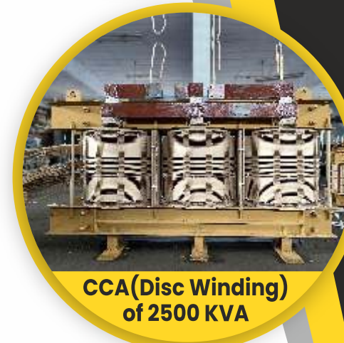
CCA (Disc Winding) of 2500 KVA