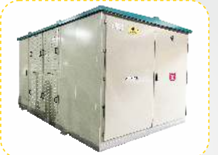
Compact Sub-Station (CSS)