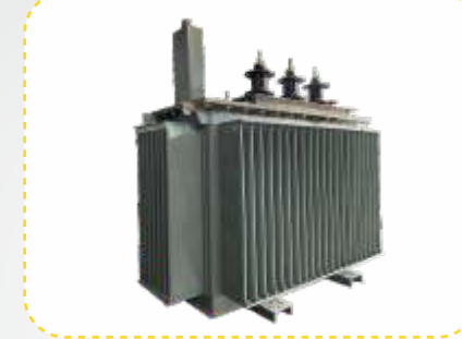
Hermetically Sealed Corrugated Type Transformer