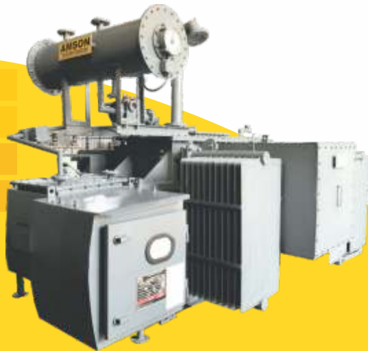
Distribution Transformer with OLTC