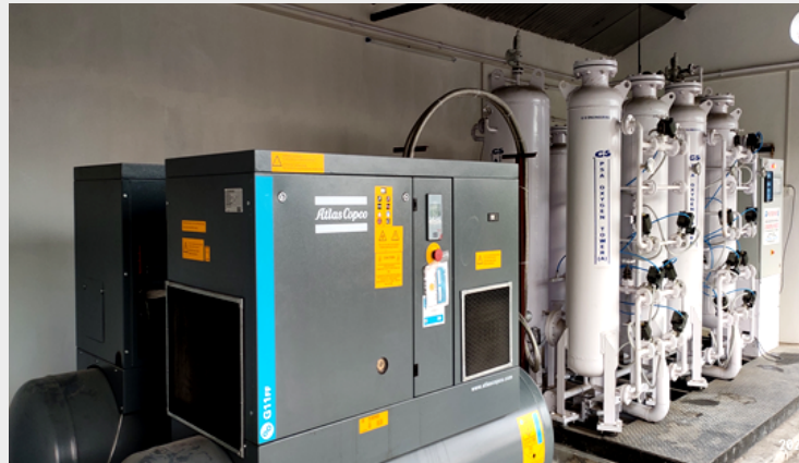
LAXMI SURGICAL & TRAUMA CENTER-HAVERI. KARNATAKA PLANT CAPACITY 200 LPM