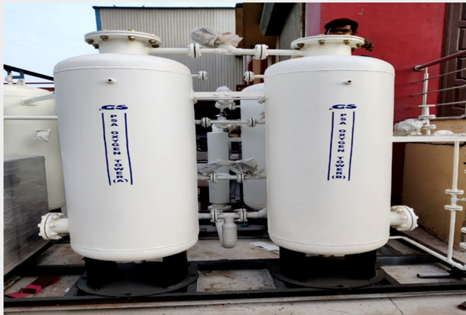
JESUS, MARRY & JOSEPH HOSPITAL-BANGALORE. PLANT CAPACITY-250 LPM