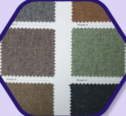
Wool Tweed Fabric