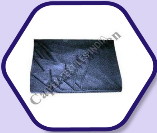
Emergency Woolen Blankets