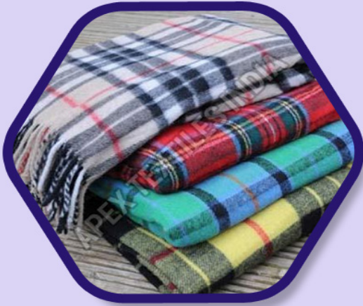
Tartan Woolen Blankets