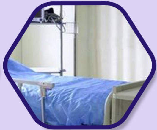
Hydrophobic Non Woven Fabric