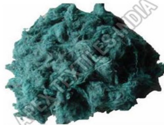
Recycled Pulled Fibers