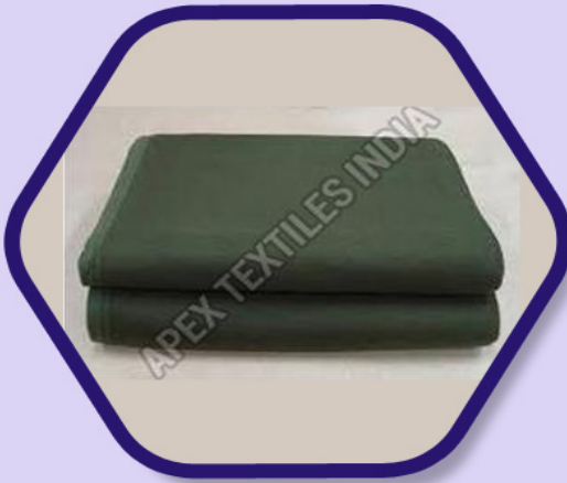
Olive Green Woolen Blankets