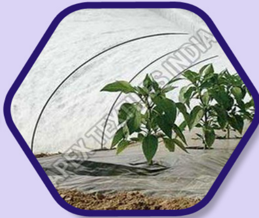
UV Treated Non Woven Fabric