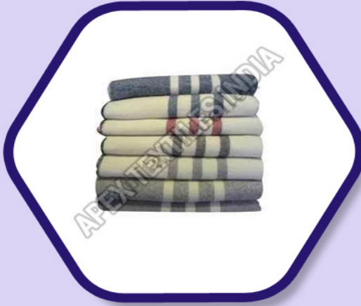
Soft Woolen Blankets