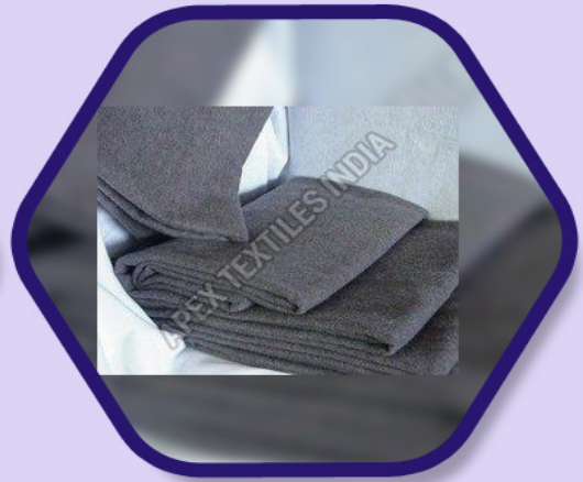
Grey Woolen Blankets