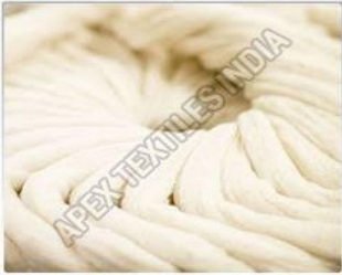
Scoured Wool Tops