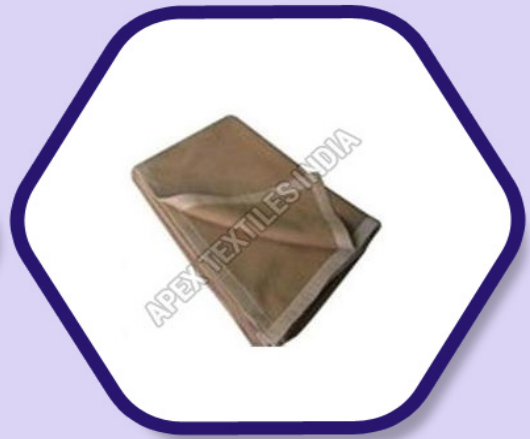
Railway Woolen Blankets