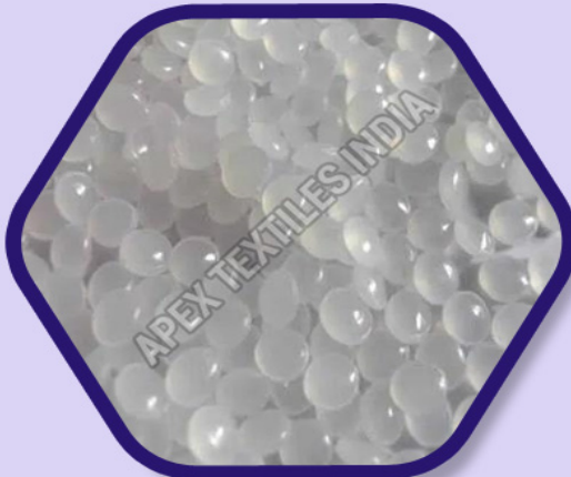
PP Grinding Granules