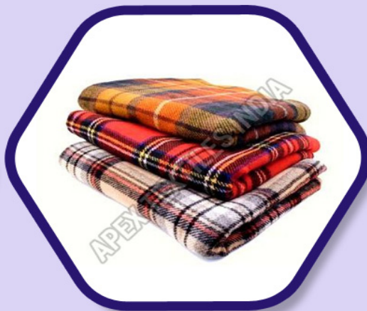
Striped Woolen Blanket