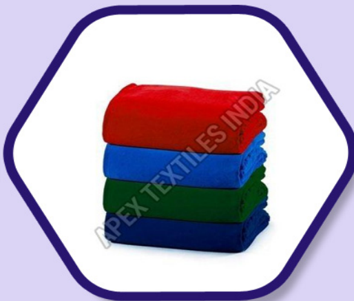
Polar Fleece Blankets