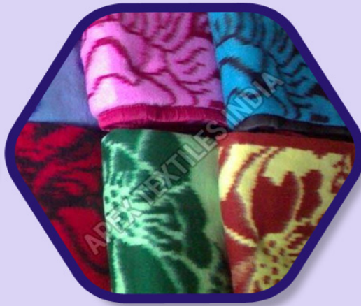
Printed Acrylic Blankets