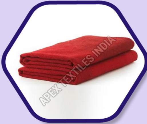
Handloom Woolen Blankets