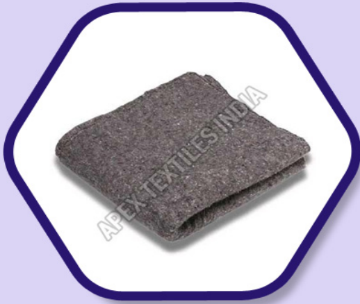
Relief Acrylic Blankets