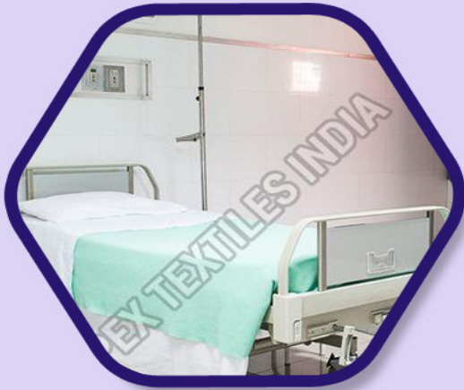
Antimicrobial Non Woven Fabric