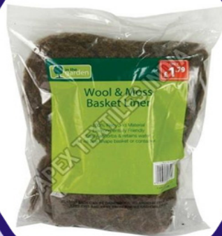
Hanging Basket Liner