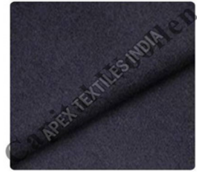
Woolen Blazer Fabric