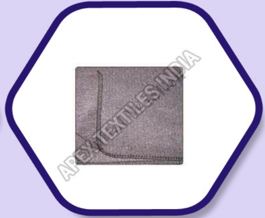
Relief Woolen Blankets