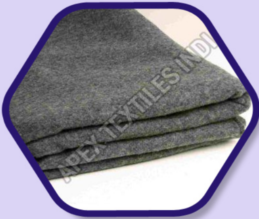
Survival Woolen Blankets