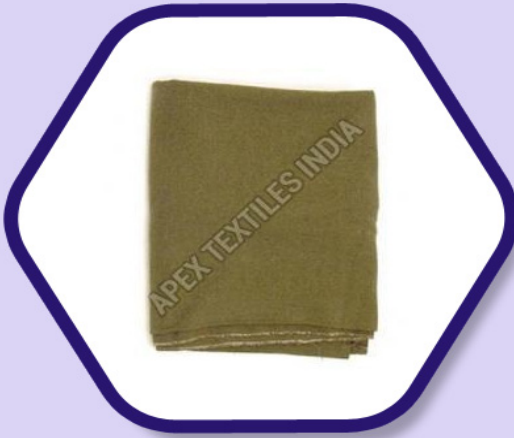
Military Woolen Blankets