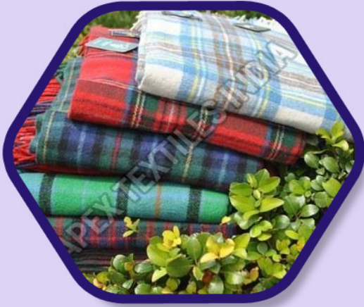
Merino Woolen Blankets