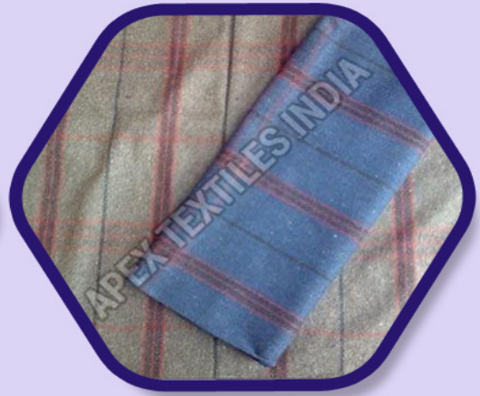
Disaster Woolen Blankets