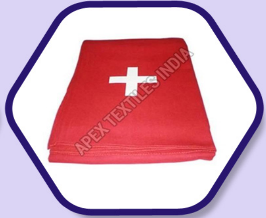
Hospital Woolen Blankets