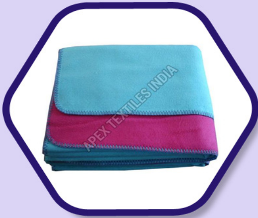
Airline Fleece Blankets