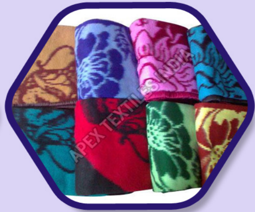
Soft Acrylic Blankets