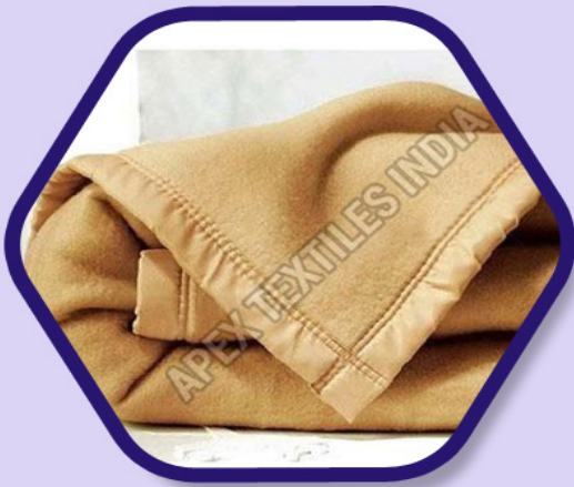
Hotel Woolen Blankets