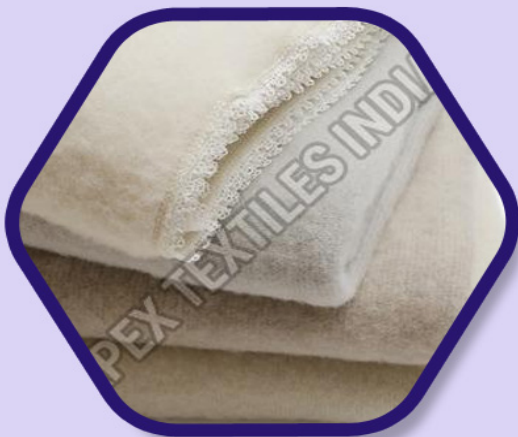
Plain Woolen Blankets