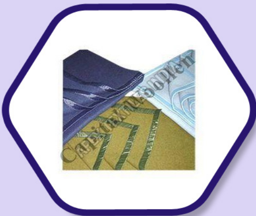
Shoddy Woolen Blankets