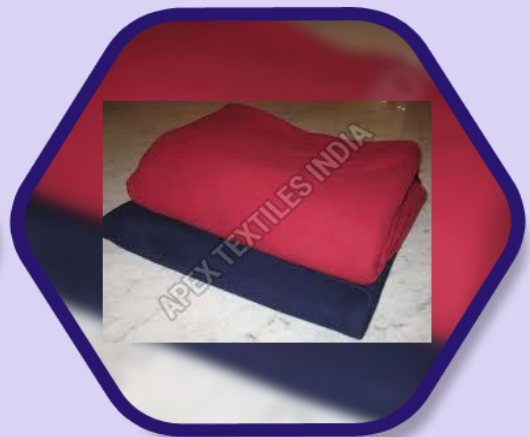
UNHCR Fleece Blankets