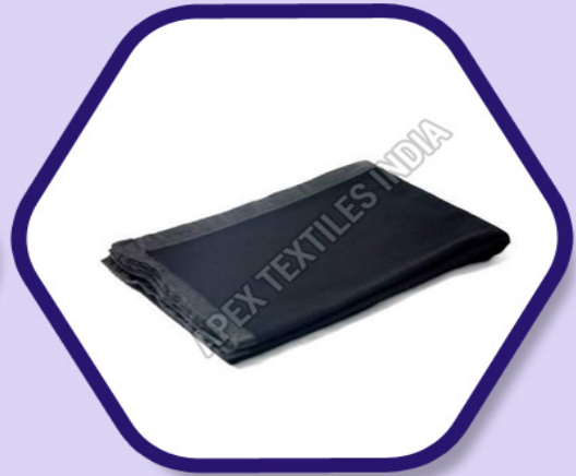
Navy Blue Woolen Blankets