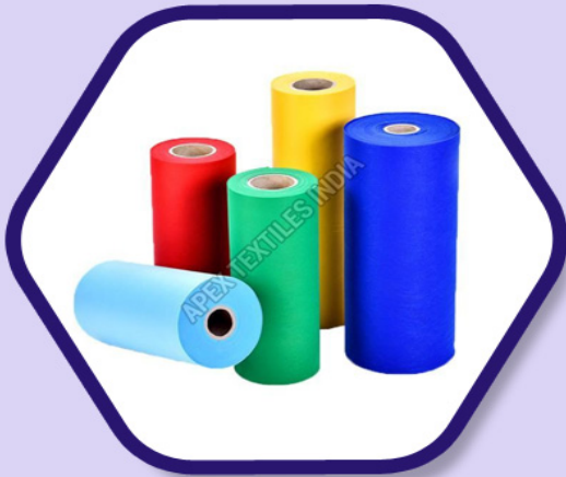
PP Spun Bonded Non Woven Fabric