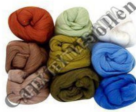
Merino Wool Tops