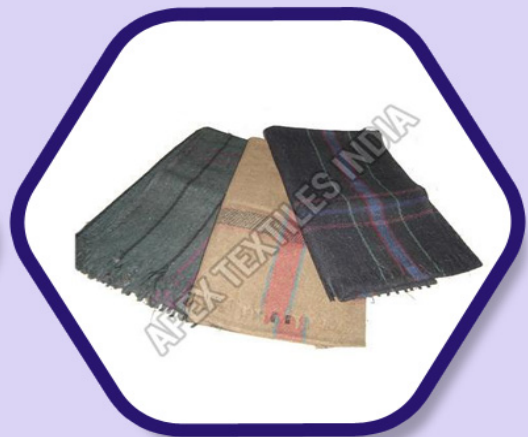
Donation Woolen Blankets