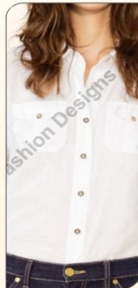
Ladies Formal Top