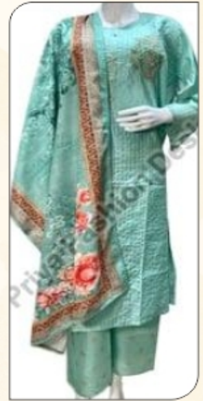
Ladies Palazzo Suit