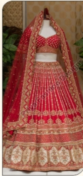
Bridal Lehenga Choli