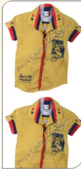
Kids Fancy Shirt