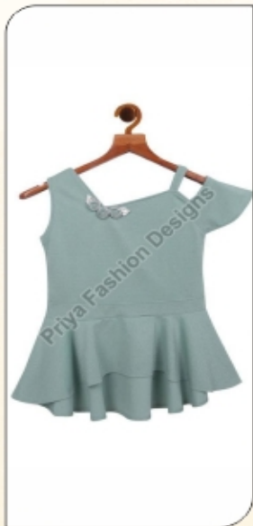
Kids Party Wear Top