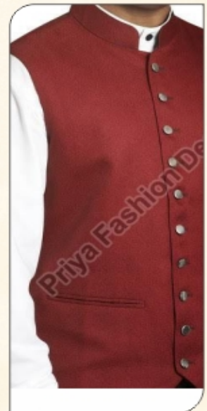
Mens Nehru Jacket