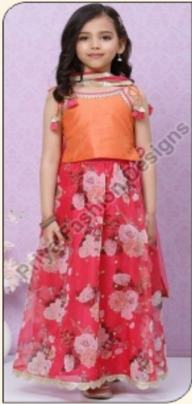
Kids Lehenga Choli