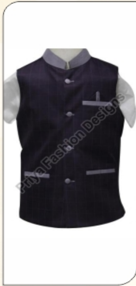
Kids Nehru Jacket