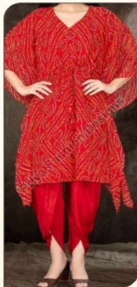
Ladies Kaftan Dhoti Pants Set