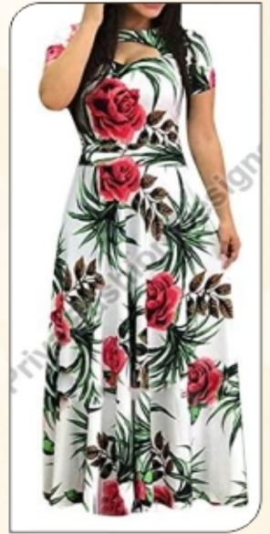
Ladies Maxi Dress