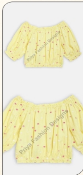
Kids Printed Top