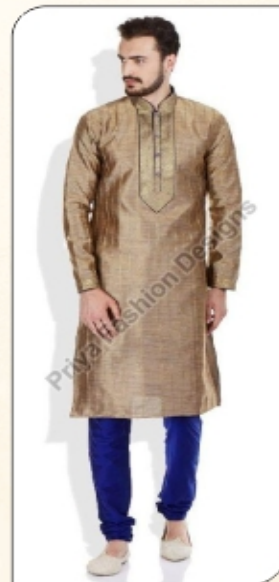
Mens Kurta Churidar Set