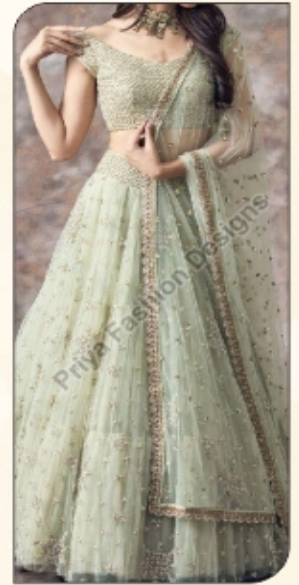
Embroidered Lehenga Choli