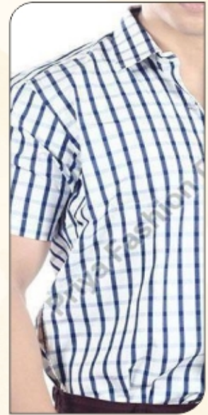
Mens Half Sleeve Shirt