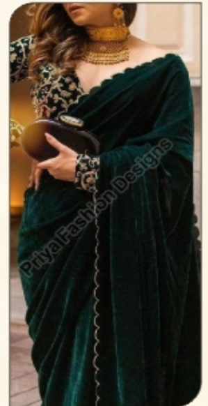
Party Wear Saree