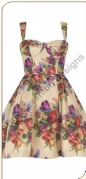
Ladies Short Dress