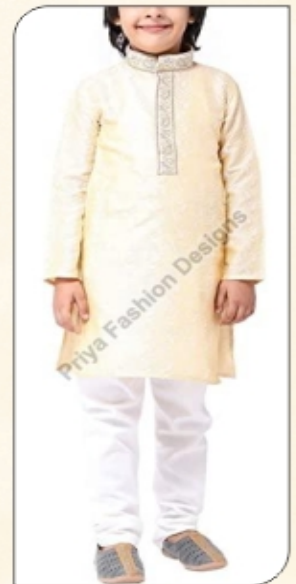
Kids Kurta Churidar Set