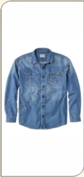
Mens Denim Shirt