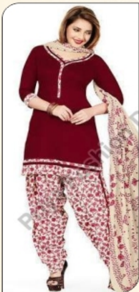
Ladies Salwar Suit