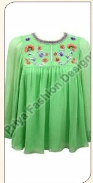
Ladies Party Wear Top