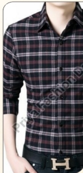
Mens Checkered Shirt