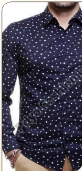
Mens Printed Shirt