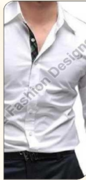
Mens Formal Shirt