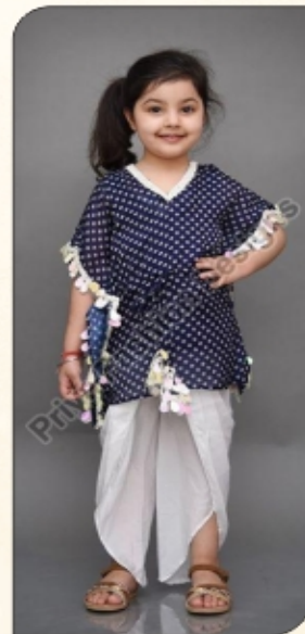
Kids Kaftan with Dhoti Pants