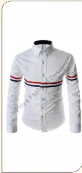
Mens Designer Shirt