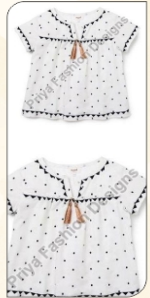
Kids Cotton Top