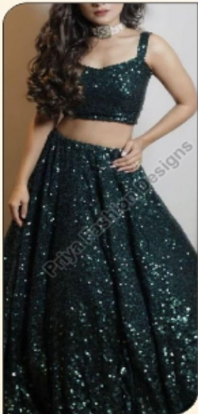
Party Wear Lehenga Choli