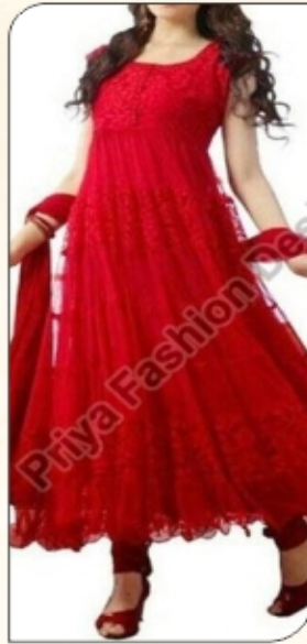
Ladies Anarkali Suit