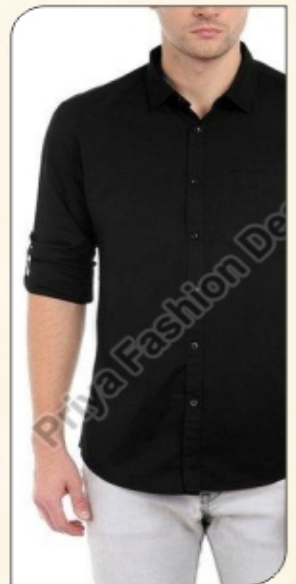
Mens Cotton Shirt