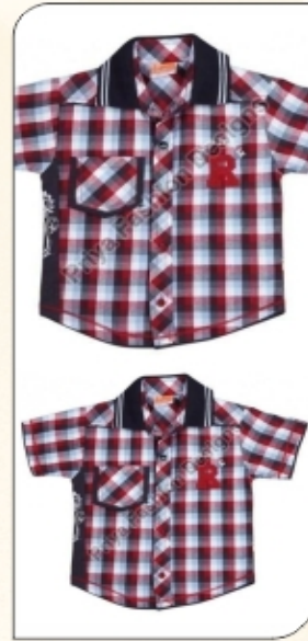
Kids Half Sleeve Shirt