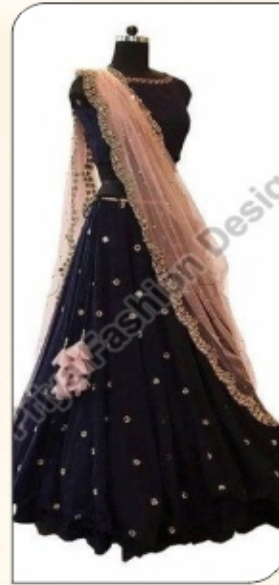
Designer Lehenga Choli