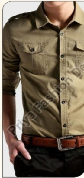
Mens Fancy Shirt