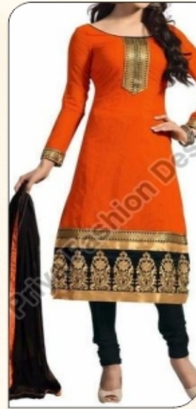
Ladies Churidar Suit