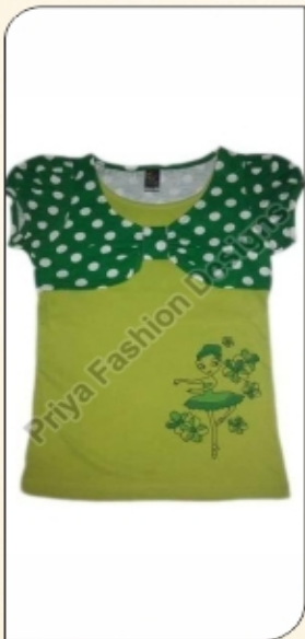
Kids Fancy Top