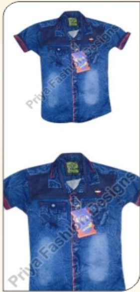
Kids Denim Shirt