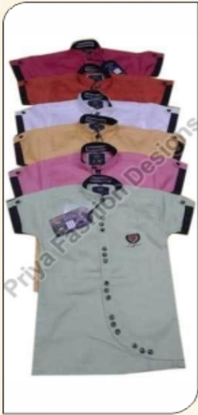
Kids Cotton Shirt