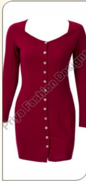
Ladies Bodycon Dress