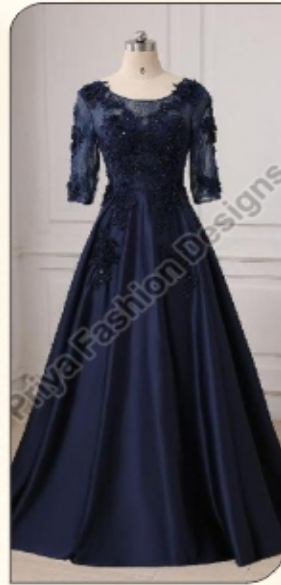
Ladies Evening Gown