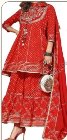
Ladies Sharara Suit