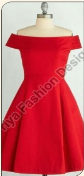
Ladies One Piece Dress