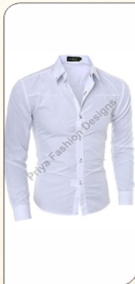
Mens Slim Fit Shirt