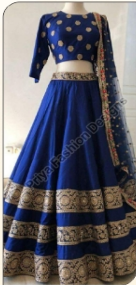
Silk Lehenga Choli