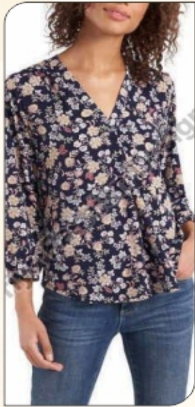
Ladies V Neck Top