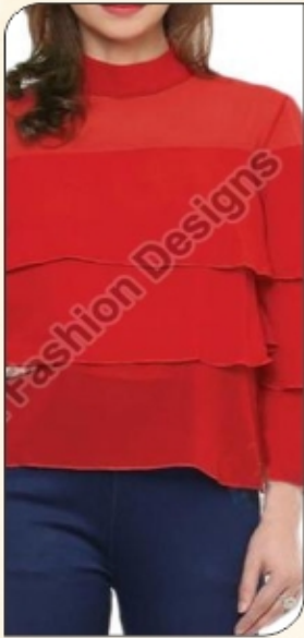
Ladies Stylish Top