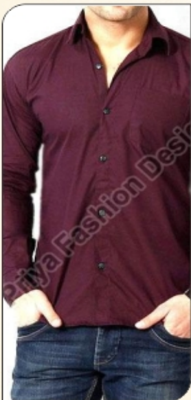
Mens Plain Shirt