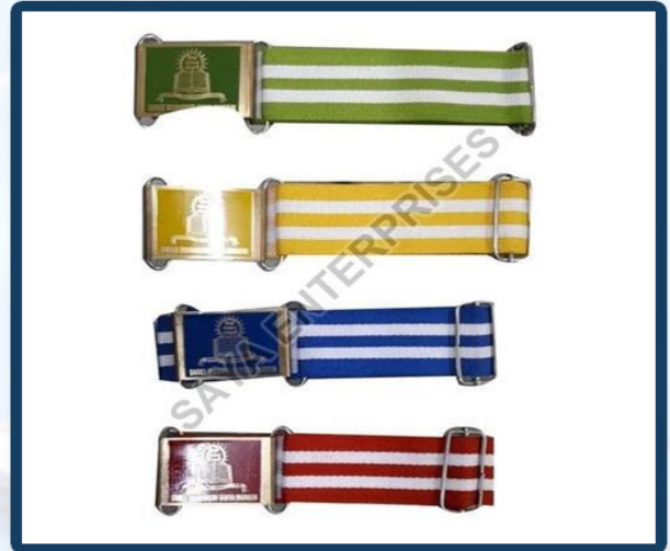
School Uniform House Belt