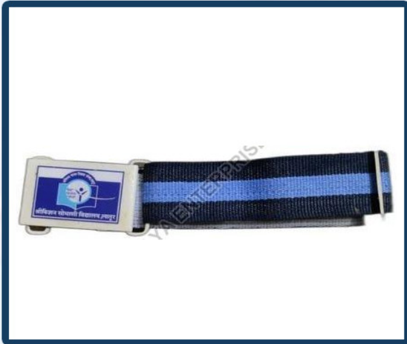
Boys School Belt