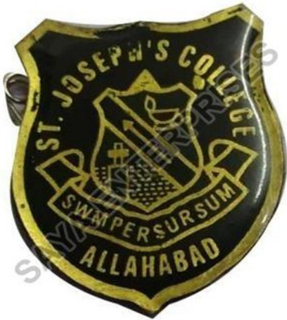
4 Inch Uniform Badge