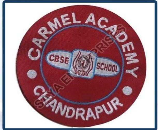
Maroon School Uniform Labels