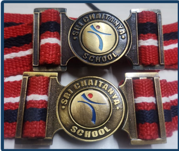
Red one is chaitanya school