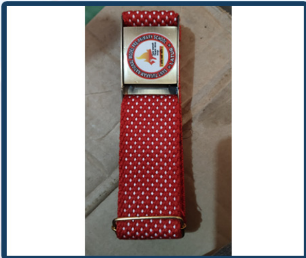
Fancy Flip Buckle Belt