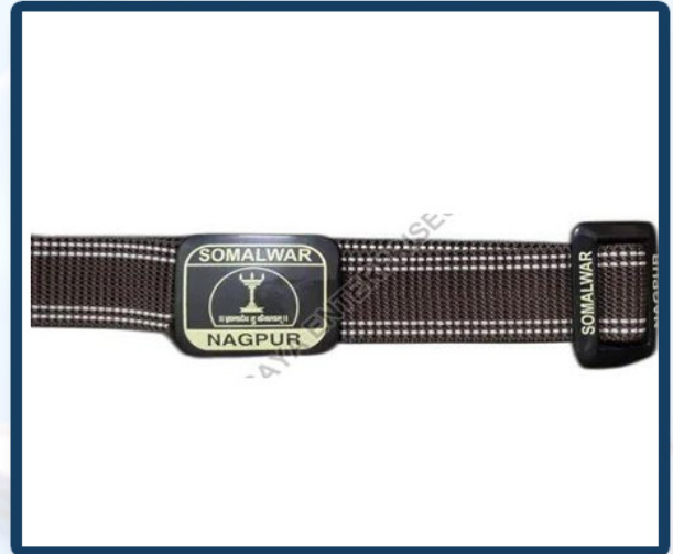
Brown School Uniform Belt