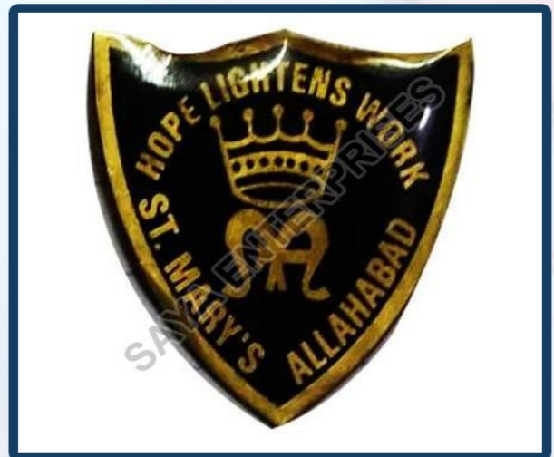
3 Inch Uniform Badge