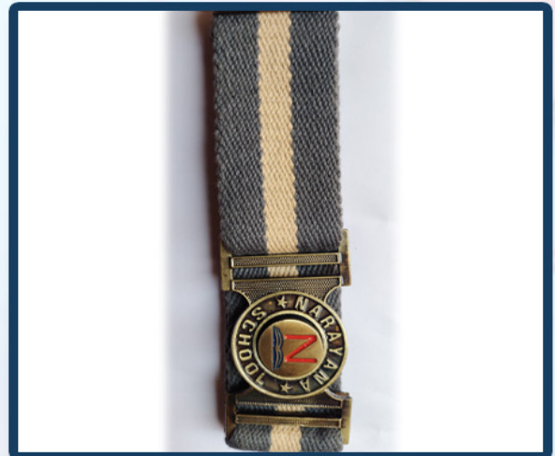
Grey one is narayana school