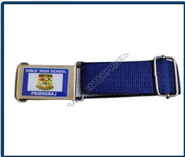
Girls School Belt