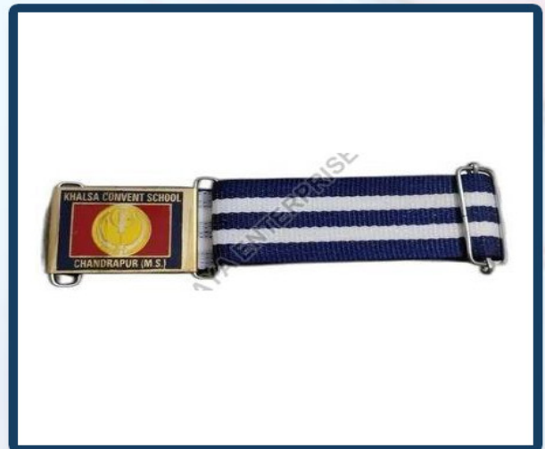
Nylon School Uniform Belt