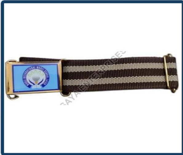
Polyester School Uniform Belt