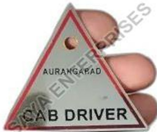
Cab Driver Token Plate