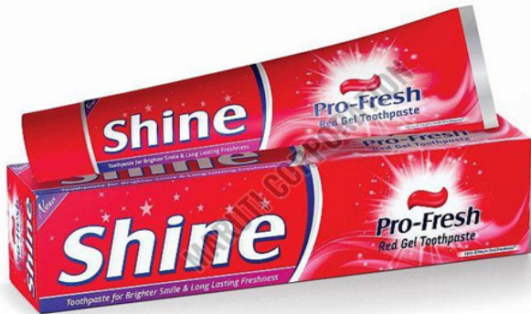
150 GM SHINE PRO FRESH RED GEL TOOTHPASTE