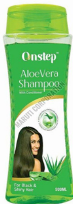
500 ML ONSTEP ALOE VERA SHAMPOO WITH CONDITIONER