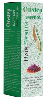
100 ML ONSTEP SAFFRON HAIR SERUM