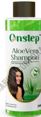
200 ML ONSTEP ALOE VERA SHAMPOO