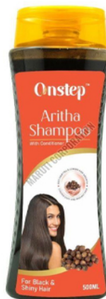
500 ML ONSTEP ARITHA SHAMPOO WITH CONDITIONER