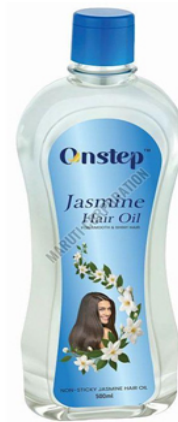
500 ML ONSTEP JASMINE HAIR OIL