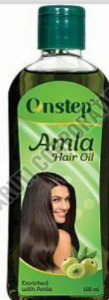
500 ML ONSTEP AMLA HAIR OIL