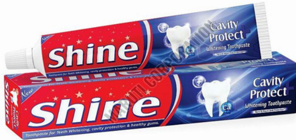
80 GM SHINE CAVITY PROTECT WHITENING TOOTHPASTE