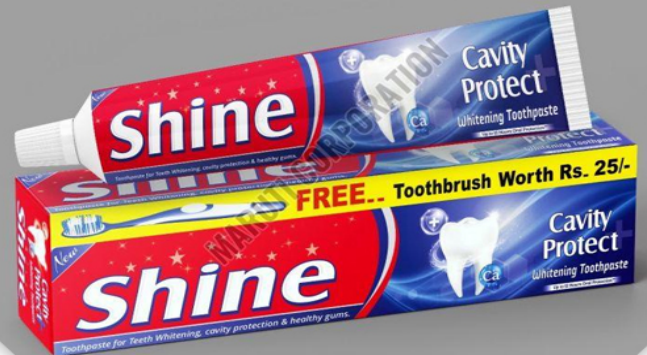
170 GM SHINE CAVITY PROTECT WHITENING TOOTHPASTE