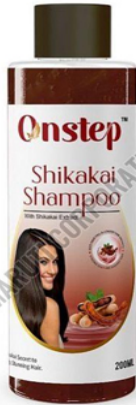
200 ML ONSTEP SHIKAKAI SHAMPOO