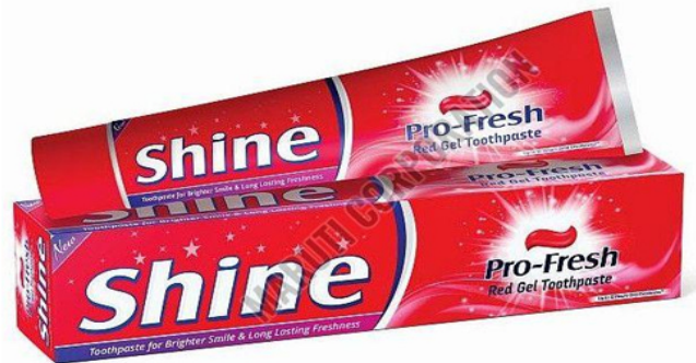
70 GM SHINE PRO FRESH RED GEL TOOTHPASTE