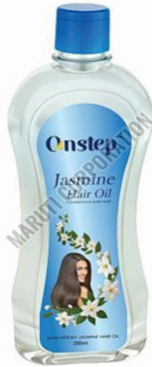
200 ML ONSTEP JASMINE HAIR OIL