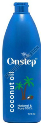
175 ML ONSTEP COCONUT OIL