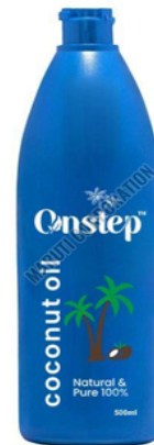
500 ML ONSTEP COCONUT OIL