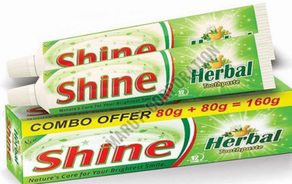
80 GM + 80 GM COMBO PACK SHINE HERBAL TOOTHPASTE