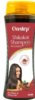
500 ML ONSTEP SHIKAKAI SHAMPOO WITH CONDITIONER