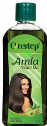
1 LITRE ONSTEP AMLA HAIR OIL