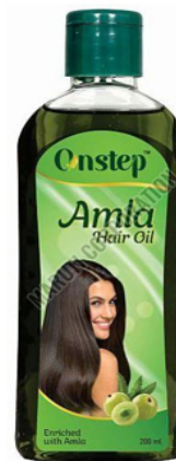
200 ML ONSTEP AMLA HAIR OIL