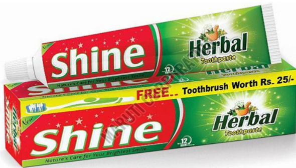
170 GM SHINE HERBAL TOOTHPASTE