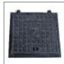
MHC HINGED 18X18- 10 KG