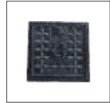
MHC 300X300- 4 KG