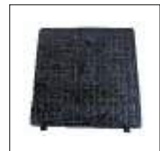
MHC HINGED 24X24- 30 KG