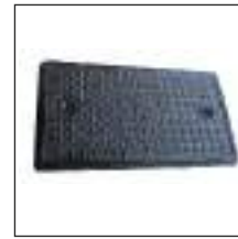
MHC 450X900- 50 KG