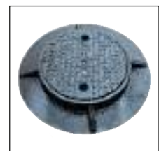
MHC CIRCULAR SHAPE- 208 KG