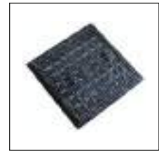
MHC 450X450- 10 KG