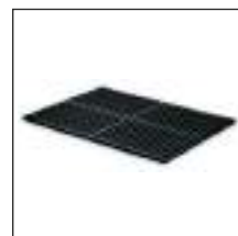
C. I. GRATE