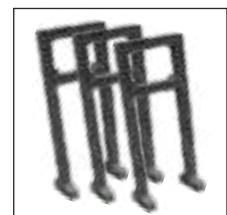
C.I. FOOT STEP