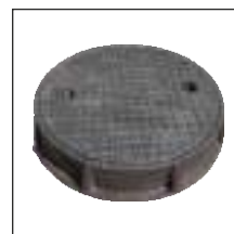
MHC CIRCULAR SHAPE- 175 KG