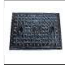
MHC 450X600- 15 KG