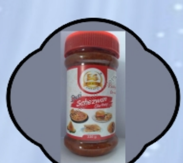
Piano Fitness Rack