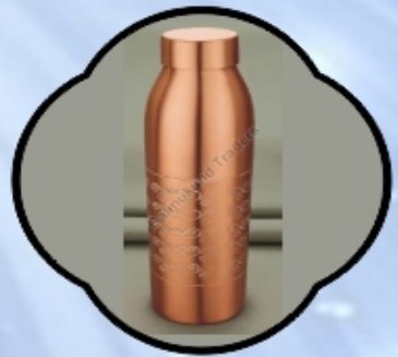
R-51 Copper Bottle