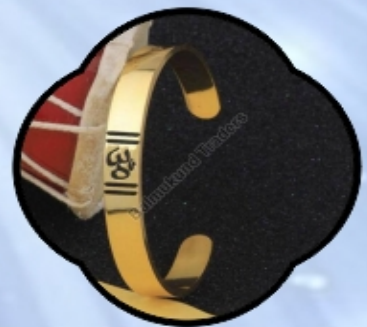
Mens Artificial Kada