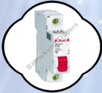
Himel HDB3WA1C3 MCB