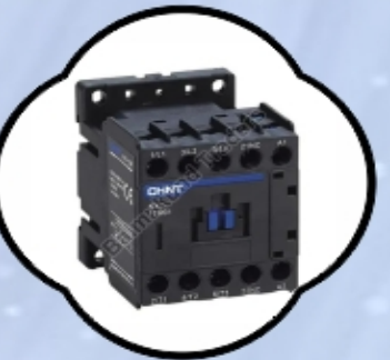
Chint NXC-12M01 AC Contactor