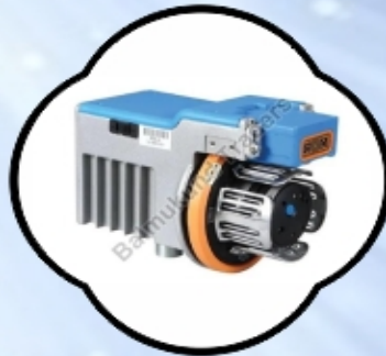
Sanhe SHJ-A Weft Feeder