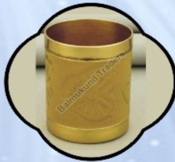
R-221 Brass Glass