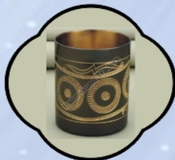
R-210 Brass Glass