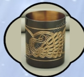
R-213 Brass Glass