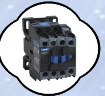
Chint NXC-09 AC Contactor