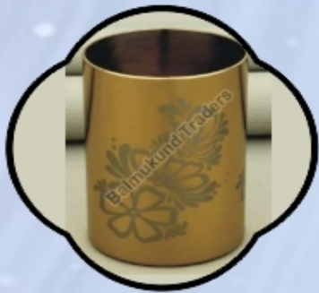
R-219 Brass Glass