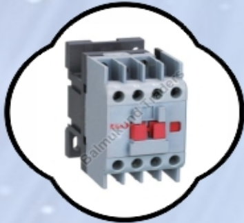
Himel HDC3-3211 110V 50hz