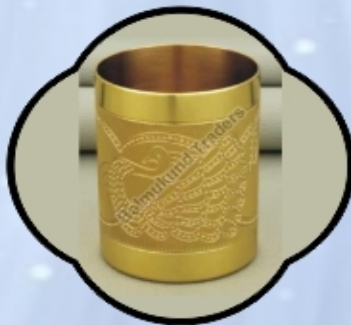
R-202 Brass Glass