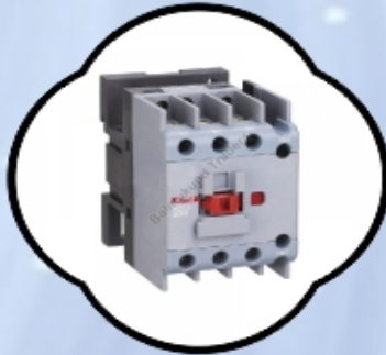
Himel HDC32510 MCB