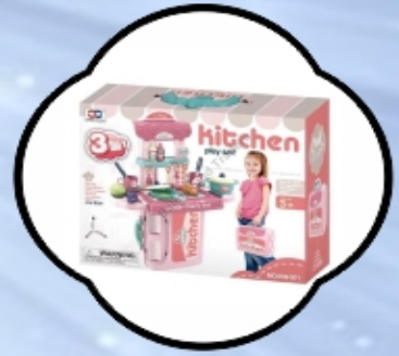
Kitchen Play Set