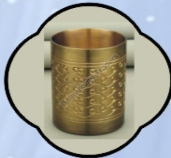
R-208 Brass Glass