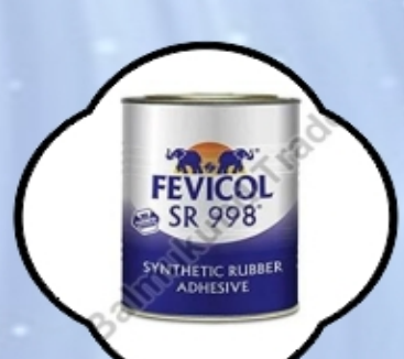
Fevicol SR 998 Adhesive