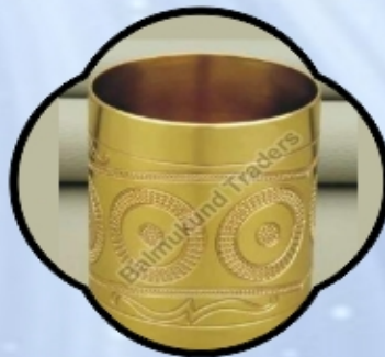
R-203 Brass Glass