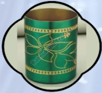
R-215 Brass Glass