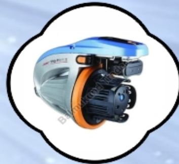
Sanhe SHJ-P Weft Feeder