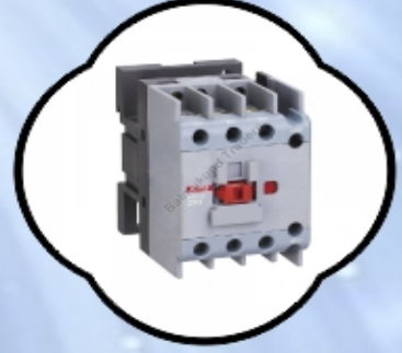
Himel HDC32510 MCB