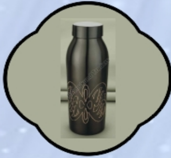
R-53 Copper Bottle