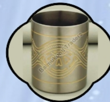
R-214 Brass Glass