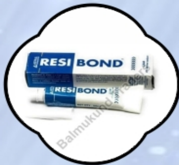
Resibond Silicone Sealant