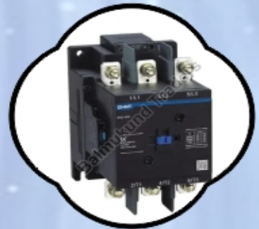
Chint NXC-400 AC Contactor