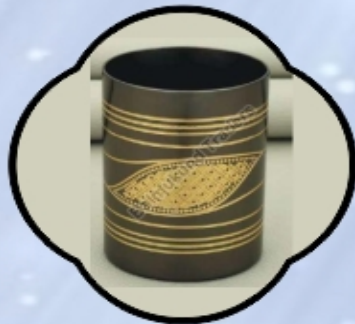
R-206 Brass Glass