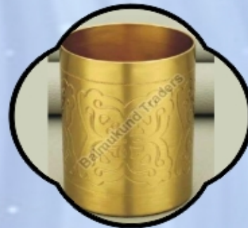
R-209 Brass Glass