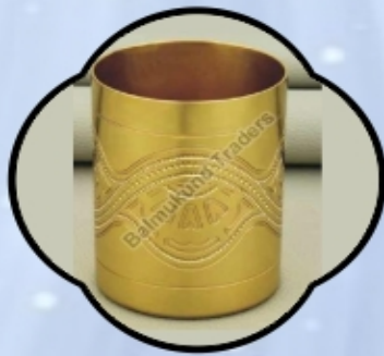
R-220 Brass Glass