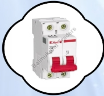
Himel HDB3WA2D13 MCB