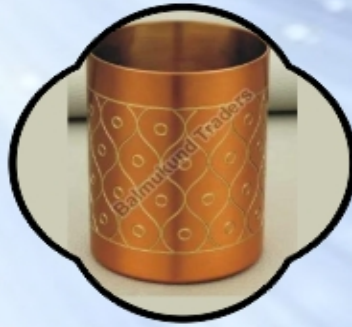
R-217 Brass Glass