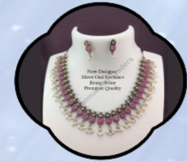
Silver Oxidised Necklace Set