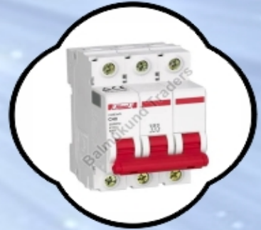
Himel HDB3WL3D32 MCB