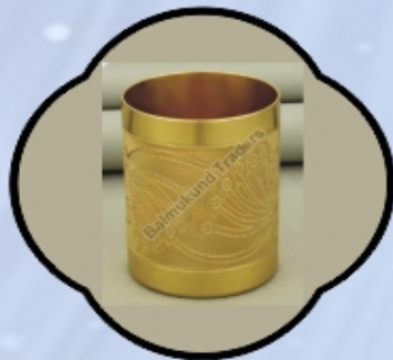
R-201 Brass Glass