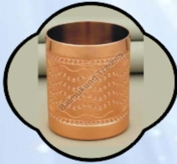
R-216 Brass Glass