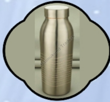
R-54 Copper Bottle