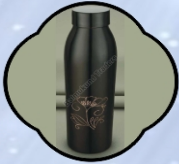
R-52 Copper Bottle