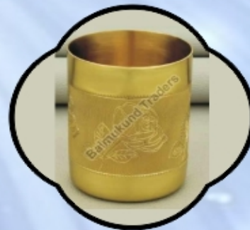
R-204 Brass Glass