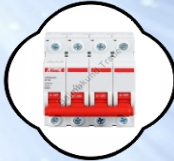
Himel HDB3WA4C32 MCB