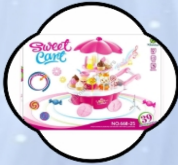
Sweet Cart Toy