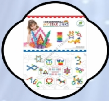
Building Block Toy