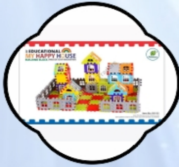
Happy House Toy