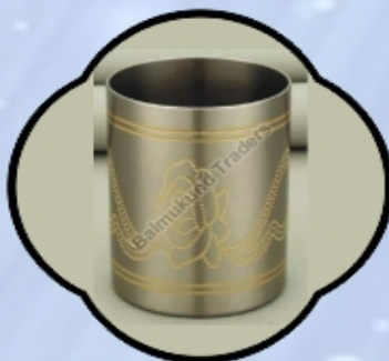
R-211 Brass Glass