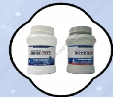
Bond Tite Adhesive