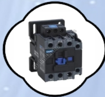
Chint NXC-32 AC Contactor