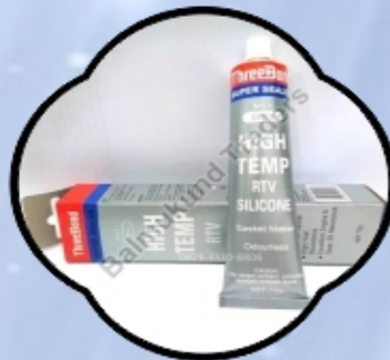
ThreeBond Silicone Sealant