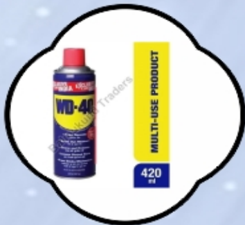
Pidilite WD-40 Silicone Sealant