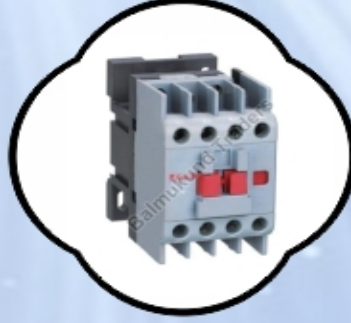
Himel HDC3-3211 110V 50hz