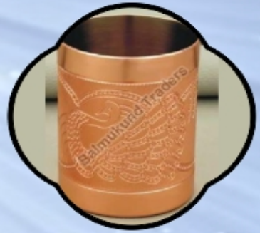
R-218 Brass Glass