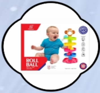
Roll Ball Toy