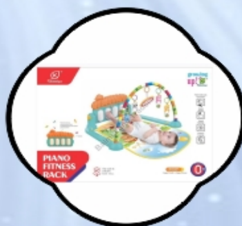
Piano Fitness Rack