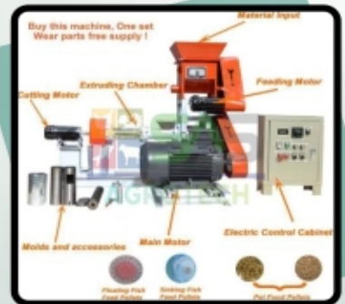
Single Screw Extruder