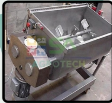
Paddle Type Mixer Machine