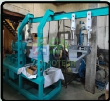
Shrimp Feed Plant