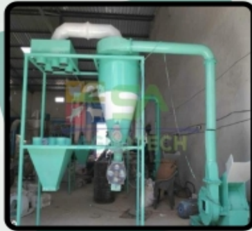
Cyclone Type Crusher