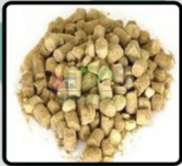
De Oiled Rice Bran