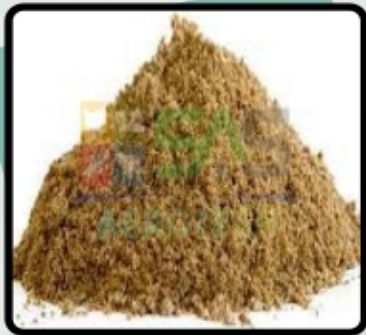
Meat Bone Meal