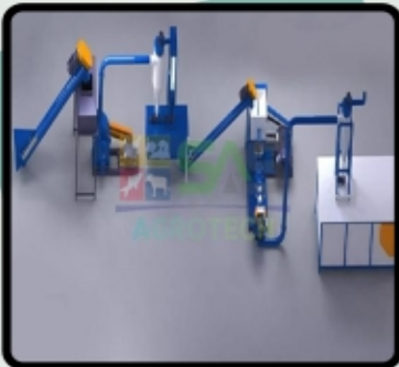
Pet Food Plant