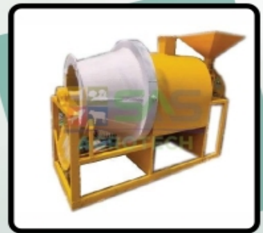
Muri Making Machine