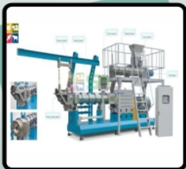
Twin Screw Extruder