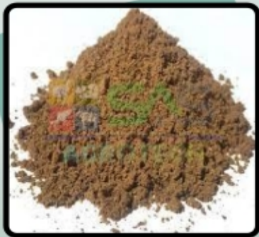
Shrimp Meal Powder