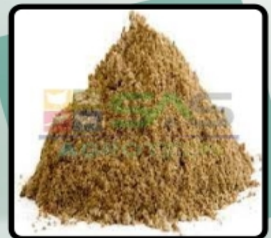
Chicken Meal Powder