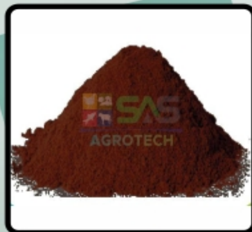
Blood Meal Powder