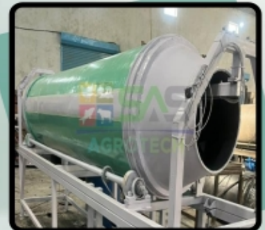
Automatic Continuous Flavoring Drum