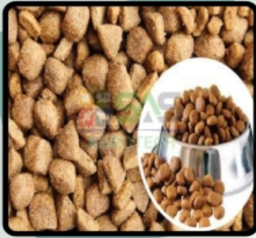
Dog & Cat Food