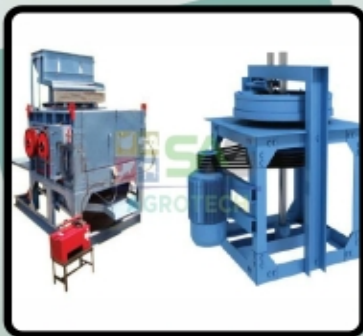
Poha Making Machine