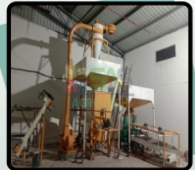
Poultry Feed Plant