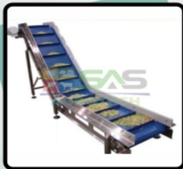
Belt Conveyor System