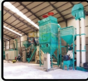
Cattle Feed Plant