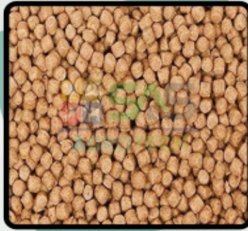
Floating Fish Feed