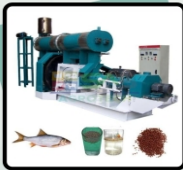
Fish Feed Extruder