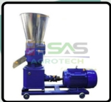
Flat Die Pellet Machine