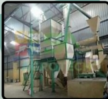
Spice Processing Plant