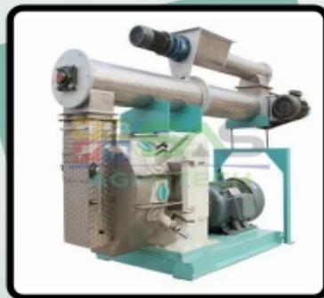
Ring Die Pellet Machine