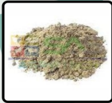
Fish Meal Powder