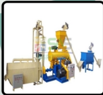
Pig Feed Plant