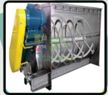
Ribbon Type Mixer Machine