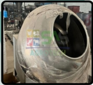
Manual Flavoring Drum