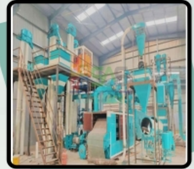
Fish Feed Plant