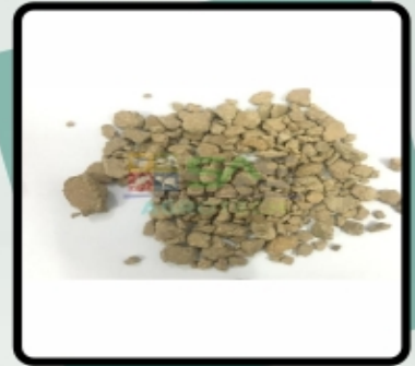
Ground Nut DOC