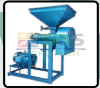
Gravity Type Crusher