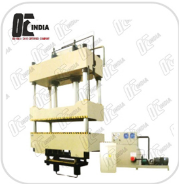
Four Column Hydraulic Press Machine