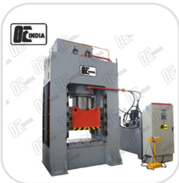
Heavy Duty Hydraulic Forging Press Machine