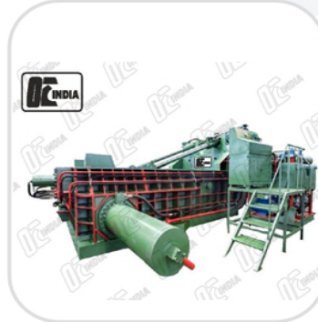
Double Action Metal Scrap Baling Machine