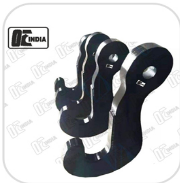
Heavy Duty Ladle Hook