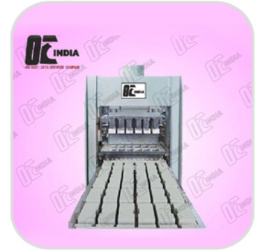
Fly Ash Brick Making Machine