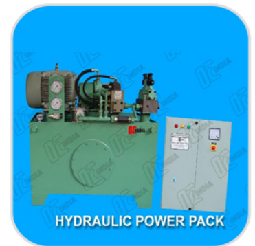
Hydraulic Power Pack