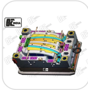
Plastic Injection Moulding Die