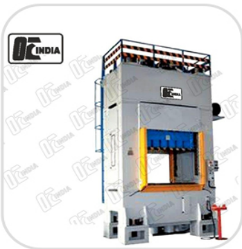
Light Duty Hydraulic H Frame Press Machine