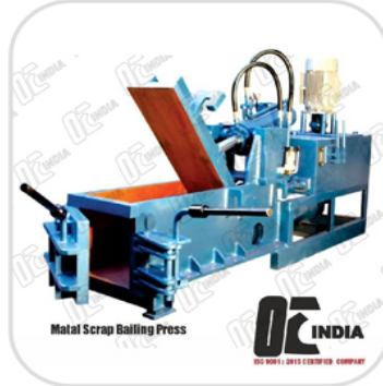
Automatic Metal Scrap Baling Machine