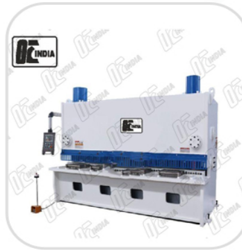
Hydraulic Shearing Press Machine