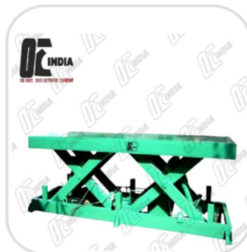
Hydraulic Heavy Duty Scissor Lift