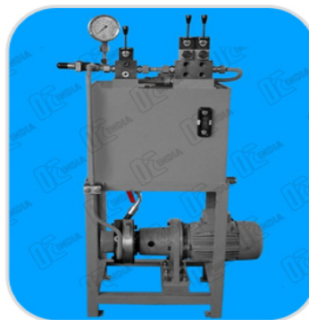
Roll Pairing Power Pack