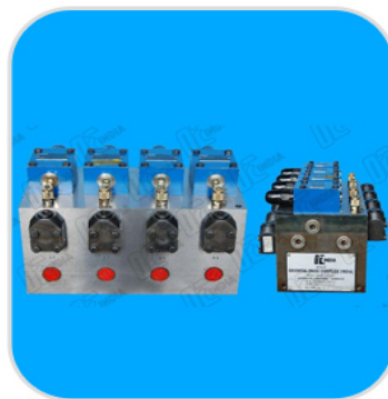
Synchronizer Control Block