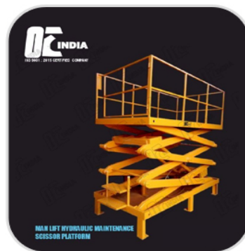
Hydraulic Maintenance Scissor Platform