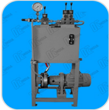
Hydraulic Cylinder Testing Power Pack.