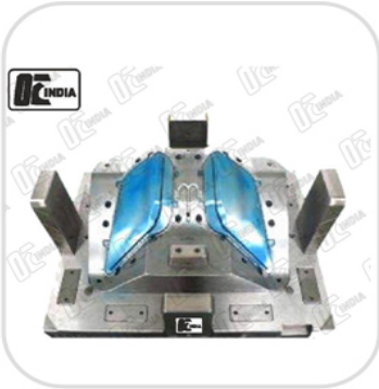
Melamine Moulding Die