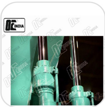
Industrial Hydraulic Cylinders