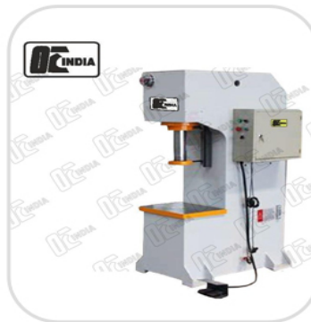
Multi Purpose C Type Hydraulic Press Machine