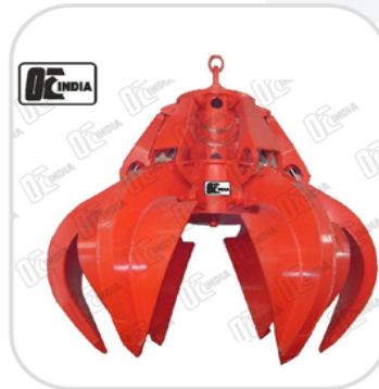
Hydraulic Peel Grab Bucket