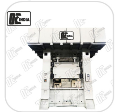
Heavy Duty Hydraulic Drawing Press Machine