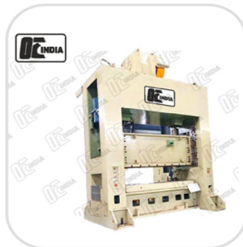
Heavy Duty Hydraulic H Frame Press Machine