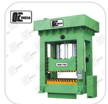
Heavy Duty Hydraulic Punching Press Machine