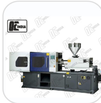
Horizontal Plastic Injection Moulding Machine