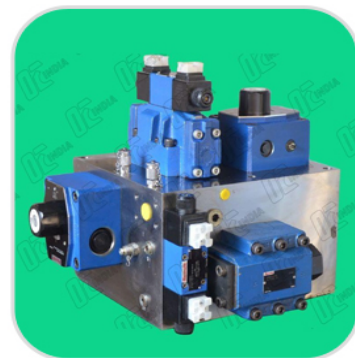
Skirt Manifold Control Block