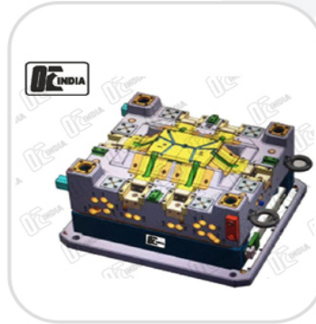
Rubber Moulding Die