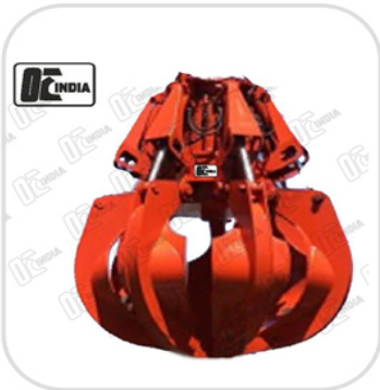
Hydraulic Finger Grab Bucket