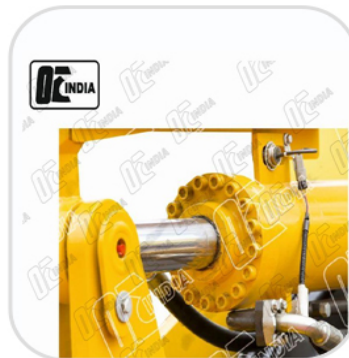
Mobile Equipment Hydraulic Cylinders