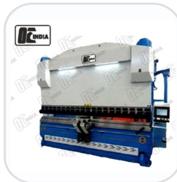
Heavy Duty Hydraulic Press Brake Machine