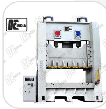
Hydraulic Stamping Press Machine