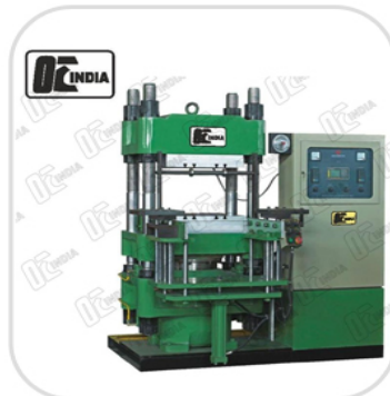
Rubber Moulding Machine