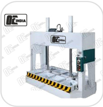
Hydraulic Plywood Cold Press Machine