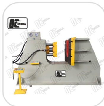
Horizontal Hydraulic Press Machine