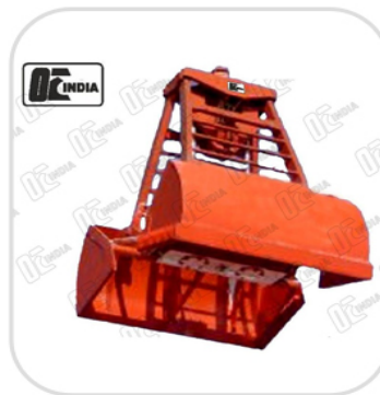
Heavy Duty Hydraulic Side Flap Grab Bucket