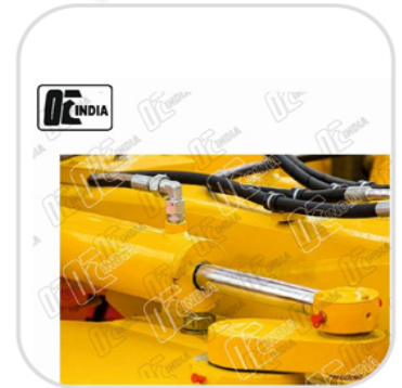
Heavy Duty Hydraulic Cylinder