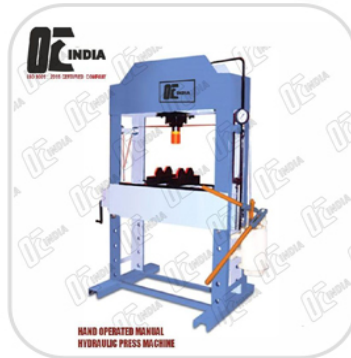
Hand Operated Hydraulic Press Machine