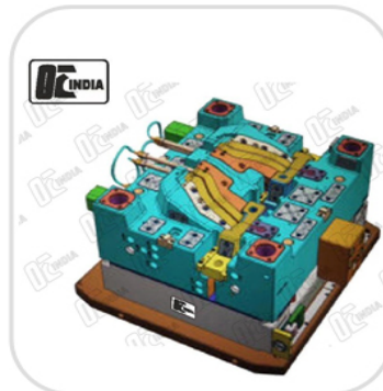
Bakelite Moulding Die