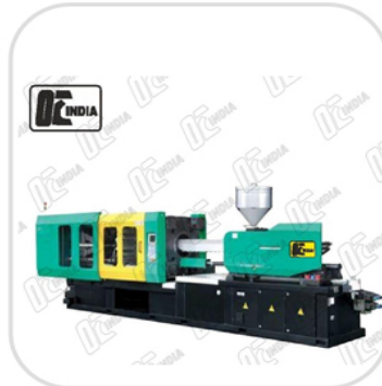
Automatic Plastic Injection Moulding Machine