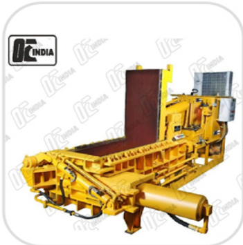
Triple Action Metal Scrap Bailing Machine