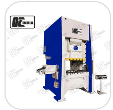
Hydraulic Trimming Press Machine