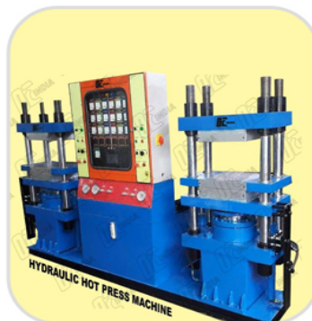
Hydraulic Hot Press Machine