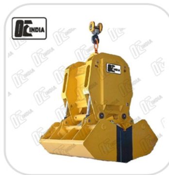
Heavy Duty Hydraulic Material Handling Grab Bucket