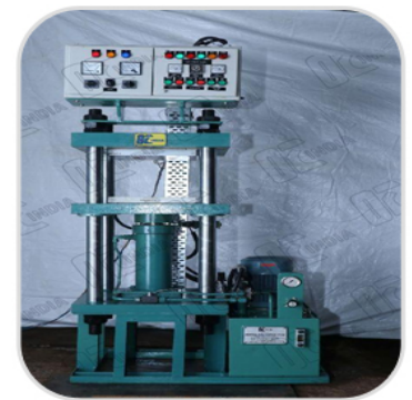
Bakelite Rubber Moulding Hydraulic Press