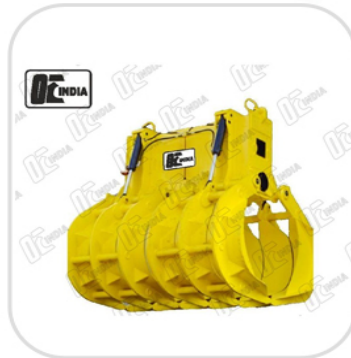
Hydraulic Opening Grab Bucket