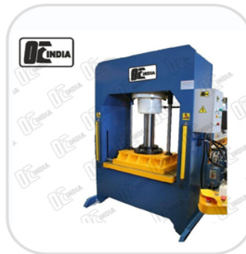
Robust Hydraulic Press Machine