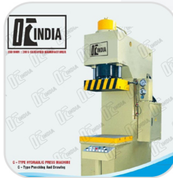
Heavy Duty C Type Hydraulic Press Machine