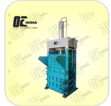
Pet Bottle Scrap Baling Machine