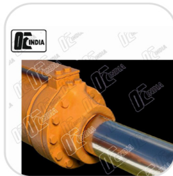
Linear Actuator Hydraulic Cylinders