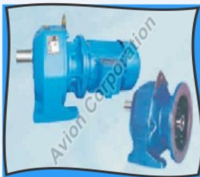
A Series Helical Gear Motor