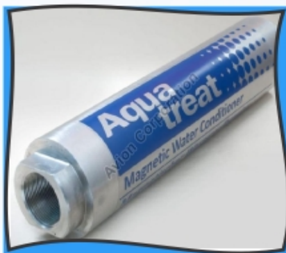
Aquatreat Magnetic Water Conditioner