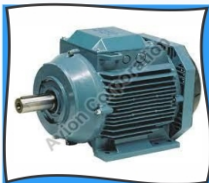
ABB Induction Motor