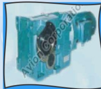
K Series Right Angle Bevel Worm Geared Motor.