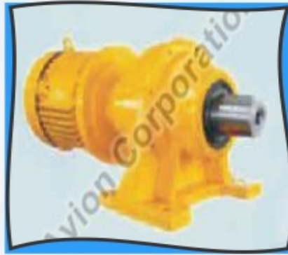
Planetary Gear Motor