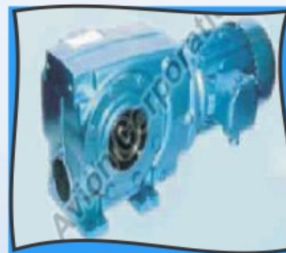
C Series Right Angle Helical Worm Geared Motor