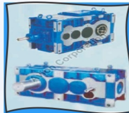
EP Series Bevel Helical Gearbox