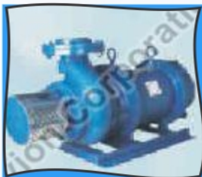
Openwell Submersible Pump