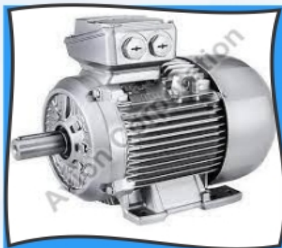
Siemens Induction Motors