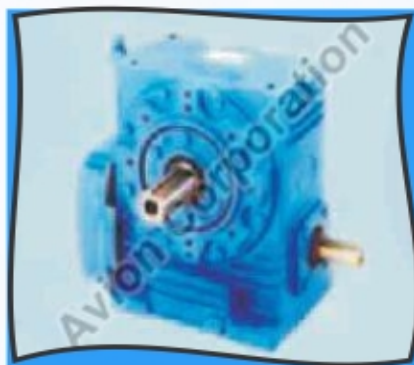
NU Series Worm Gearbox