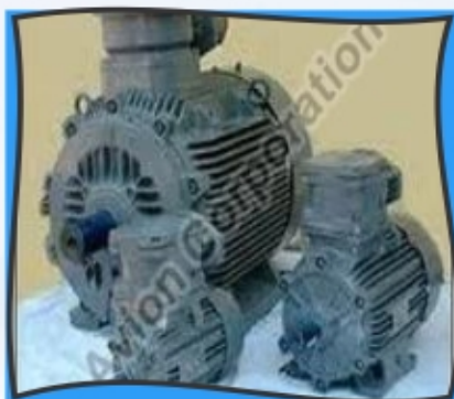
Bharat Bijlee Electric Motor