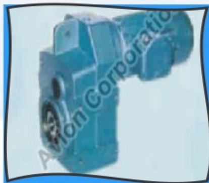
F Series In line Shaft Mounted Geared Motor