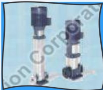
Multi Stage Pump