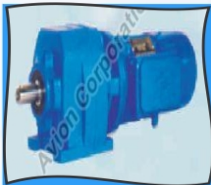
M Series Helical Inline Geared Motor