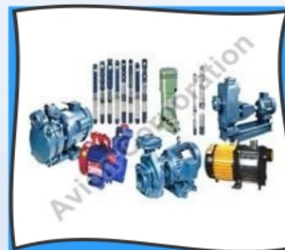
C.G. Power Pumps