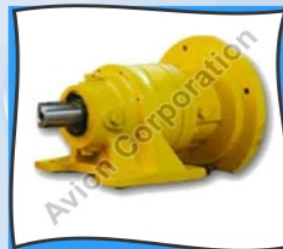
Becon Planetary Gearbox