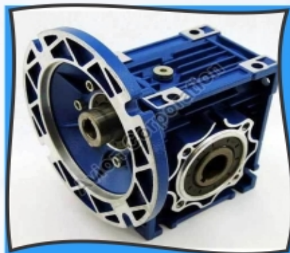
Emrv Worm Gear Box