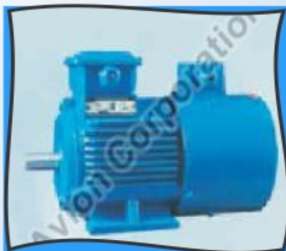
Crane Duty Motor