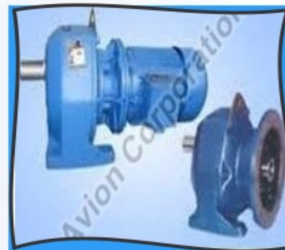
Power Build Helical Gear Motor