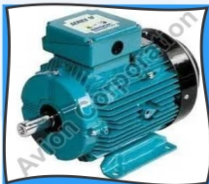
C.G. Induction Motor