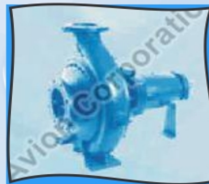
End Suction Pump