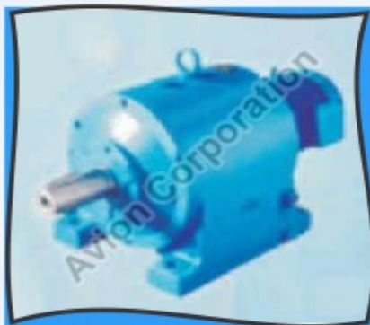
P Series Helical Inline Gear Motor