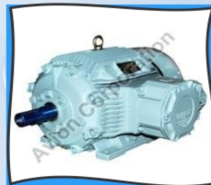
Flame Proof Motors