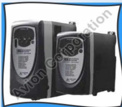
Variable Frequency Drive