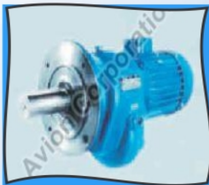
Flange Mounted Helical Gear Motor