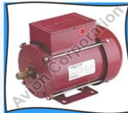
Single Phase Motor