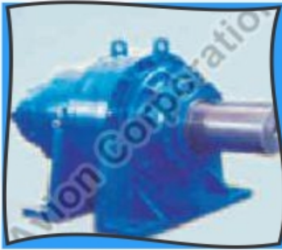
Foot Mounted Planetary Gearbox