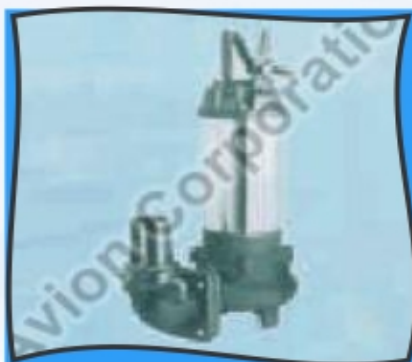
Sewage Submersible Pump