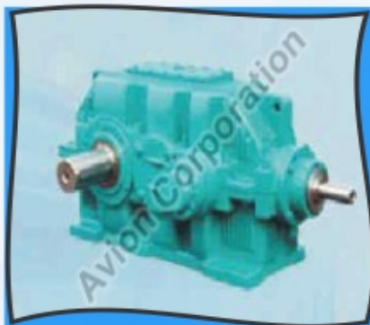
EON Series Bevel Helical Gearbox