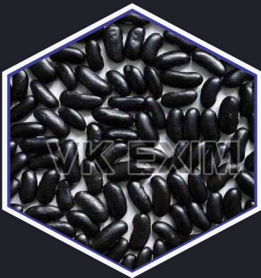
Black Kidney Beans