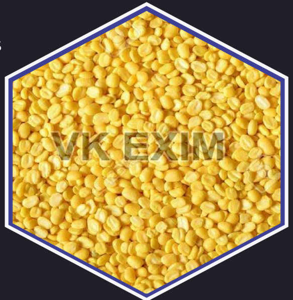
Yellow Moong Dal