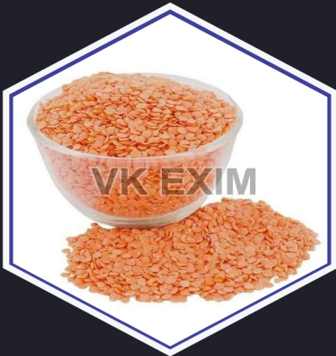
Dried Masoor Dal