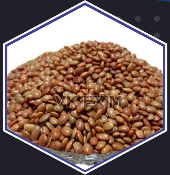
Horse Gram Dal