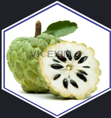
Fresh Custard Apple