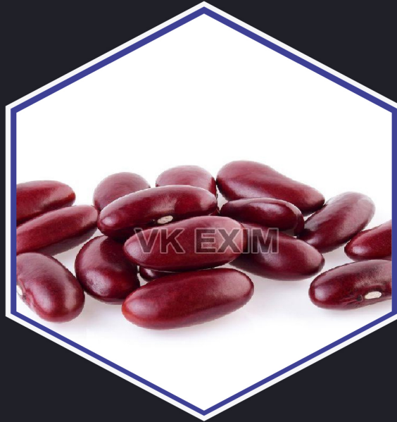
Red Kidney Beans