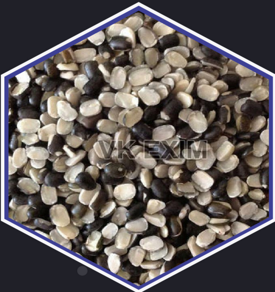
Split Urad Dal