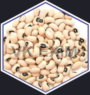
Black Eyed Beans