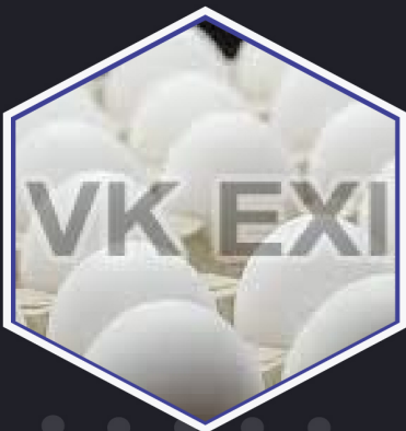
Fresh White Eggs