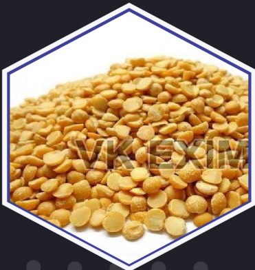
Dried Toor Dal