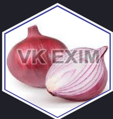
Fresh Red Onion