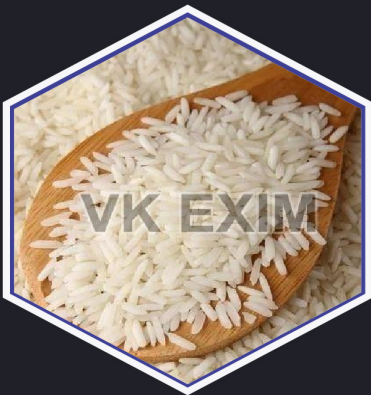
Non Basmati Rice