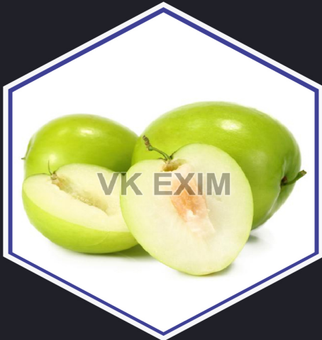
Fresh Apple Ber