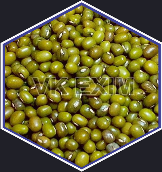
Green Moong Dal