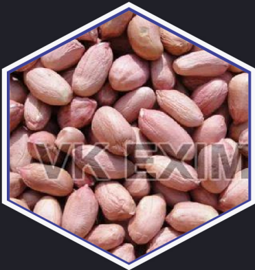
Raw Peanut Kernel