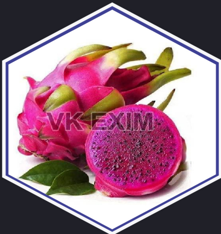
Fresh Dragon Fruit