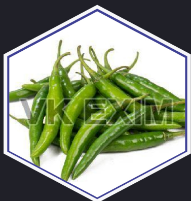
Fresh Green Chilli