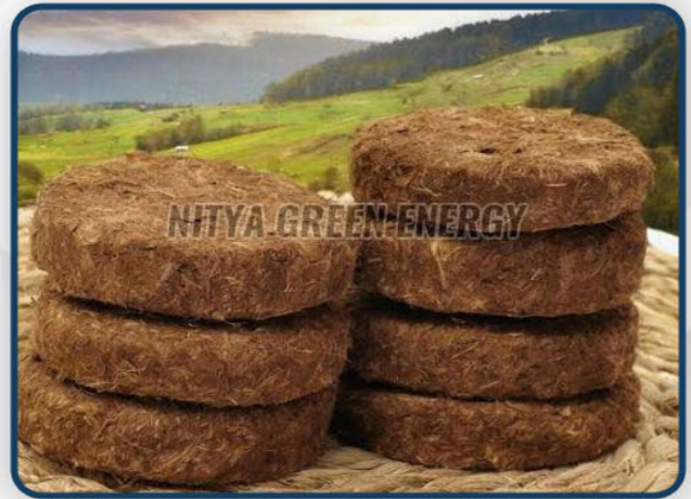
Cow Dung Cake

Business Type Exporter, Supplier, Trader