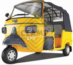
APE City Petrol