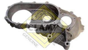
Steel APE Main Housing