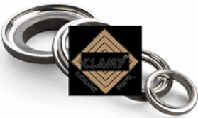
Steering Cone Set