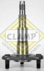
Rear Wheel Axle Set