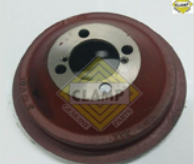
TVS KING BRAKE DRUM