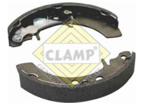
New Brake Shoe