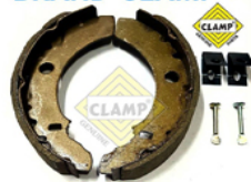
TVS KING BRAKE SHOE N/M