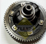
TVS KING DIFFERENTIAL ASSLY