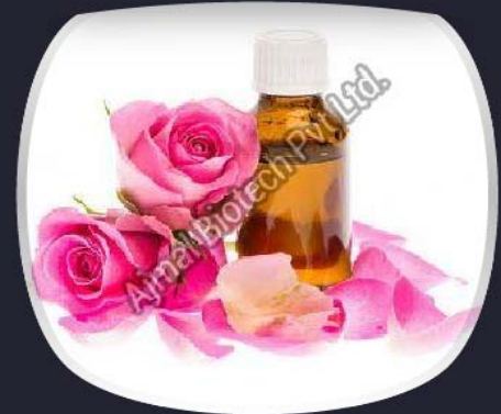
Rose Essential Oil