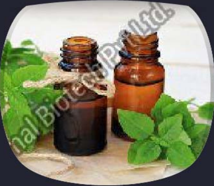
Basil Essential Oil