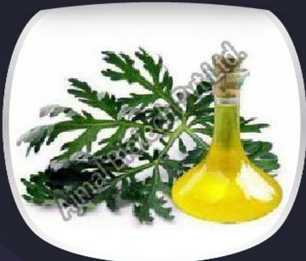
Davana Essential Oil