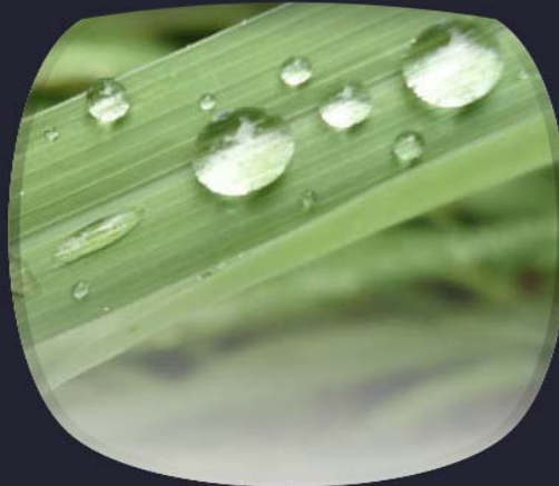
Citronellal Ex Citriodora