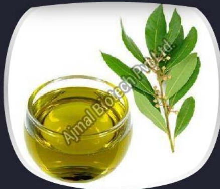
Sugandh Mantri Essential Oil