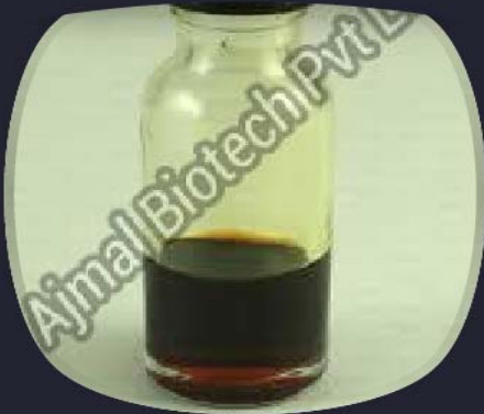
Jasmine Sambac Absolute