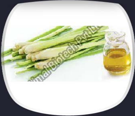
Lemongrass Essential Oil