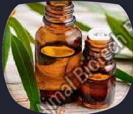
Eucalyptus Globulus Essential Oil