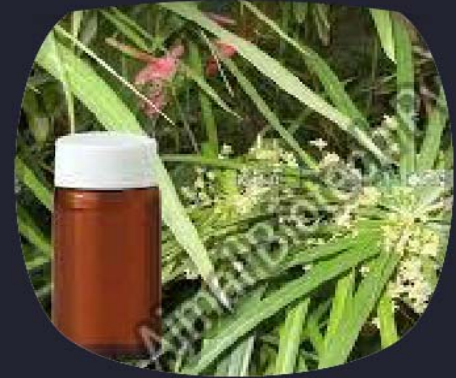
Cypriol Essential Oil