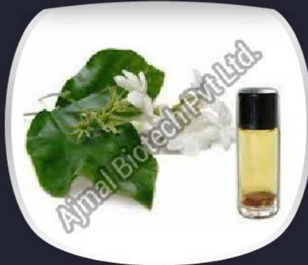
Jasmine Grandiflorum Absolute