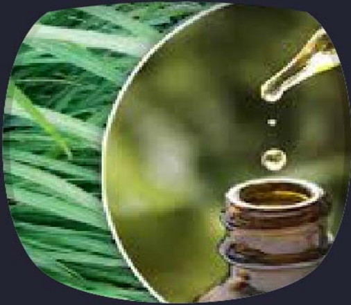
Geraniol Ex Citronella