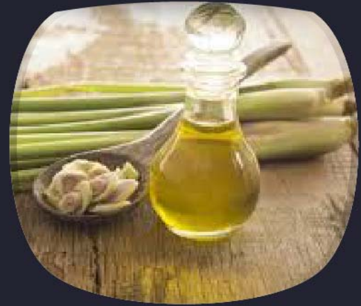
Citral Ex Lemongrass