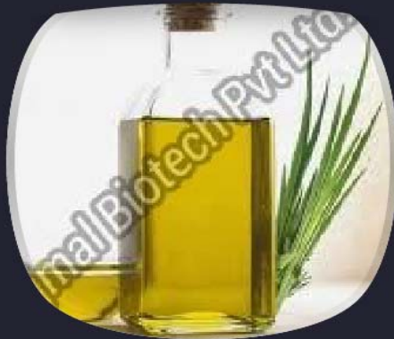
Palmarosa Essential Oil