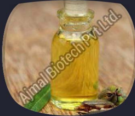
Citronella Essential Oil