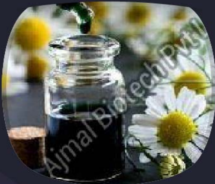
Chamomile Essential Oil