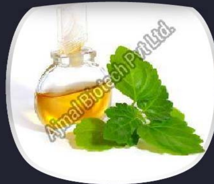
Patchouli Essential Oil