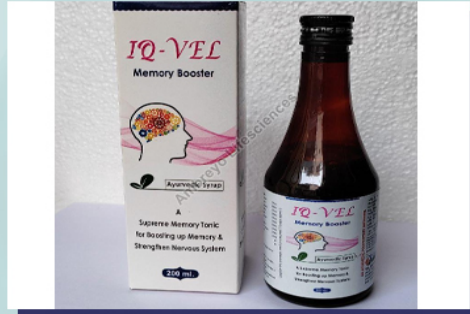
IQ-VEL Memory Booster Syrup