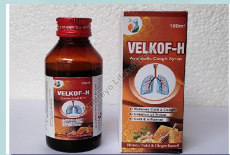
Velkof-H Ayurvedic Cough Syrup