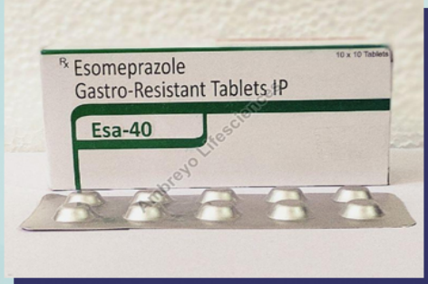
ESA 40mg Tablets