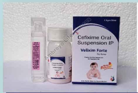
Glampure Ayurvedic Syrup