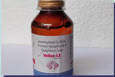
Veltus-LX Cough Syrup