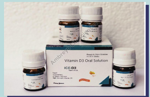
ICE- D3 Nano Shot