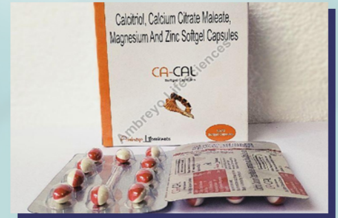
CA-CAL Softgel Capsules