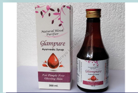
Glampure Ayurvedic Syrup