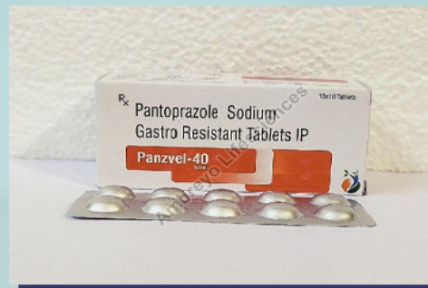
Panzvel 40mg Tablets