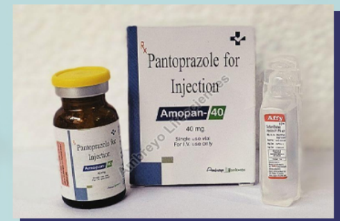
Amporan 40mg Injection