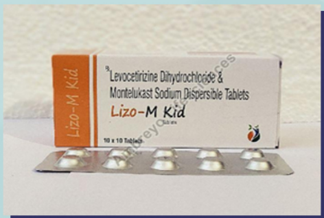
Lizo-M Kid Tablets