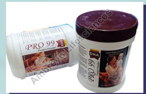
Pro-99 Chocolate Flavour Protein Powder