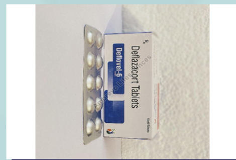
Deflovel 6mg Tablets