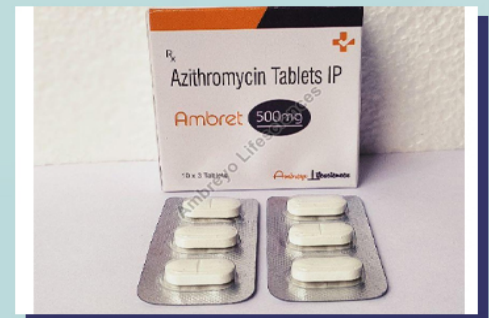
Ambret 500mg Tablets