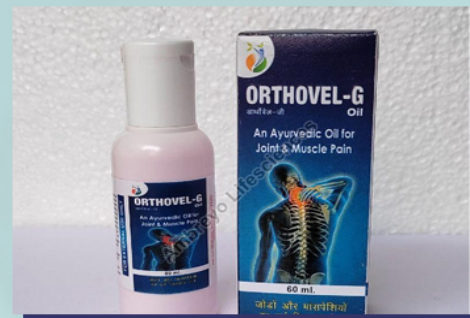
Orthovel-G Ayurvedic Pain Relief Oil