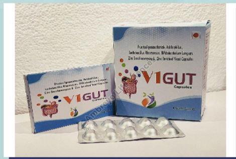
V1 Gut Capsules