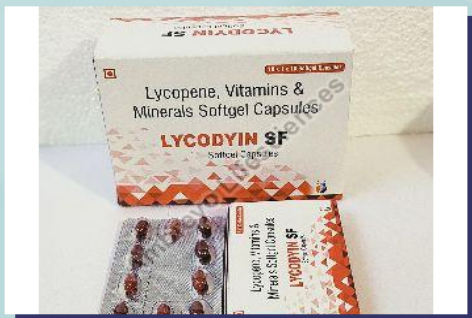
Lycodyin-SF Softgel Capsules