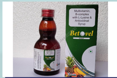
Betovel 200ml Syrup