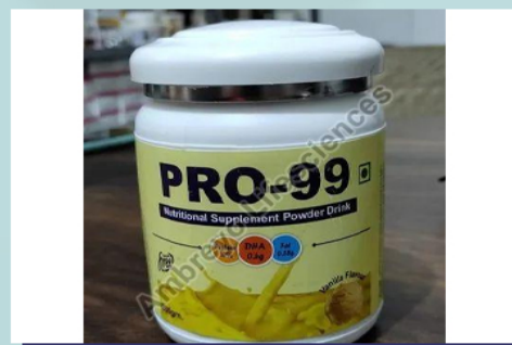
Pro-99 Vanilla Flavour Protein Powder