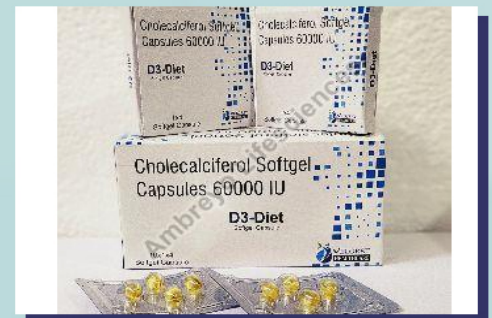
D3-Diet Softgel Capsules