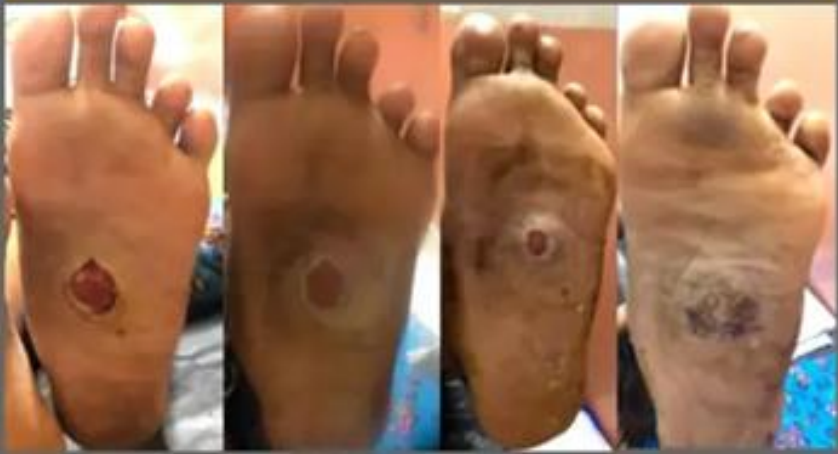
Midfoot Diabetic Foot Ulcer..