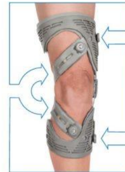
The 3-Point Leverage System