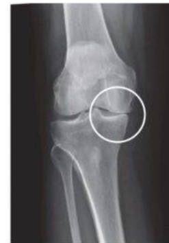
Knee OA without bracing (bone-on-bone contact)