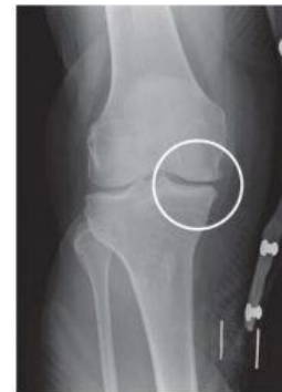
Knee OA with bracing (space created between bones)