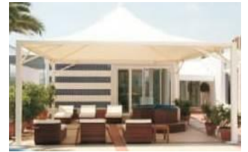
TENSILE STRUCTURE GAZEBO