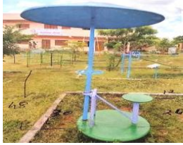
Newton's third Law