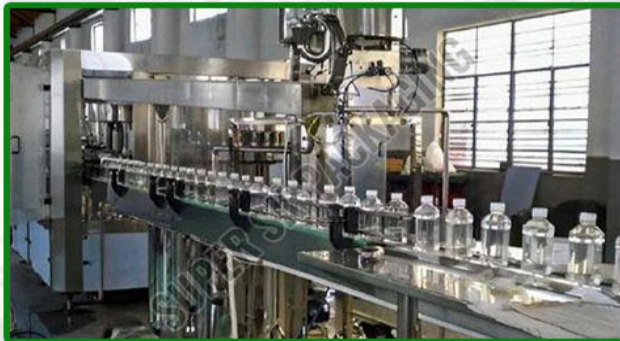
150 BPM water plant

Business Type : Manufacturer, Exporter, Supplier, Trader Material : Stainless Steel Driven Type : Electric Automatic Grade : Automatic Capacity : 240 BPM Country of Origin : India