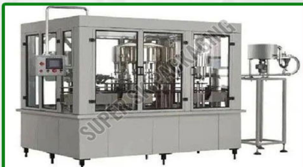
90 BPM water plant

Business Type : Manufacturer, Exporter, Supplier, Trader Material : Stainless Steel Driven Type : Electric Automatic Grade : Automatic Capacity : 120 BPM Country of Origin : India