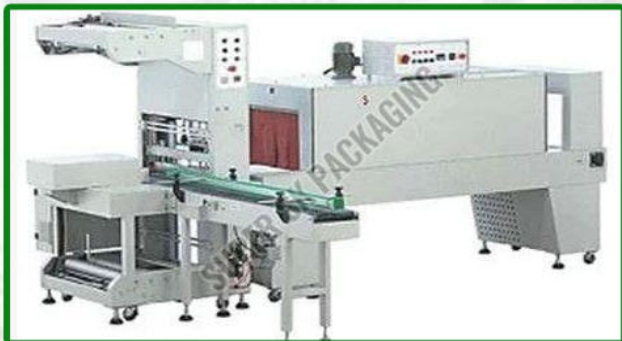
Automatic Shrink Wrapping Machine

Business Type : Manufacturer, Exporter, Supplier, Trader Finishing : Polished Raw Material : PET Driven Type : Electric Machine Body Material : Stainless Steel Automatic Grade : Semi Automatic