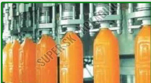
90 Bpm Fruit Juice Plant

Business Type : Manufacturer Material : Stainless Steel Finishing : Polished Driven Type : Electric Automatic Grade : Automatic Country of Origin : India