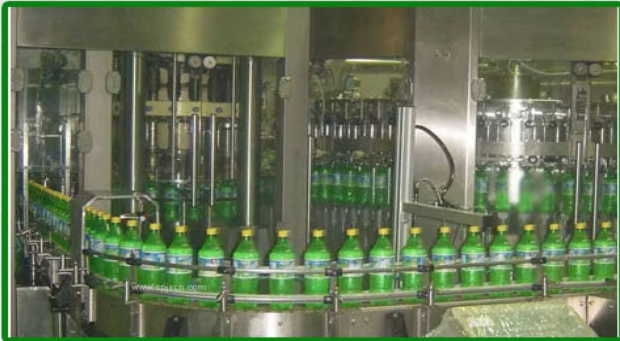
240 BPM CSD Plant

Business Type : Manufacturer, Exporter, Supplier, Trader Material : Stainless Steel Driven Type : Electric Automatic Grade : Automatic Capacity : 240 BPM Country of Origin : India