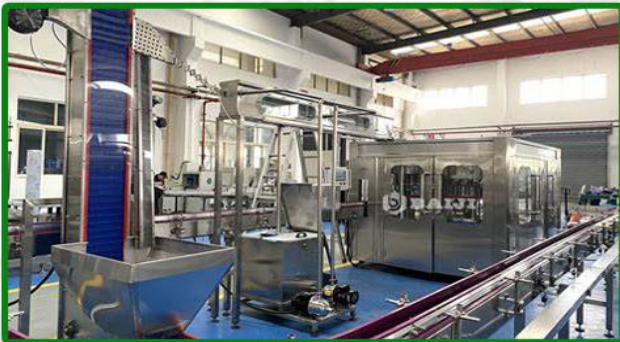
150 BPM CSD plant

Business Type : Manufacturer, Exporter, Supplier, Trader Material : Stainless Steel Driven Type : Electric Automatic Grade : Automatic Capacity : 240 BPM Country of Origin : India