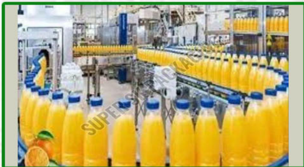
Fruit Juice Processing Plant

Business Type : Manufacturer Color : Silver Automatic Grade : Automatic Country of Origin : India Capacity : 200 BPH Shape : Cylindrical