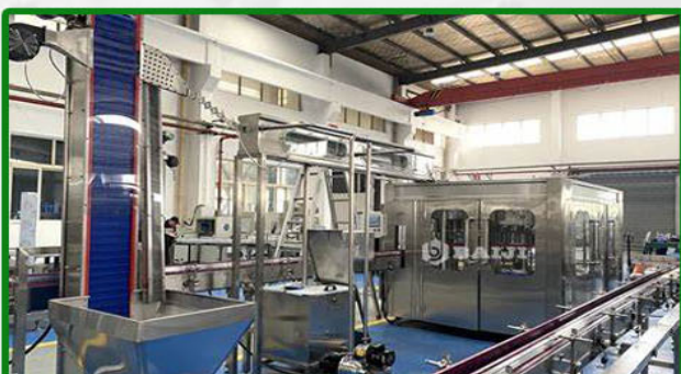
90 BPM CSD plant

Business Type : Manufacturer, Exporter, Supplier, Trader Material : Mild Steel Driven Type : Electric Color : Silver Automatic Grade : Automatic