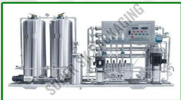
8000 and 6000 LPH Ro Plant

Business Type : Manufacturer, Exporter, Supplier, Trader Material : Stainless Steel Finishing : Polished Driven Type : Electric Location : Worldwide