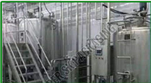
120 BPM CSD Plant

Business Type : Manufacturer, Exporter, Supplier, Trader Filling Material : Stainless Steel Automation Grade : Semi-Automatic Country of Origin : India Material Grade : SS 304