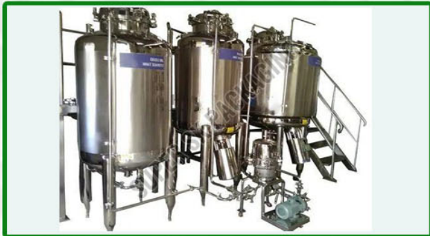
Stainless Steel Syrup Tank

Business Type : Manufacturer Color : Silver Automatic Grade : Automatic Country of Origin : India Capacity : 200 BPH Shape : Cylindrical