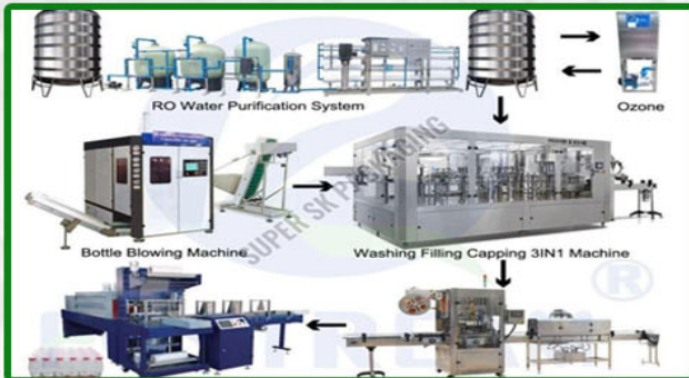
240 BPM water plant

Business Type : Manufacturer, Exporter, Supplier, Trader Material : Stainless Steel Driven Type : Electric Automatic Grade : Automatic Capacity : 240 BPM Country of Origin : India