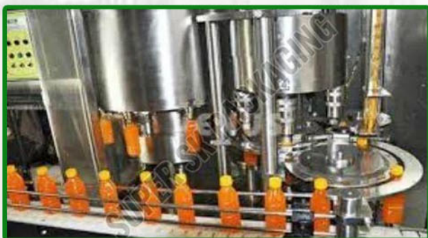
150 Bpm Fruit Juice Plant

Business Type : Manufacturer, Exporter, Supplier, Trader Filling Material : Fruit Juice Automation Grade : Semi-Automatic Country of Origin : India Production Capacity : 120 Bottle/min Material Grade : SS 304