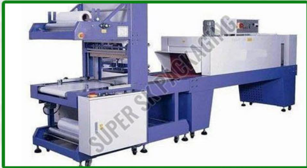
Semi automatic shrink wrapping machine

Business Type : Manufacturer, Exporter, Supplier, Trader Finishing : Polished Raw Material : PET Driven Type : Electric Machine Body Material : Stainless Steel Automatic Grade : Semi Automatic