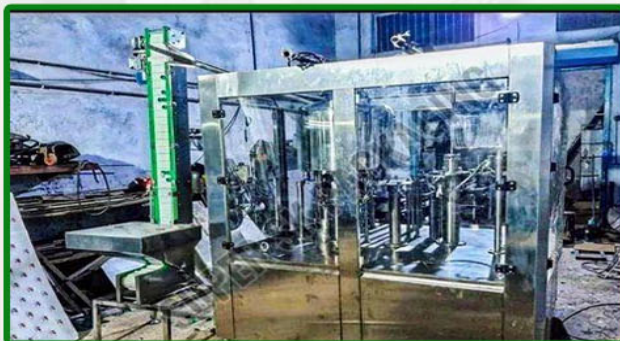
120 BPM water plant

Business Type : Manufacturer, Exporter, Supplier, Trader Material : Stainless Steel Driven Type : Electric Automatic Grade : Automatic Capacity : 150 BPM Country of Origin : India