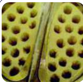
FBD / FBP / FBE