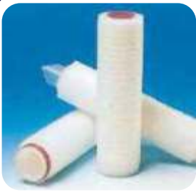
Cartridge / Candle Filters