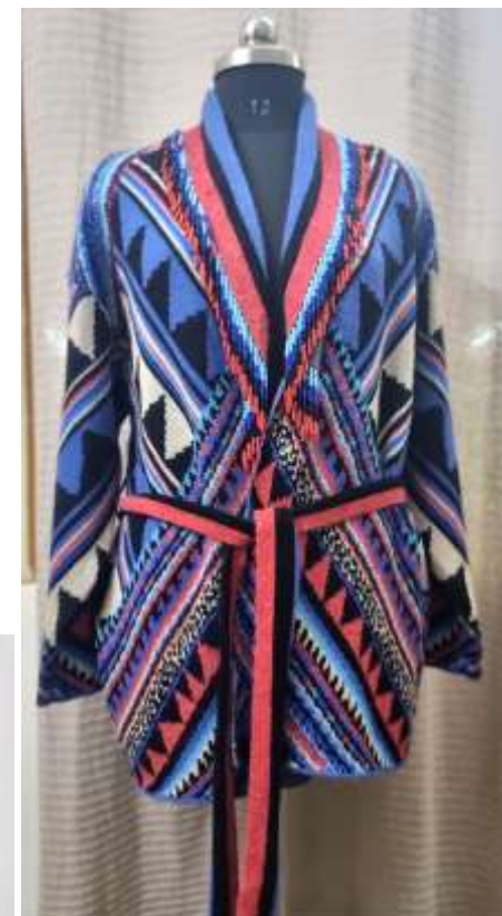
Style: Harrah Color: Burgundy/Charcoal