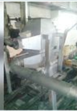
Recuperator for Al Holding Furnace-15 Ton