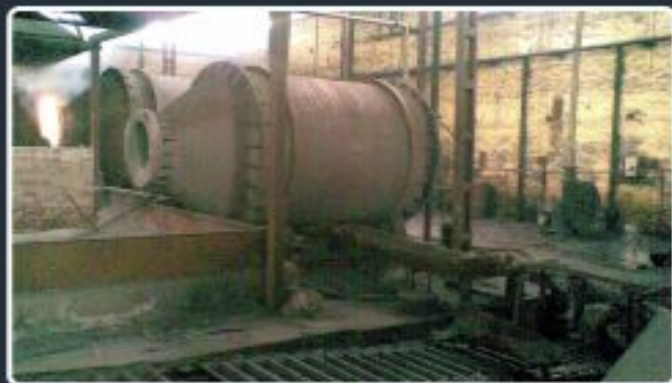
6 Ton Rotary furnace with conveyor