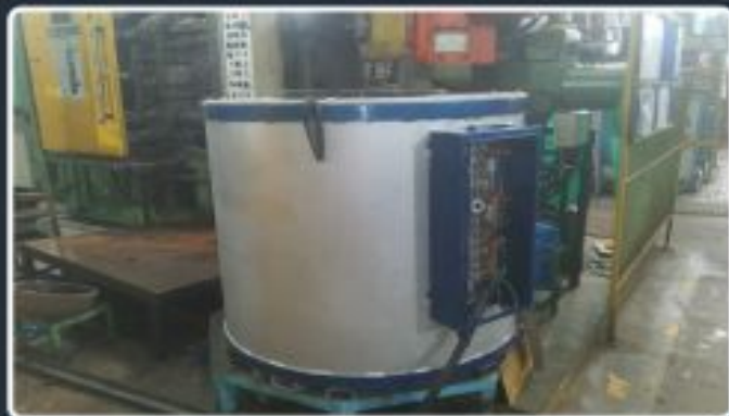
Electrically heated Al melting cum Holding-300 Kg