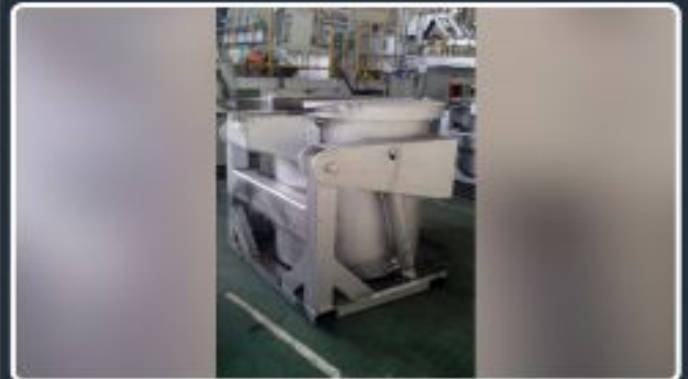
Tilting type transfer Ladle