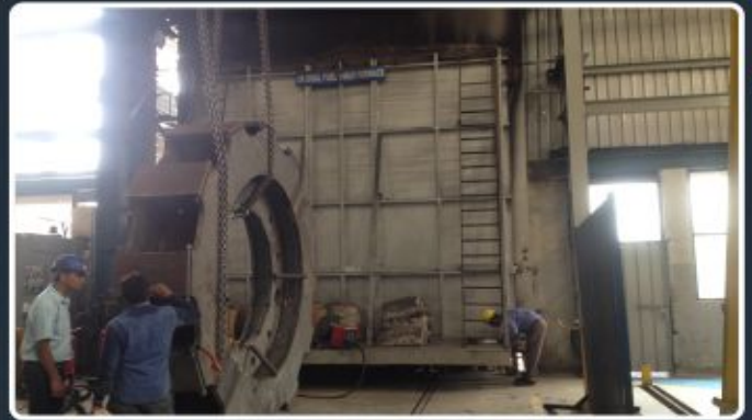
Heavy Struc. SR - Furnace with Trolley