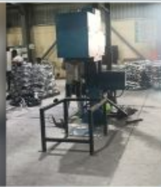
Dross Reclamation machine