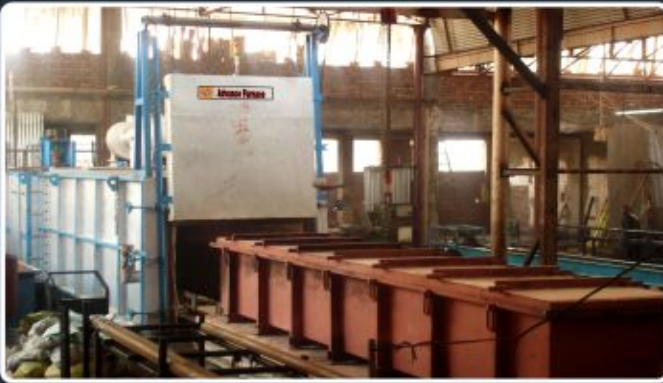
Heavy Structure Stress Relieving furnace