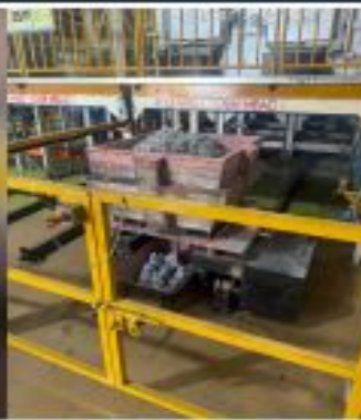
Dross reclamation machine-300 Kg