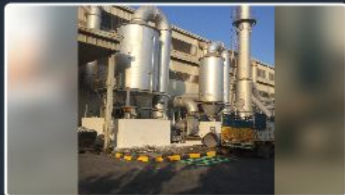
Air pollution control