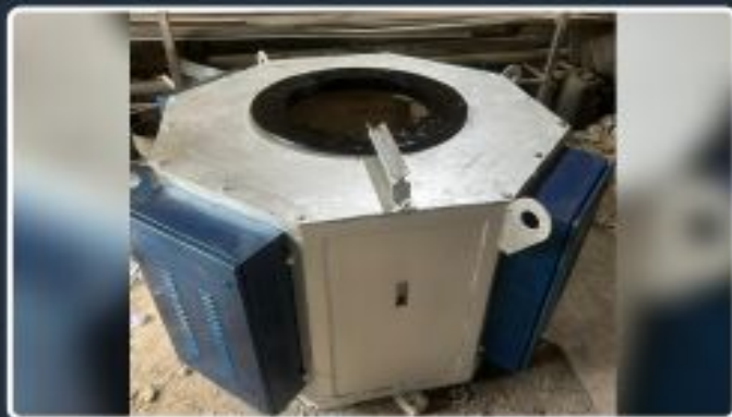
Al Melting furnace -250 Kg