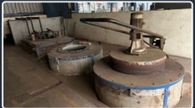
1500 Kg Dismantling & Relining