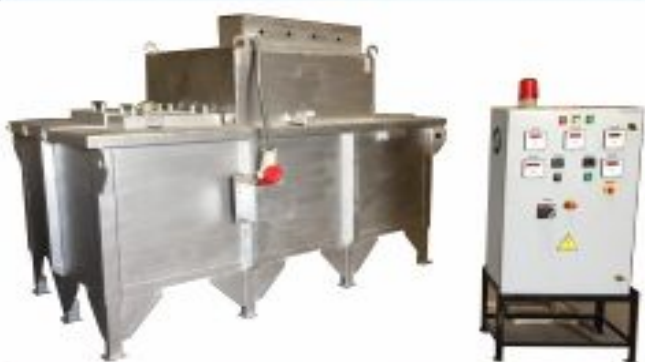
Crucibleless AL Holding furnace-500 kg