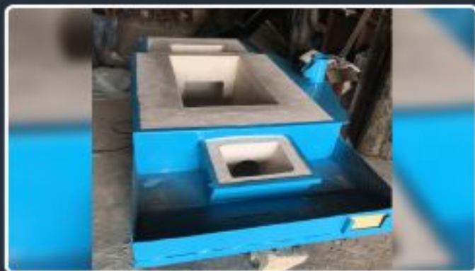
Crucibleless Al Holding furnace