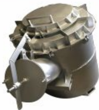
1000 Kg Road transport ladle