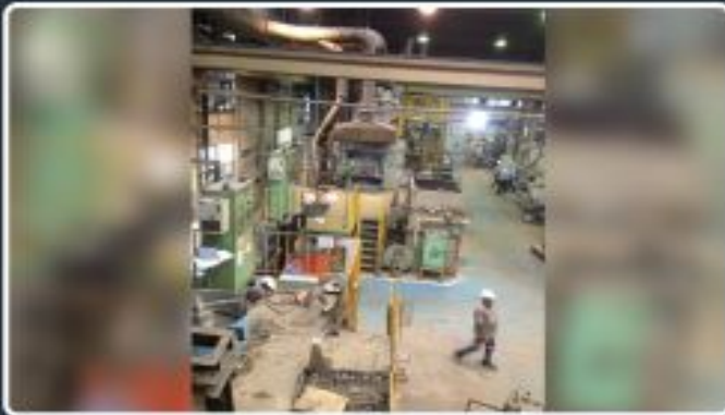
Tempering furnace-200 Kg