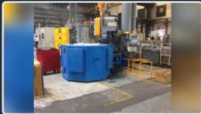
500 Kg Al Holding on line type