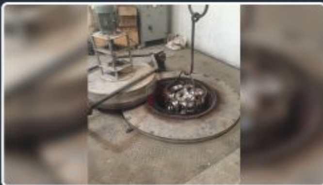
250 Kg Tower furnace Relining