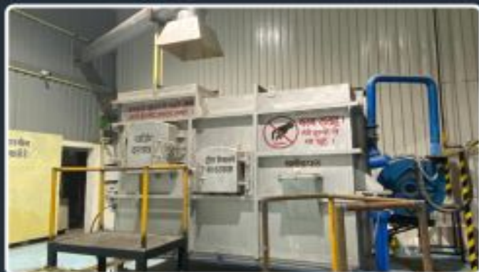
Sklener Furnace 3 Ton