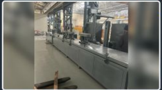
Preheating Oven for rail