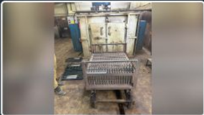
Electrically heated trolley type tempering furnace