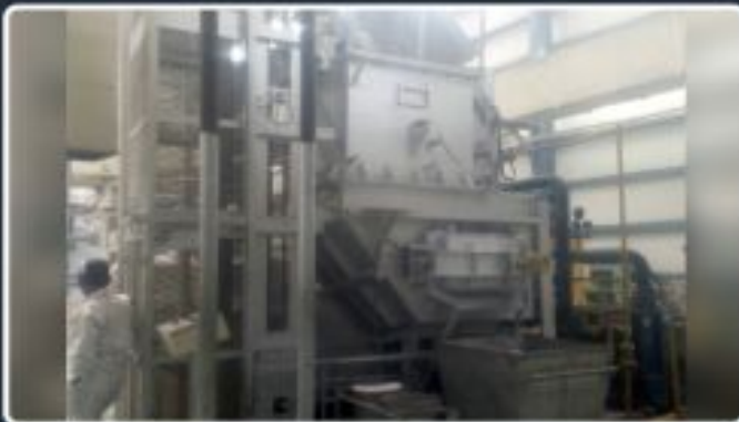
Tempering furnace-500 Kg.HEIC