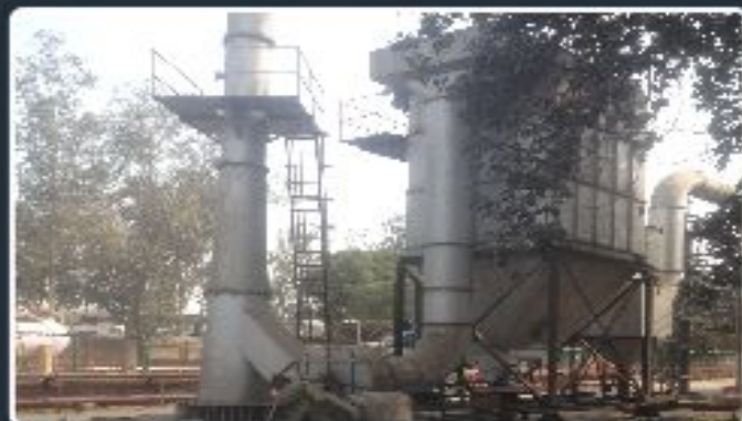
APCD with bag House Assembly