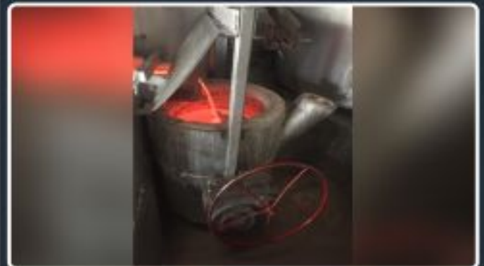
Al Transfer Ladle tilting type