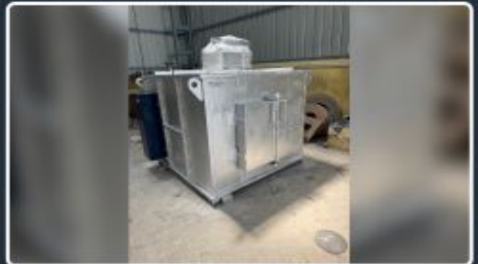
Trolley type tempering furnace