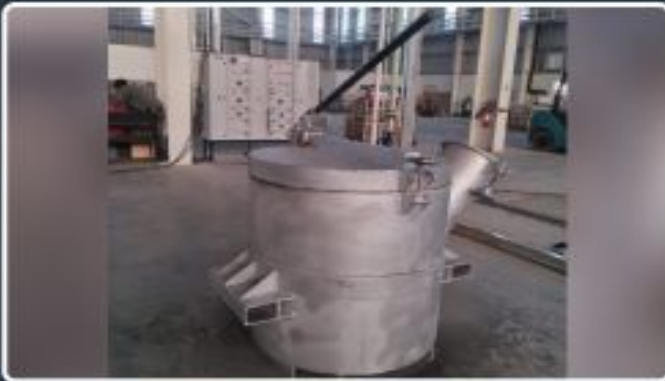
500 Kg Transfer Ladle