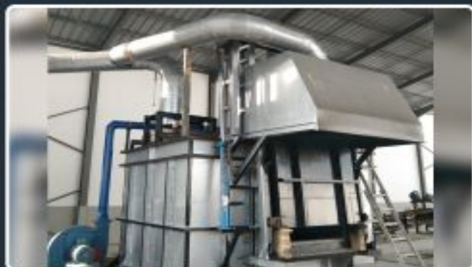
Al Melting furnace -8 Ton Capacity