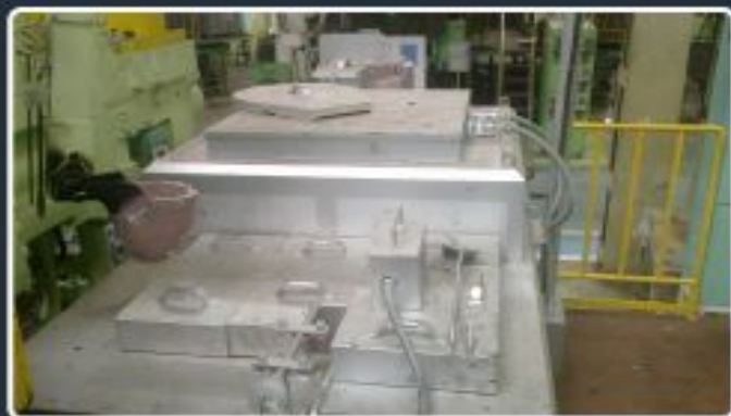
Crucibleless Al Holding furnace-1000 Kg