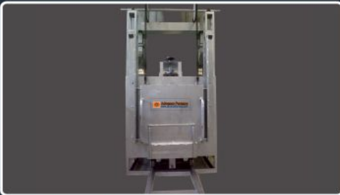
Electrically Die heating furnace boogie type furnace