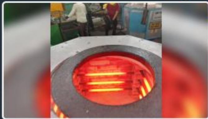
On line Al melting cum Holding furnace