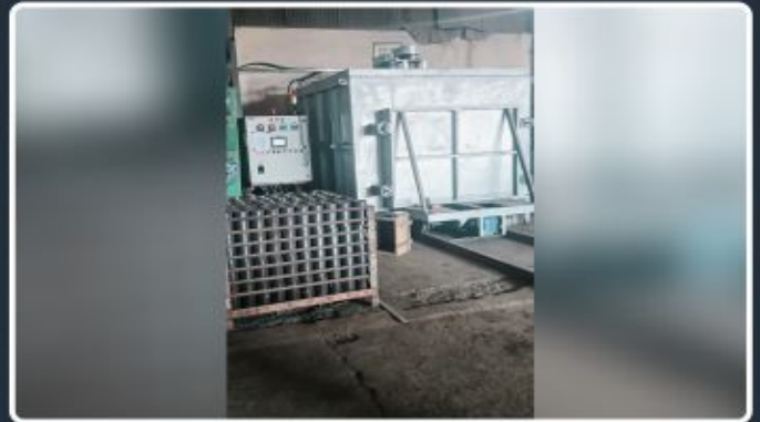
Electrically Heated Stress relieving furnace