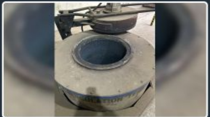
150 Kg Tower Dismantlaing Relining