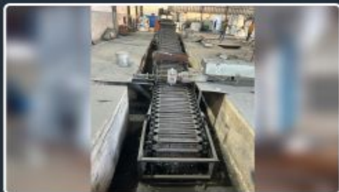
conveyor mould machine-220 mould