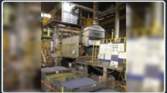
Tempering furnace-250 Kg