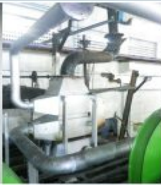
Recuperator for Al Melting furnace-20 Ton