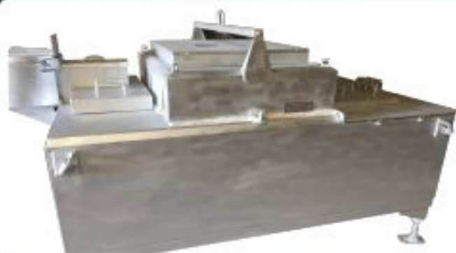
Crucibleless AL Holding furn. -700 Kg