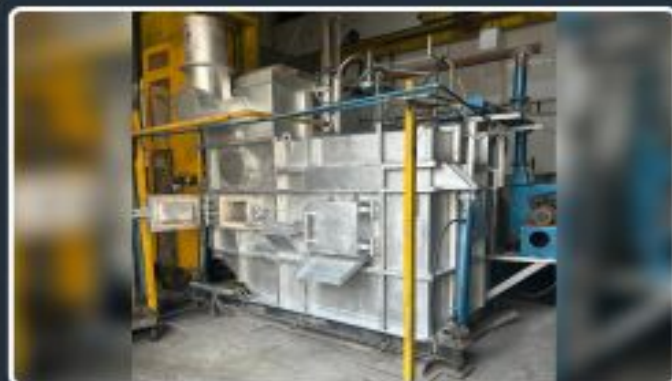
Al Melting-1 Ton with material charger