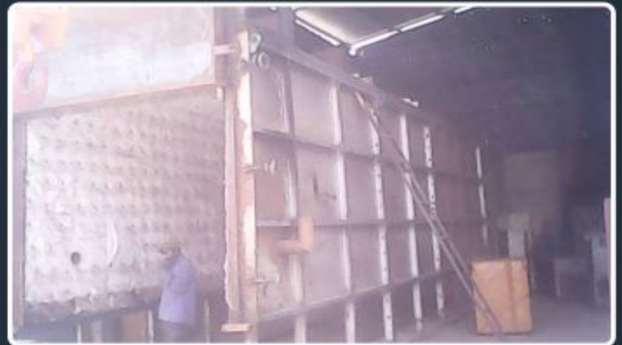
Heavy structure annealing furnace