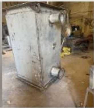
Recuperator SS-310 for Al melting furn. 45 Ton