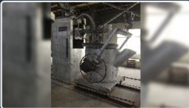
Hand Tilting Transfer Ladle-1 Ton