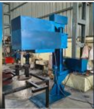
Dross machine 100 Kg