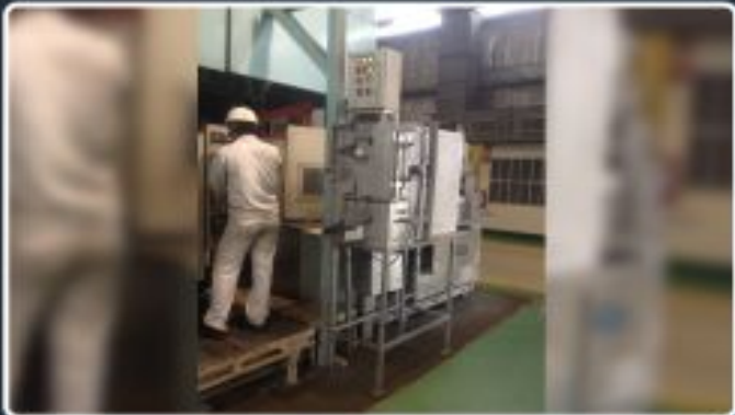
Sleeve Preheating oven