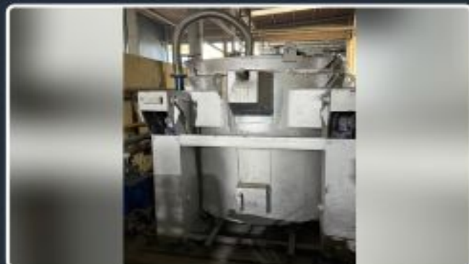
Al Hydraulic Tilting furnace-700 Kg