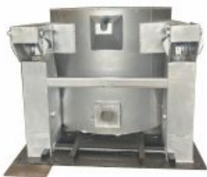
Al Hydraulic Tilting furnace-500 Kg