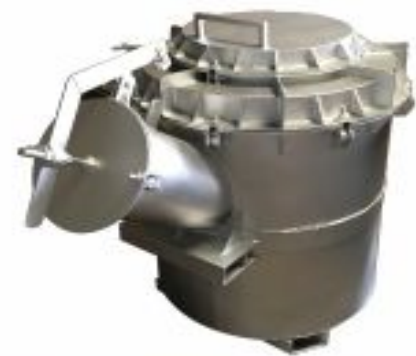
750 Kg Road Transport Ladle