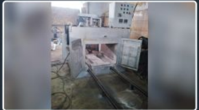
Trolley type preheating furnace