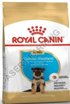
3 Kg Royal Canin German Shepherd Puppy Dog Food