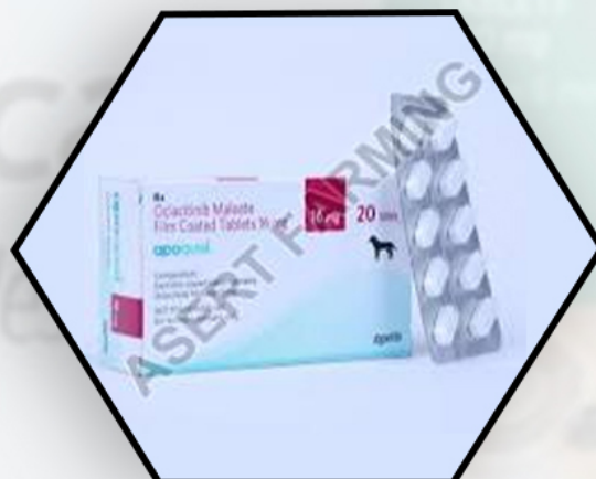
Apoquel 16 Mg Tablet