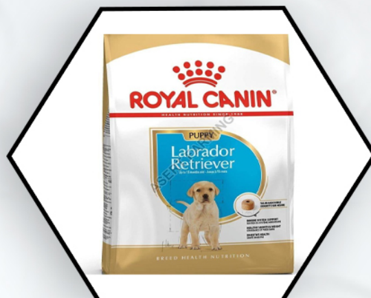
3 Kg Royal Canin Labrador Puppy Dog Food