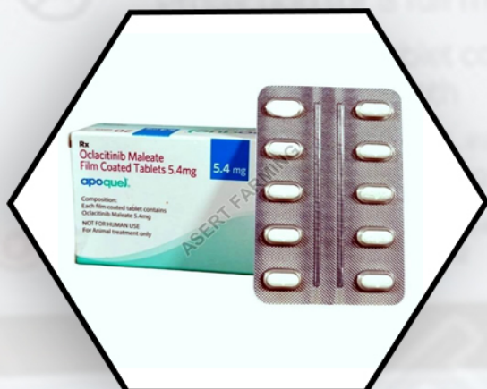
Apoquel 5.4 Mg Tablet