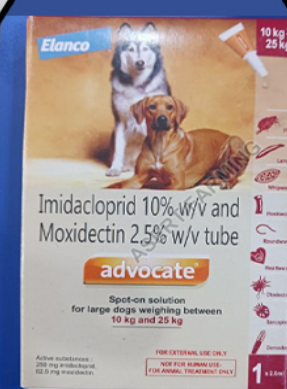
Liquid Imidacloprid And Moxidectin Solution