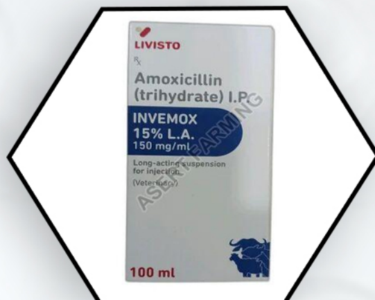
Amoxicillin Trihydrate Injection