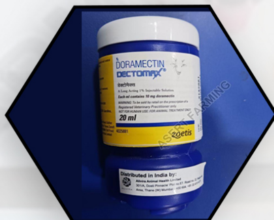
20ml Doramectin Injection