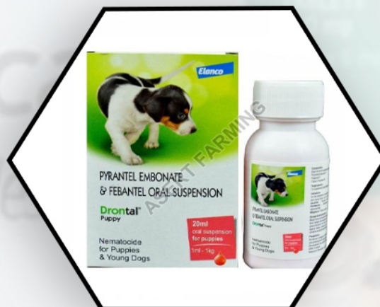
Pyrantel Pamoate and Febantel Oral Suspension