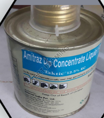
Liquid Amitraz Dip Concentrate