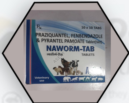
Praziquantel Pyrantel Pamoate & Fenbendazole Tablet