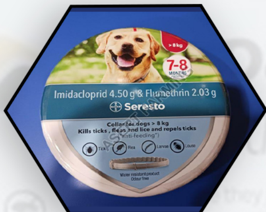
Seresto Tick Free Dog Collar