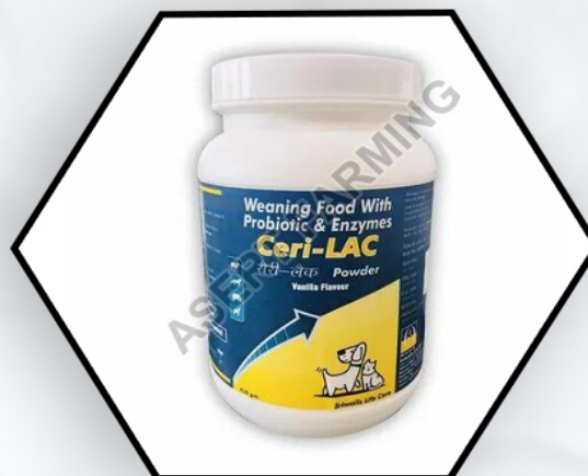
Ceri-LAC Powder For Pets