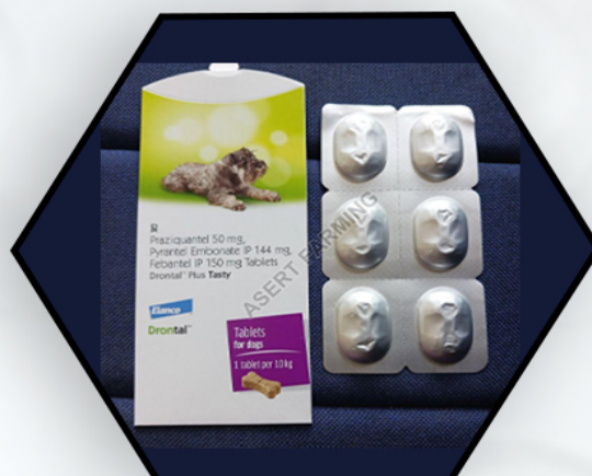
Praziquantel Pyrantel Embonate & Febantel Tablet