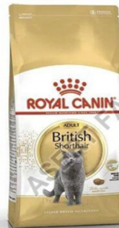
2 Kg Royal Canin British Short Hair Cat Food