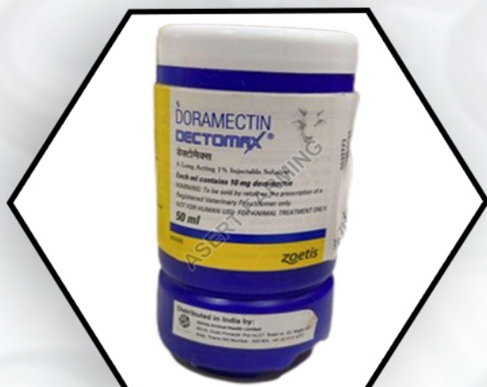
50ml Doramectin Injection