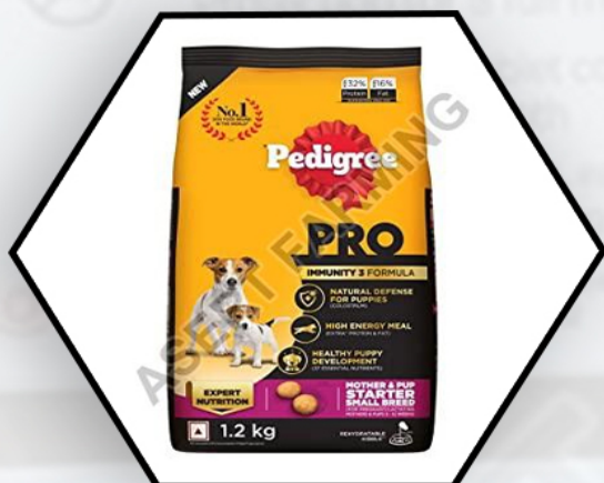
1.2 Kg Pedigree Starter Mother & Pup Dog Food