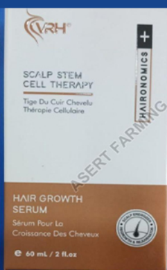
VRH Hair Growth Serum