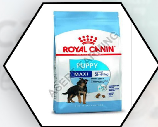
1 Kg Royal Canin Maxi Puppy Dog Food