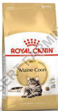
2 Kg Royal Canin Maine Coon Adult Cat Food