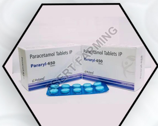
Paracetamol 650mg Tablet