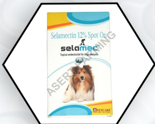
Selamectin 12% Spot On For Animals