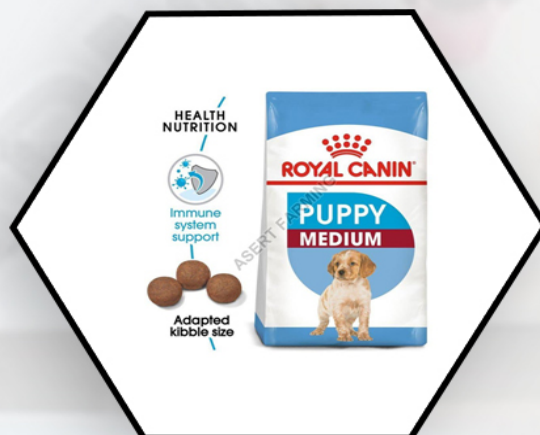
4 Kg Royal Canin Medium Puppy Dog Food