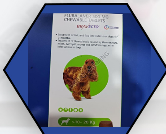
Bravecto 500 Mg Tablet