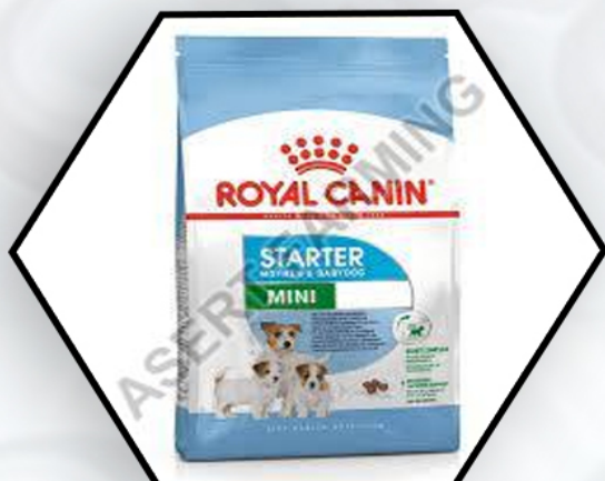
4 Kg Royal Canin Mini Starter Dog Food