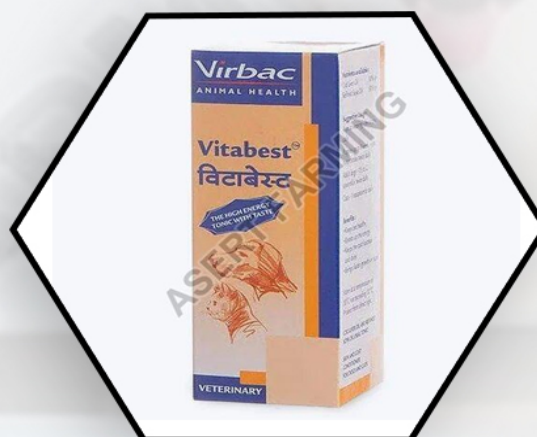
Virbac Vitabest Tonic