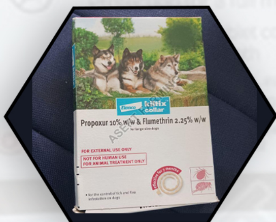
Kiltix Tick Free Dog Collar