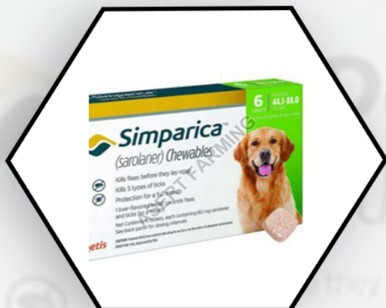
80mg Simparica Chewables Tablets