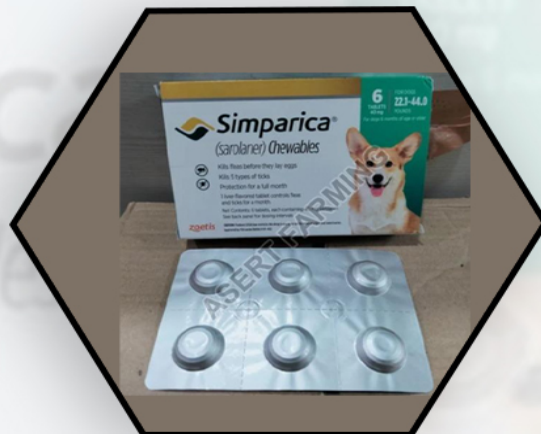
Simparica 40mg Chewables Tablets