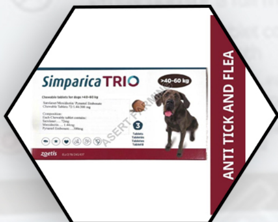
Simparica Trio Chewable Tablet