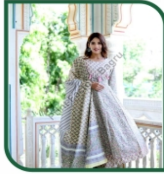
Hand Block Printed Anarkali Kurta Pant Set With Dupatta