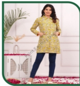
Ladies Hand Block Printed Long Jacket