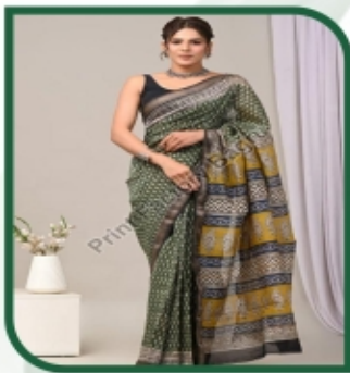
Maheshwari silk saree bagru hand block printed