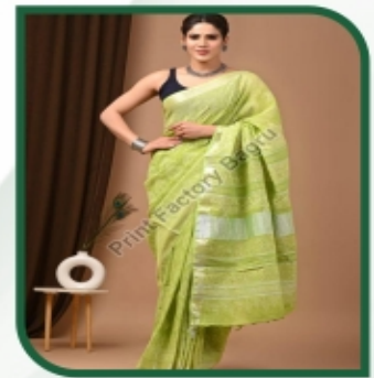
Linen cotton saree bagru hand block printed