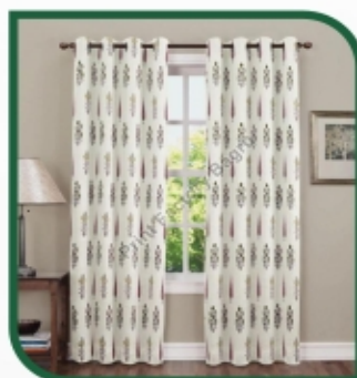
Hand Block Printed Cotton Curtain