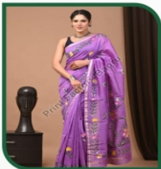
Hand Block Printed Chanderi Silk Saree