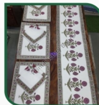
Hand Block Printed Table Runner Mat Set