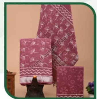
Bagru Hand Block Print Dress Material