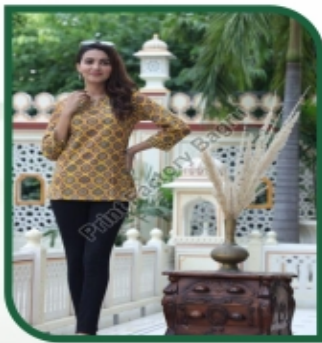
Ladies Hand Block Printed Cotton Top