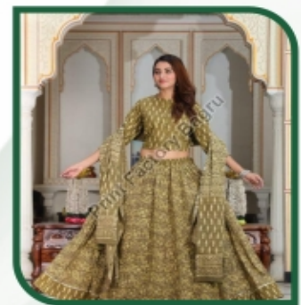
Gopi dress lehenga choli bagru hand block printed