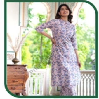
Hand Block Printed Cotton Kurta Palazzo Set