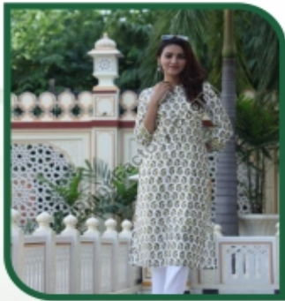
Hand Block Printed Cotton Kurti