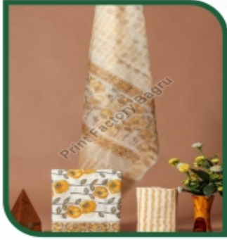
Hand Block Printed Organza Silk Dress Material