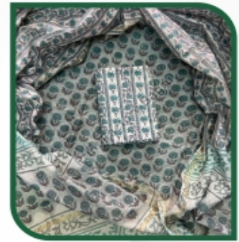
Chanderi silk dress material hand block printed