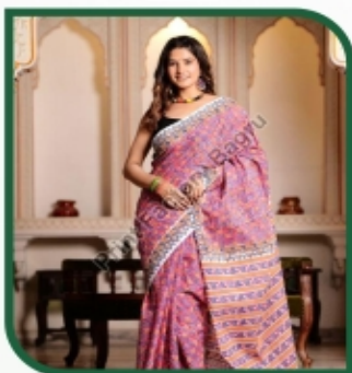
Mulmul cotton saree bagru handblock printed