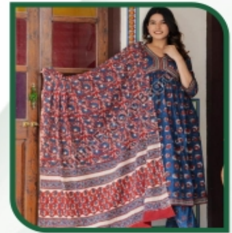
Hand Block Printed Naira Cut KurtaPant Set with Dupatta