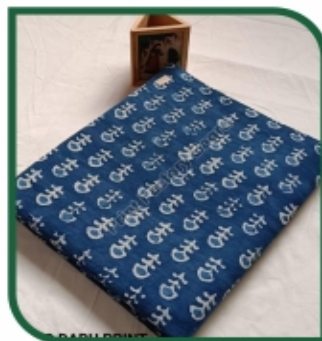
Indigo Dabu Hand Block Printed Fabric