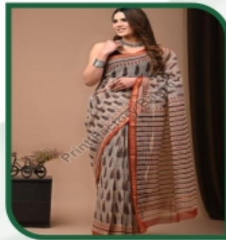
Bagru Hand Block Printed Kota Doria Saree