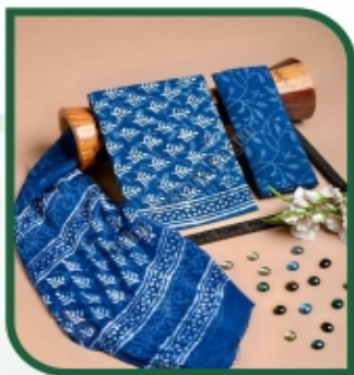
Chiffon dress material bagru hand block printed