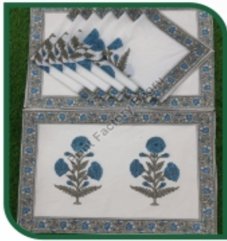
Mat Set Bagru hand block printed