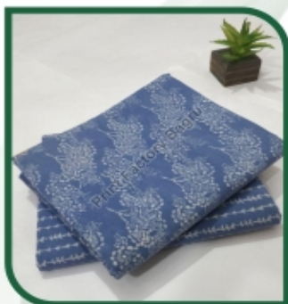
kantha fabric pure cotton bagru hand block printed dress material