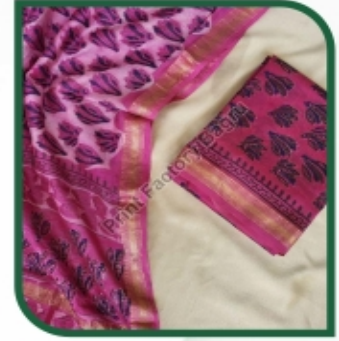
Printed Ajrakh Maheshwari Silk Dress Material