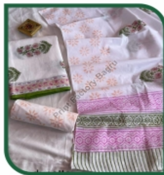
Cotton dress material bagru block printed