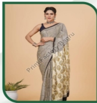
Modal silk saree bagru handblock printed