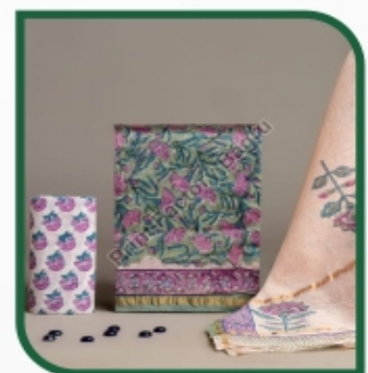
Hand Block Printed Chanderi Silk Dress Material