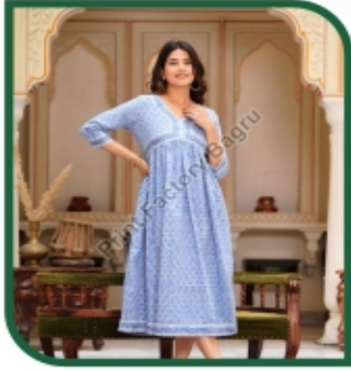
Floral Hand Block Printed Naira Cut Cotton Dress