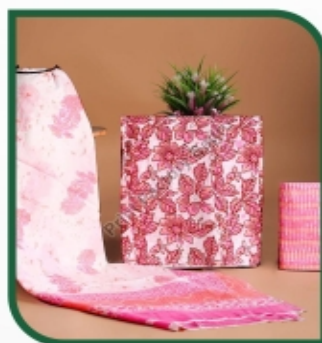
Cotton Suit Material with Mulmul Dupatta