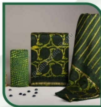
Ajrakh Printed Chanderi Silk Dress Material