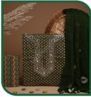
Jaipuri Gota Patti Suit Handcrafted