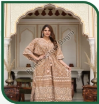
Hand Block Printed Cotton Long Kaftan