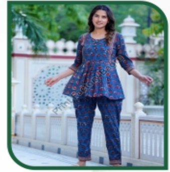
Ladies Cotton Hand Block Printed Co-Ord Set