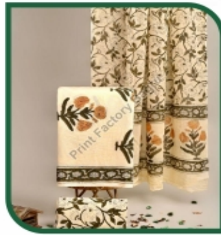
Block Printed Cotton Dress Material