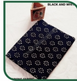
Cotton Hand Block Printed Running Fabric