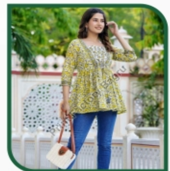
Cotton Hand Block Printed Top