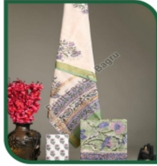
Maheshwari Silk Dress Material