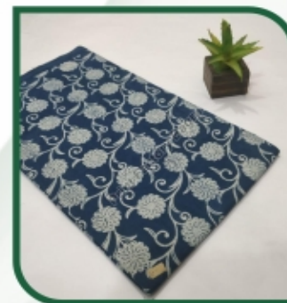
kalamkari hand block printed fabric