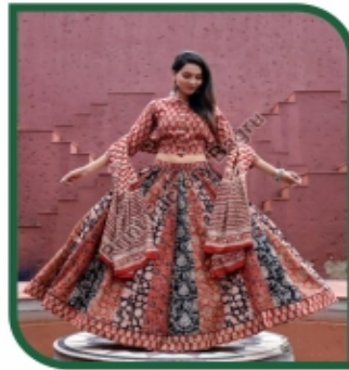
Hand Block Printed Cotton Lehenga Choli