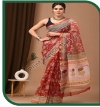
Kotadoria saree bagru hand block printed