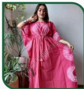
Printed Cotton Kaftans