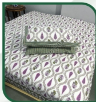
Bagru Hand Block Printed Bedsheet