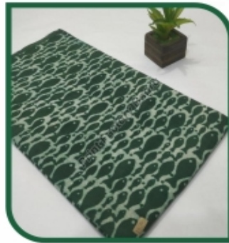
Bagru hand block printed cotton fabric