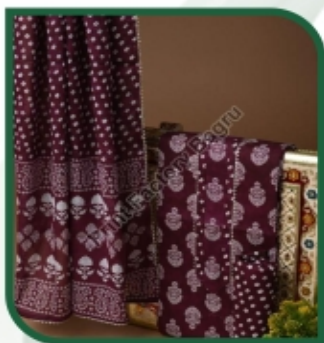
Gota patti suit block printed