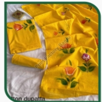
Hand painted bagru cotton dress material