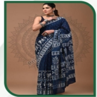
Bagru Hand Block Print Indigo Cotton Mulmul Saree