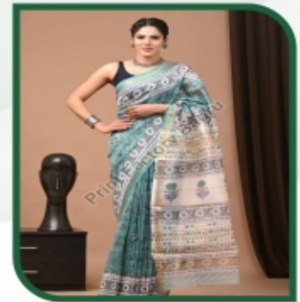
Bagru Hand Block Printed Maheshwari Silk Saree