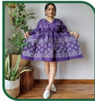
Hand Block Printed Short Kaftan