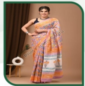
Mulmul cotton saree bagru hand block printed