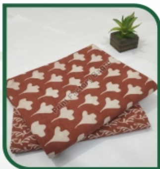
Hand Block Printed Cotton Fabric