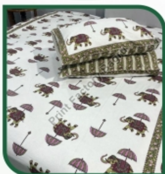
Cotton bedsheets hand block printed