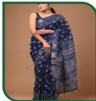
Hand Block Printed Linen Saree