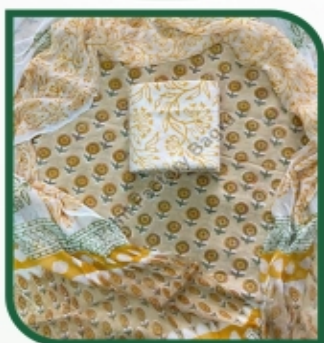
Cotton Dress Material With Chiffon Dupatta