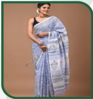
Bagru Hand Block Printed Cotton Mulmul Saree