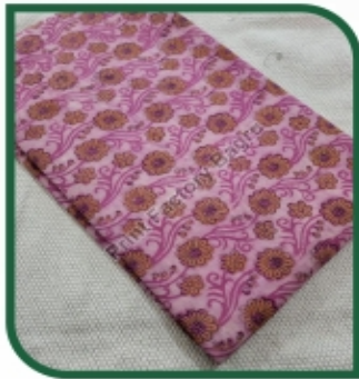
Ajrakh hand block printed cotton fabric