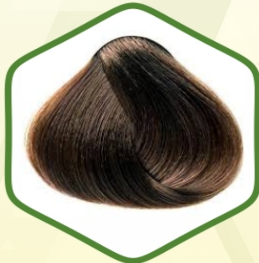
Dark Brown Henna