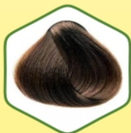
Dark Brown Henna