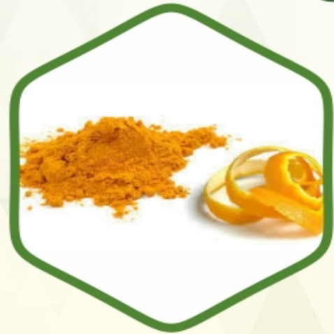
Orange Peel Powder