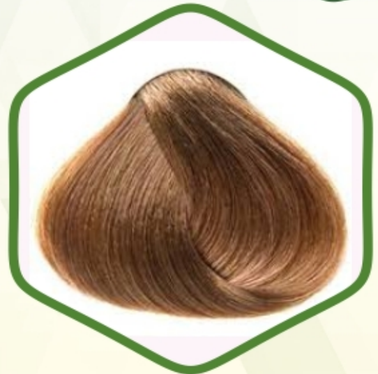
Light Brown Henna