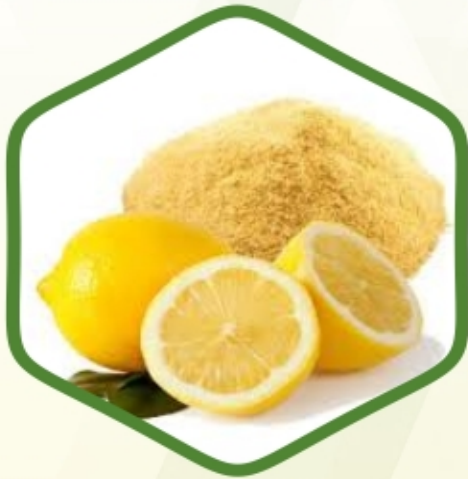
Lemon Peel Powder