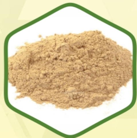
Multani Mitti Powder