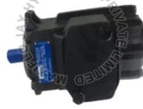
T6DCC Denison Hydraulic Vane Pump