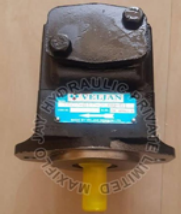
VELJAN T6CV-017 Hydraulic Pump