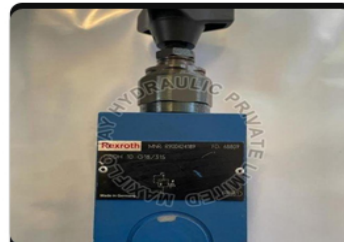
DBDH 10 Pressure Relief Valve