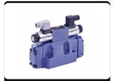
4WEH 16 Directional Control Valve