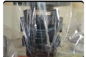
Parker JCB 3DX Hydraulic Pump