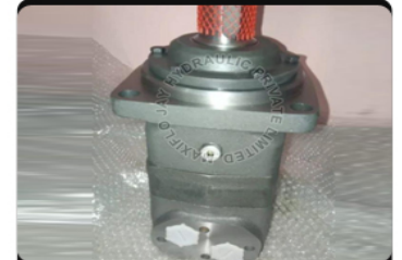
Danfoss Orbital Motor