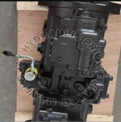
Volvo Hydraulic Pump