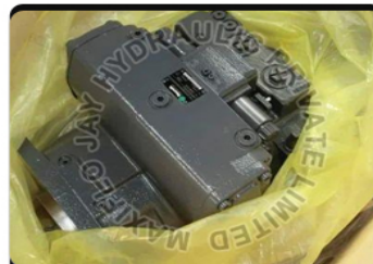
Rexroth A11VO Hydraulic Piston Pump