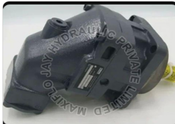
Parker F12 Hydraulic Pump