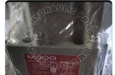
Moog Hydraulic Servo Valve