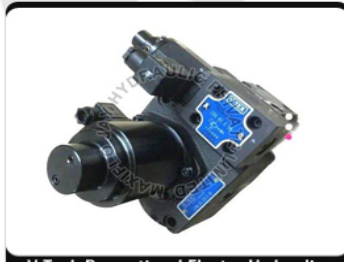
V Tech Proportional Electro Hydraulic Control 05 Valve