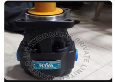
82CC Hyva Hydraulic Gear Pump