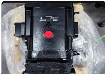
Parker Dension Hydraulic Pump