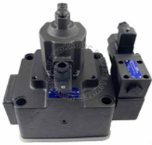
Yuken EFBG 06 Hydraulic Relief Valves