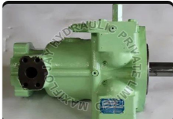
Cast iron Denison Hydraulic Pump