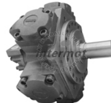
Intermot Hydraulic Motor