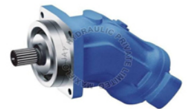
Rexroth A2f Hydraulic Pump