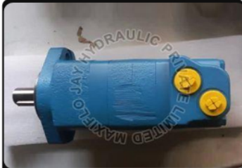
Eaton Hydraulic Motor