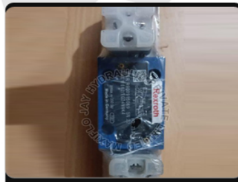
4WE 6 E62 Rexroth Directional Valve