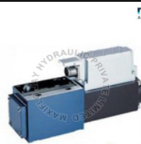
4WRPEH 6 Servo Solenoid Valve