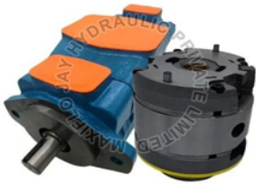
Hydraulic Vane Pump