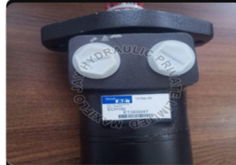
Eton Hydraulic Motor