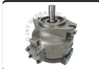
Bosch Hydraulic Vane Pump