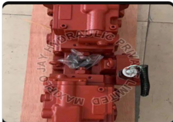
Kawasaki Hydraulic Pump