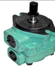
Yuken Y5 Hydraulic Vane Pump