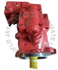
K3VL80 Kawasaki Hydraulic Pump