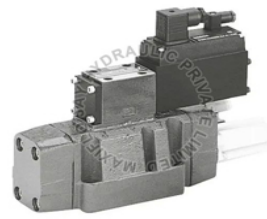
Rexroth Hydraulic Proportional Directional Valve