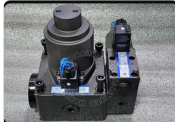
EFBG-03-125-C-15 Proportional Valve