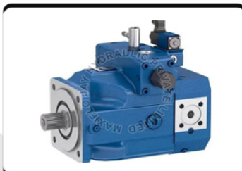
Rexroth A4VSG Series Hydraulic Pump