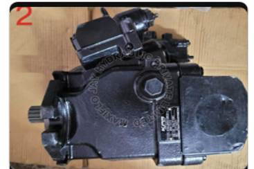
Kpm Hydraulic Pump