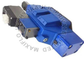
Rexroth 4WRLE 16 V200 Hydraulic Servo Valve