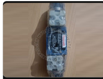
4we6 H Rexroth Direction Valve