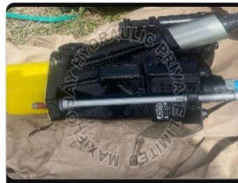
JCB Hydraulic Pump