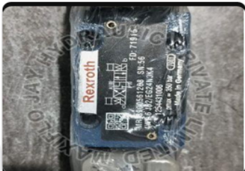
Rexroth Hydraulic Control Valves