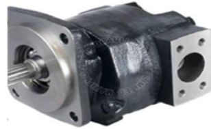
Yuken Hydraulic Pump