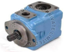
THM Hydraulic Vane Pump