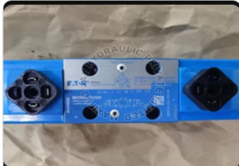
Eaton Vickers Direction Control Valves