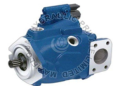
Rexroth A10VO Series Variable Axial Piston Pump