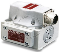
Moong Servo Valve