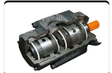
Eaton Vickers Hydraulic Pump