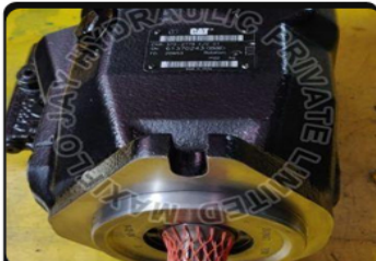
Caterpillar Hydraulic Pump