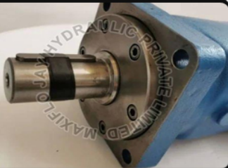
Eaton Char Lynn Hydraulic Motor