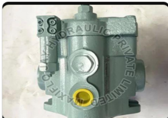
PV20-2R1D-C00-J343 Denison Hydraulic Pump