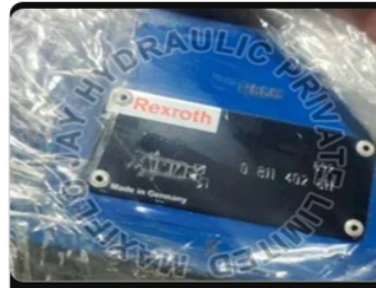
Rexroth Logic Hydraulic Servo Valve