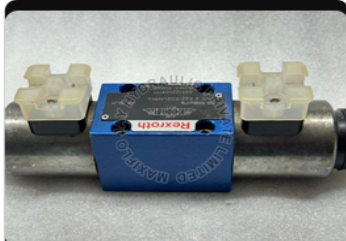
Mild Steel Rexroth Directional Control Valve