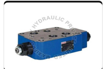
Rexroth Z2FS Throttle Check Valve