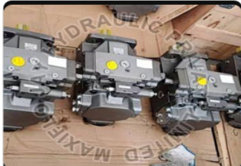
AA4VTG500 Rexroth Hydraulic Pump