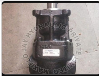
Hydreco Hydraulic Pump