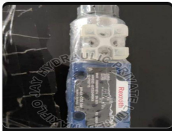
4we 6 D Rexroth Directional Valve