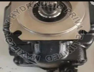
Danfoss Hydraulic Orbital Motor