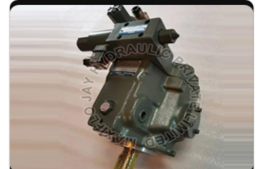
A56 Yuken Hydraulic Piston Pump