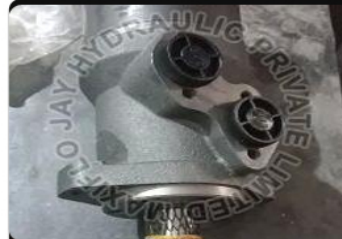
Danfoss OMR 125 Hydraulic Motor