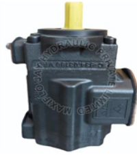
T6CC Veljan Double Vane Pump