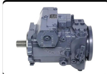
A4V6 Rexroth Hydraulic Pump