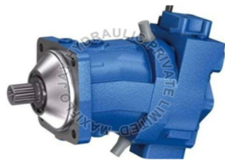
Rexroth WA6VM Series 6X Axial Piston Motor