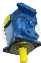
Vickers Axial Piston Pump