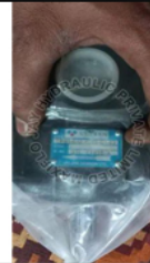
Veljan Hydraulic Vane Pump