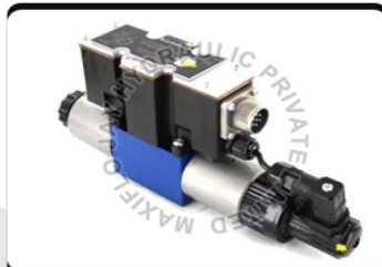
Rexroth Hydraulic Proportional Valve