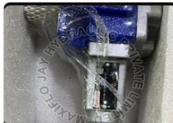
Rexroth Hydraulic Variable Vane Pump