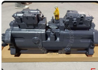
Kawasaki Kpm Hydraulic Pump