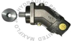
Rexroth Hydraulic Axial Piston Motor