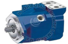
Rexroth A10VM Axial Piston Motor