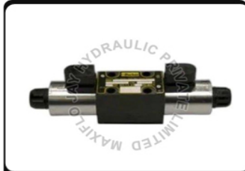
Parker Hydraulic Directional Control Valve