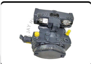
Rexroth A4VG125HWDT1/32L Hydraulic Pump