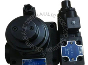
V-Tek EFBG Hydraulic Proportional Valve