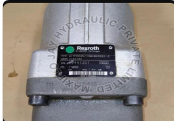
A17FO Rexroth Hydraulic Pump