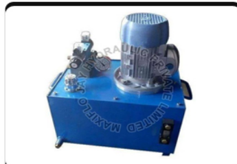
Hydraulic Power Packs