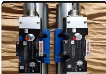
4WRRE10 Rexroth Directional Control Valve