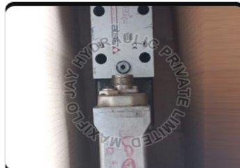
ATOS DLKZOR-TEB Proportional Valves