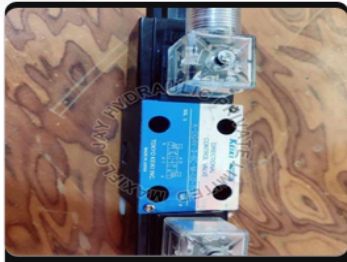
Tokimec Directional Control Valve