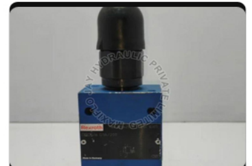
DBDS 6 Rexroth Pressure Relief Valve