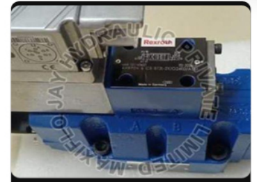
Rexroth Servo Valve