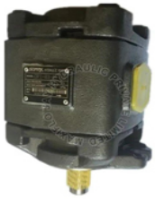
Sunny Hydraulic Pump