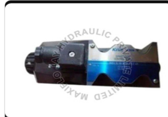
Keiki Tokimec Directional Hydraulic Valve