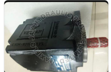
C-934-03185 BFPL Veljan Hydraulic Pump