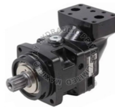
Parker P2145 Series Axial Piston Pump