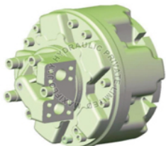
SAI Hydraulic GM 5 Radial Piston Motor