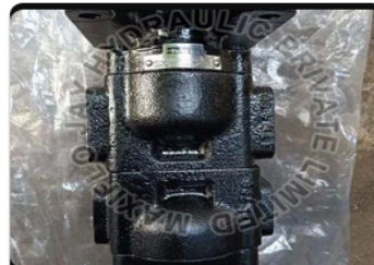
Parker Hydraulic Pump