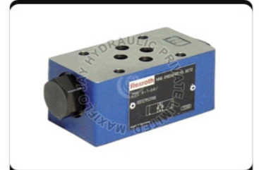
Rexroth Hydraulic Check Valve