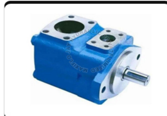
Denson Hydraulic Pump