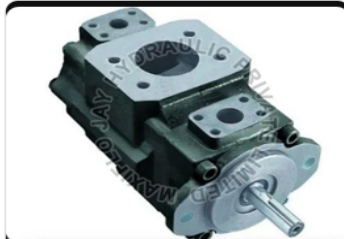
AC Powered Hydraulic Vane Pump