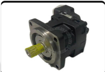
F11 Parker Hydraulic Pump