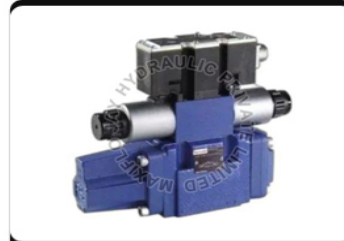
Rexroth Electrohydraulic Servo Valve