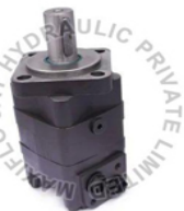
Hydraulic Drive Motor