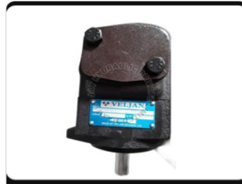
1500RPM Veljan Hydraulic Pump