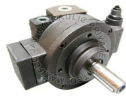
Hydraulic Pump Motor