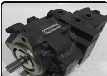
PVD-2B Nachi Radial Piston Pumps