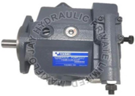
Tokimec Hydraulic Pump