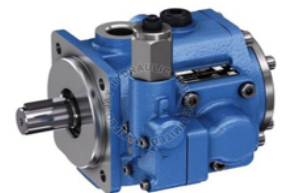
Rexroth Radial Piston Pumps PV Series Hydraulic Pump