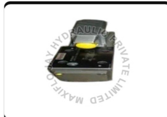
Rexroth Hydraulic Servo Valve