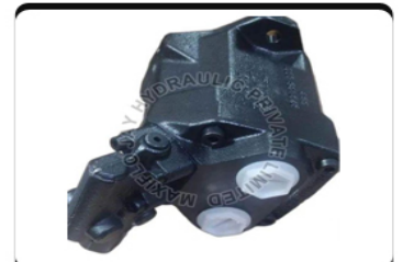
Hydraulic Pressure Control Pump