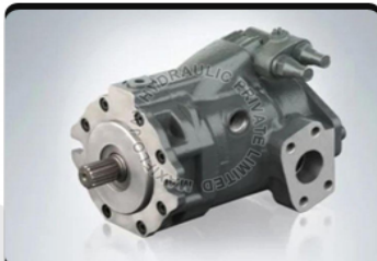
Hawe Hydraulic Pump V30D