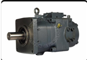
A11VO Rexroth Piston Pump