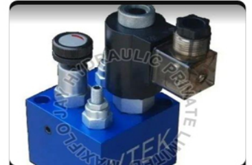
Lift Block Hydraulic Proportional Valve