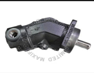
Hydraulic Axial Piston Motor