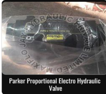
Parker Proportional Electro Hydraulic Valve