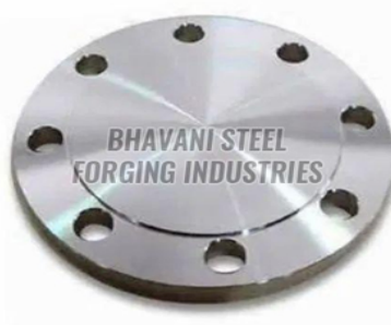
Mild Steel Blind Flange