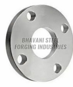
Mild steel flanges