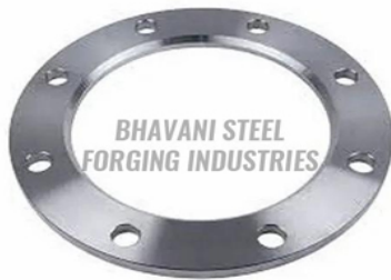
Mild Steel Industrial Flange