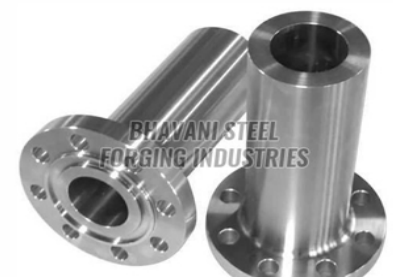
Stainless Steel Long Weld Neck Flange