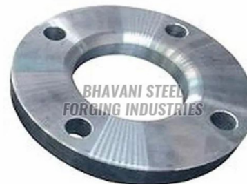
Mild Steel Lap Joint Flanges