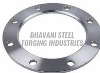
A-105 stainless steel ring joint flange