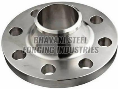
Carbon Steel WNRF Weld Neck Flange