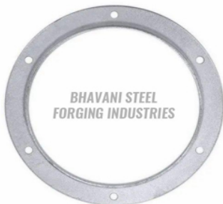
Mild Steel Roller Ring Flange