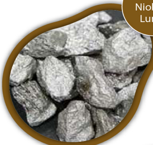
Ferro Niobium Lumps