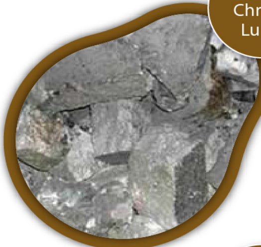
Ferro Chrome Lumps