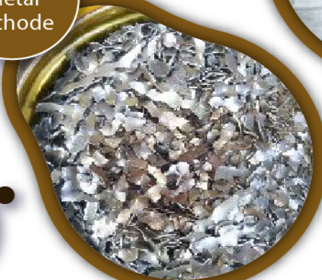
Cobalt Metal Cathode