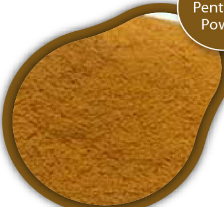
Vanadium Pentoxide Powder