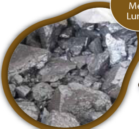
Silicon Metal Lumps