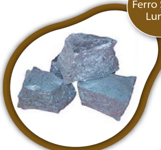
Ferro Silicon Lumps