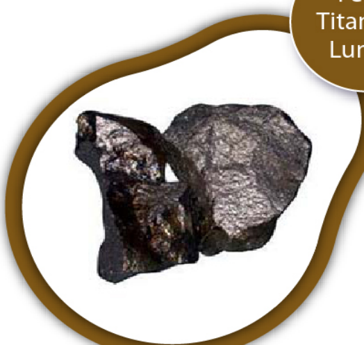
Ferro Titanium Lumps