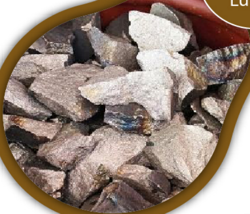
Ferro Vanadium Lumps