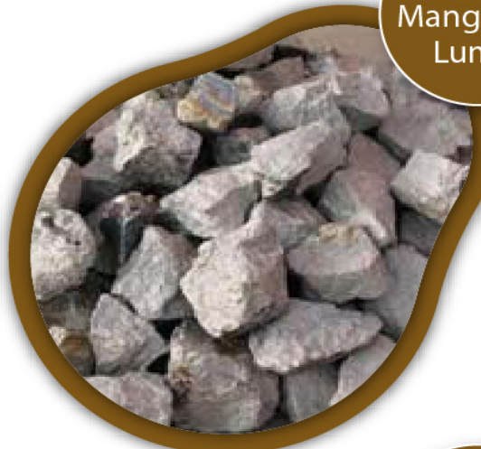
Ferro Manganese Lumps