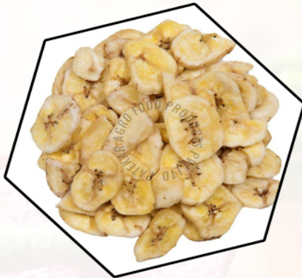
Dehydrated Banana Flakes