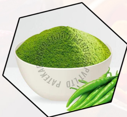
Dehydrated Green Chilli Powder