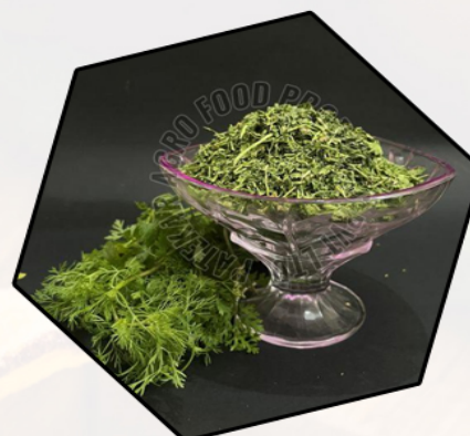
Dehydrated Coriander Flakes