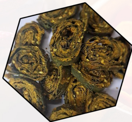
Dehydrated Taro Leaf Roll