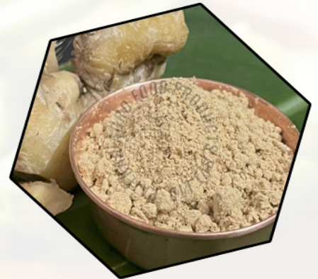
Dehydrated Ginger Powder