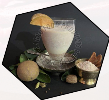
Chikoo Milkshake Powder