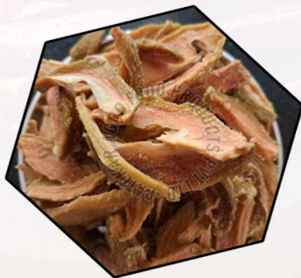
Dehydrated Chikoo Flakes