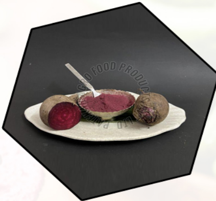
Dehydrated Beetroot Powder