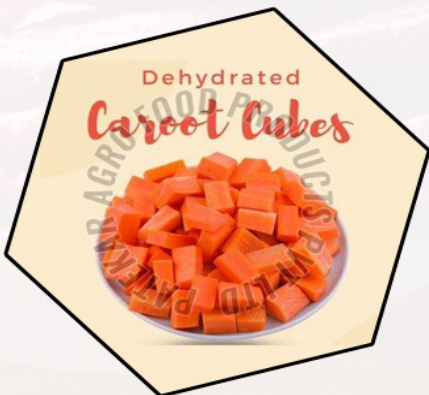
Dehydrated Carrot Cube