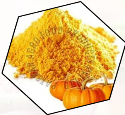
Dehydrated Pumpkin Powder