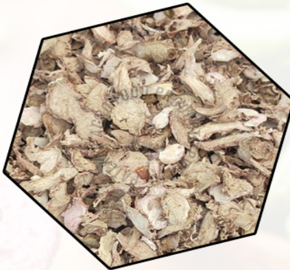
Dehydrated Ginger Flakes