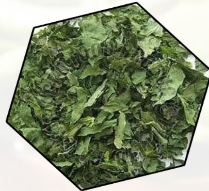
Dehydrated Spinach Flakes