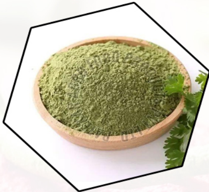
Dehydrated Coriander Leaves Powder