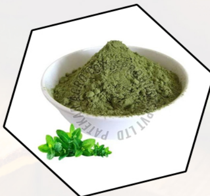
Dehydrated Mint Powder