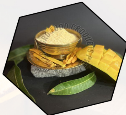
Dehydrated Kesar Mango Powder