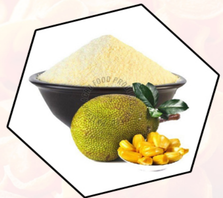
Dehydrated Jackfruit Powder