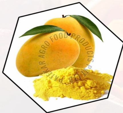
Dehydrated Alphonso Mango Powder