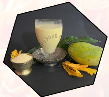
Mango Milkshake Powder