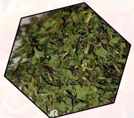
Dehydrated Mint Flakes