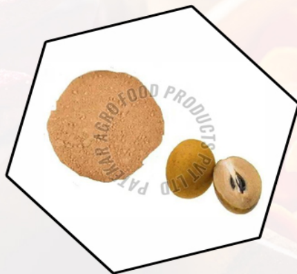
Dehydrated Chikoo Powder