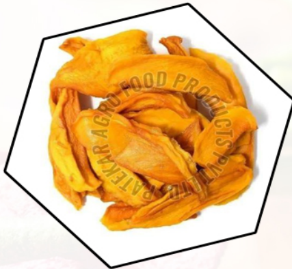
Dehydrated Kesar Mango Slice