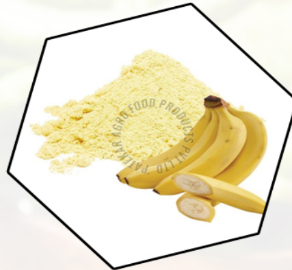
Dehydrated Banana Powder