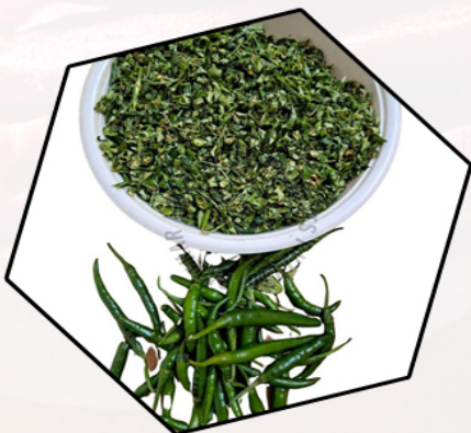
Dehydrated Green Chilli Flakes