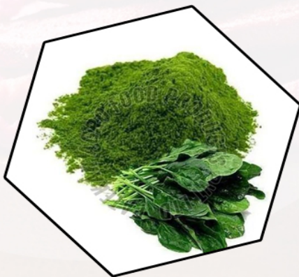
Dehydrated Spinach Powder