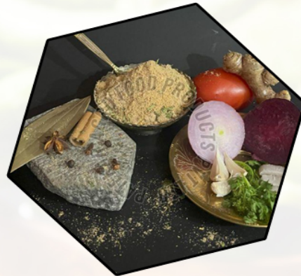
All Purpose Gravy Mix