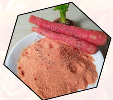
Dehydrated Carrot Powder