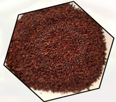
Dehydrated Beetroot TBC Cut