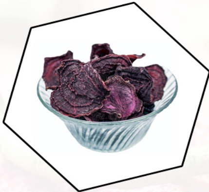
Dehydrated Beetroot Flakes