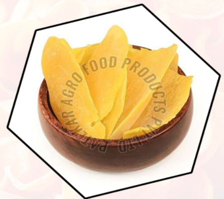
Dehydrated Alphonso Mango Slice